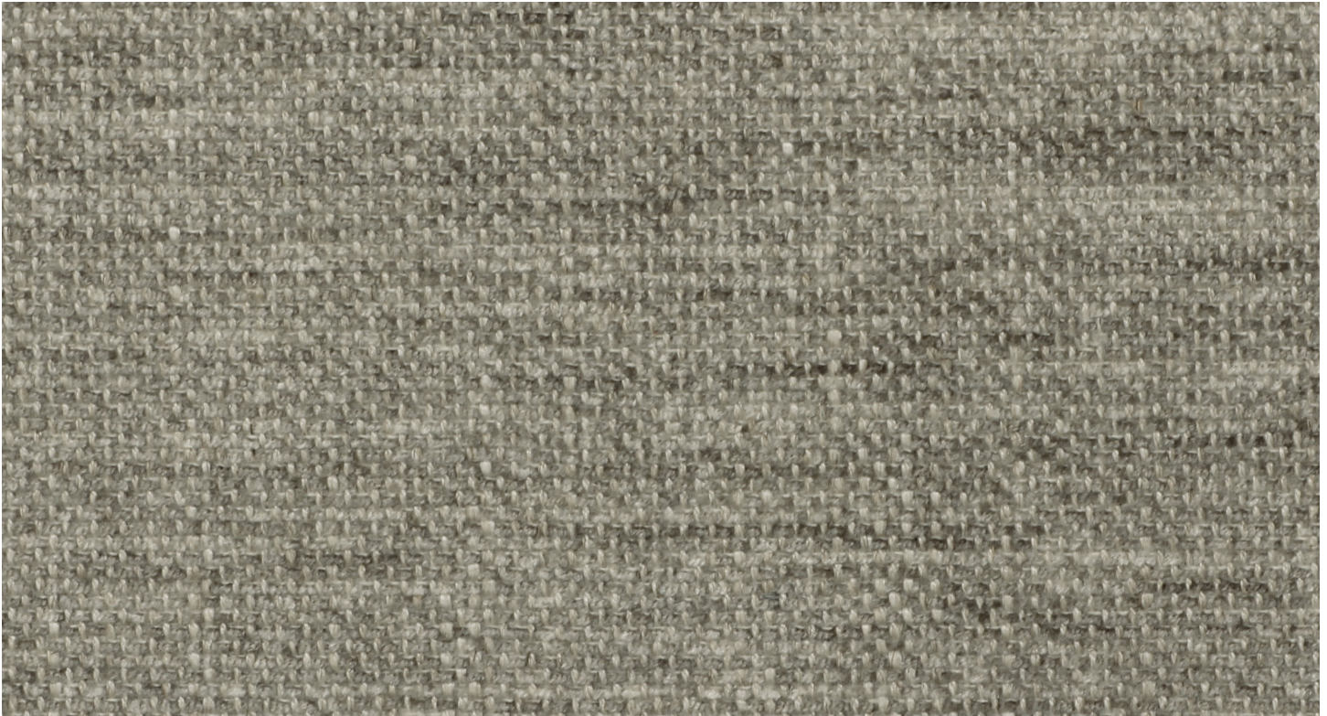
WX 0001 ADRI Linen