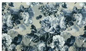
H0 0004 3459 Sable

DESIGN NUMBER: H0 3459 DESIGN NAME: BOTANIQUE COLLECTION: Lelievre CONTENT: 100% Cotton COUNTRY OF ORIGIN: Austria WIDTH: 55" REPEAT: L: 44.75" x W: 27.50"