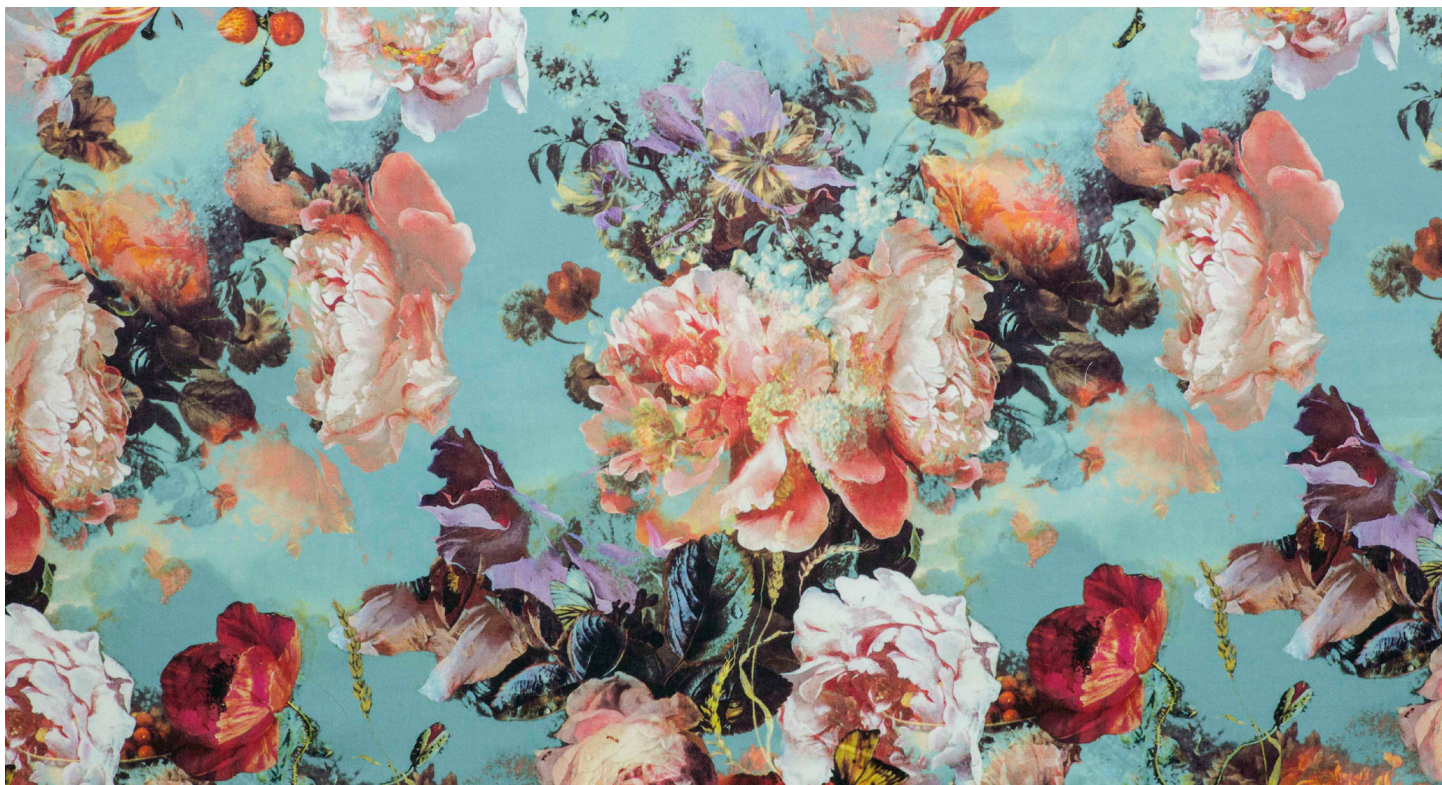
H0 0001 3459 Bleuet