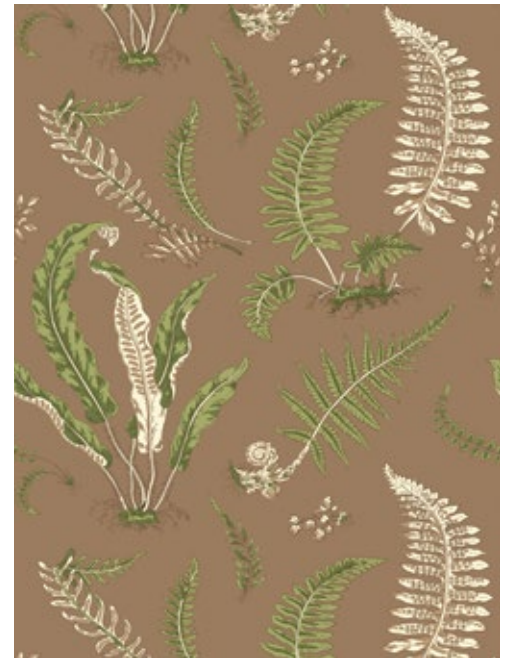
GREENS ON BROWN SC 0005 WP88593D