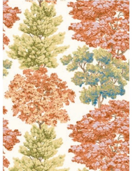
AUTUMN WW 0003 WP88583D