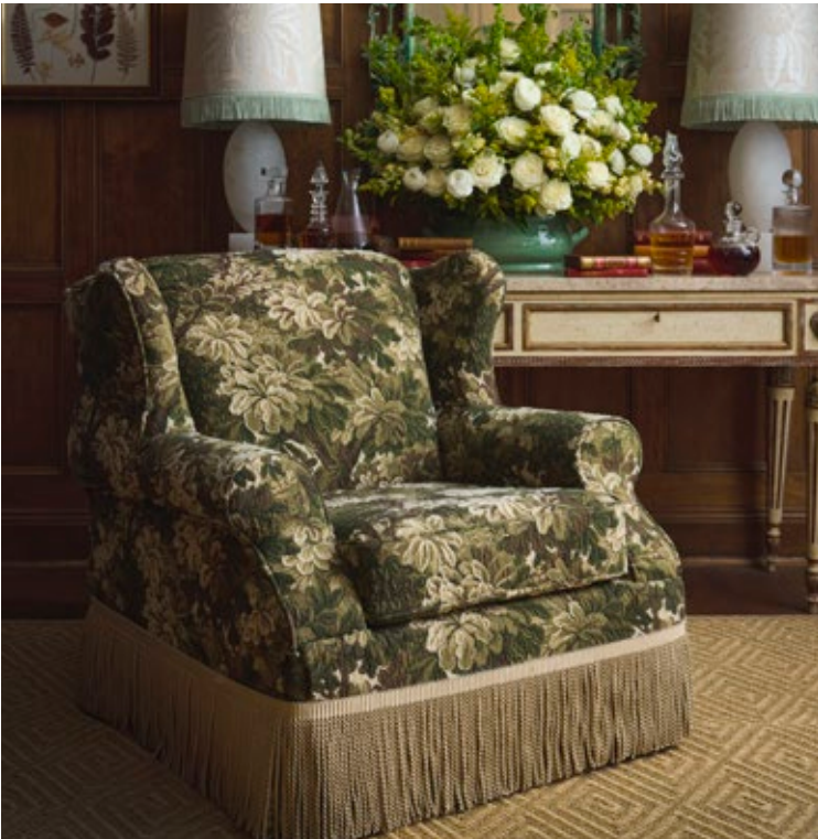
RIDGE EDGE COTTON IN MOSS BZ 0036 060C