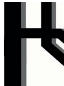
ONYX SC 0007 WP88582D