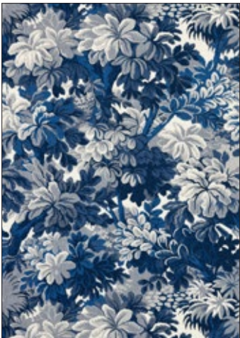
RIDGE EDGE 2 COLORWAYS (BZ 060W & BZ 060C)