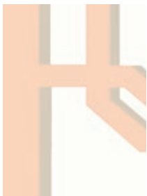
PEACH SC 0002 WP88582D