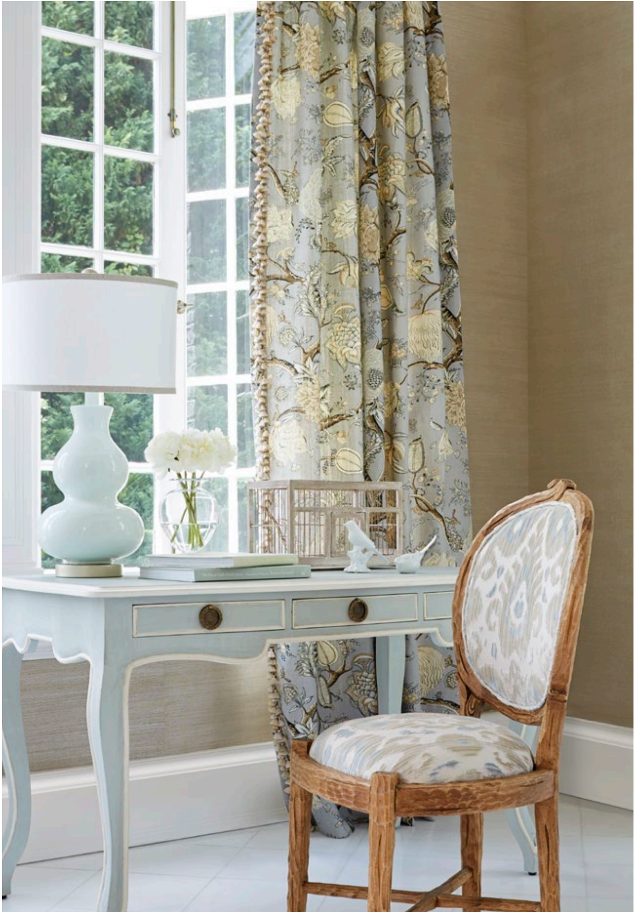
PONDICHERY LINEN PRINT, NEWPORT TASSEL & TASHKENT VELVET