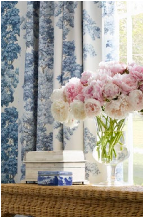
LIGHT BLUE CN 0002 0071