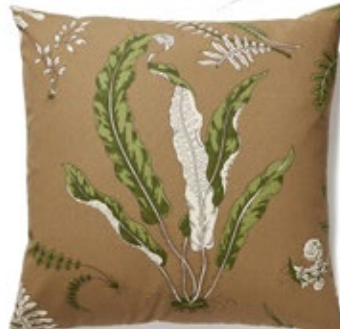
GREENS ON BROWN FABRIC - SC 0005 16425 OUTDOOR PILLOW - SC 0005 ELSIEOUT