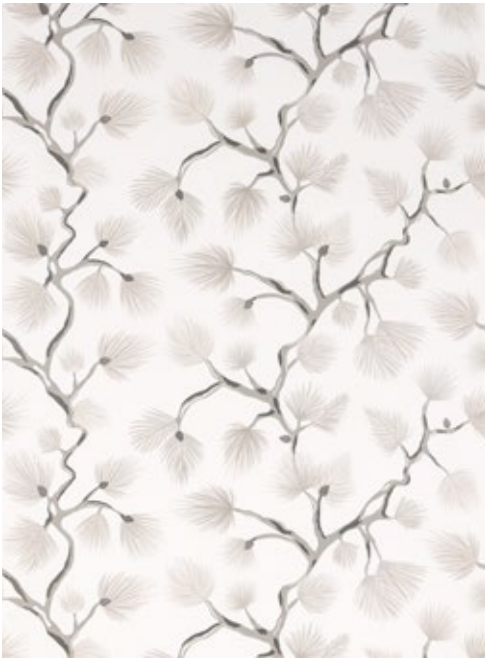
SNOW SC 0001 WP88593D