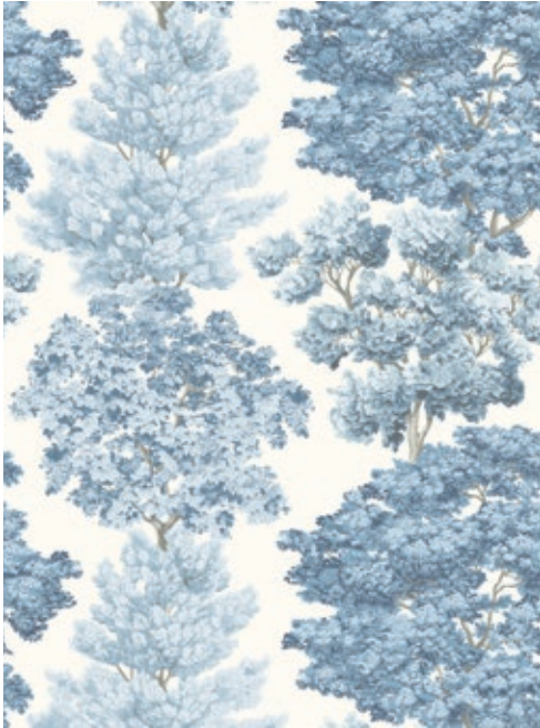
LIGHT BLUE WW 0002 WP88583D