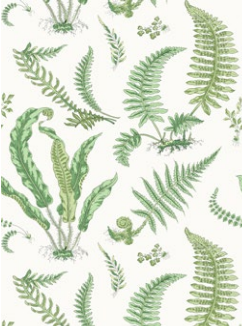
FERN SC 0006 WP88593D