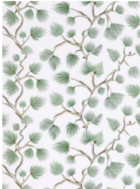
FERN SC 0005 WP88593D