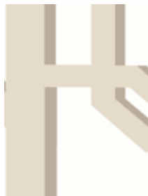
TOFFEE SC 0003 WP88582D