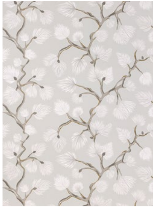
STONE SC 0001 WP88593D