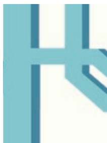
TURQUOISE SC 0010 WP88582D