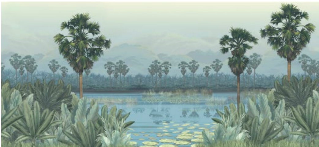
TROPICAL MURAL - 9 PANEL SET - SC 0001 WP88591