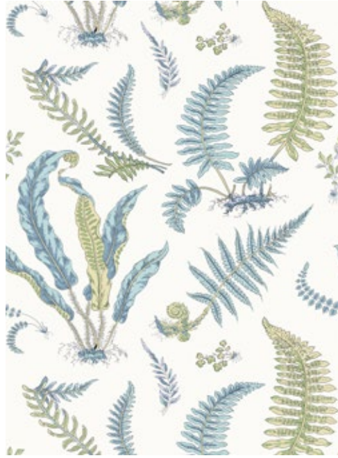
BEACH GLASS SC 0003 WP88593D