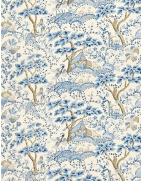
PORCELAIN SC 0001 16590

Kelmescott, an early twentieth century hand block print was discovered in an English archive and has been reproduced using the original wood blocks, which were first cut and printed in July 1924. The multicolored 50" wide design is composed of 40 separate blocks and requires 80 blocks to complete one full yard of printing.