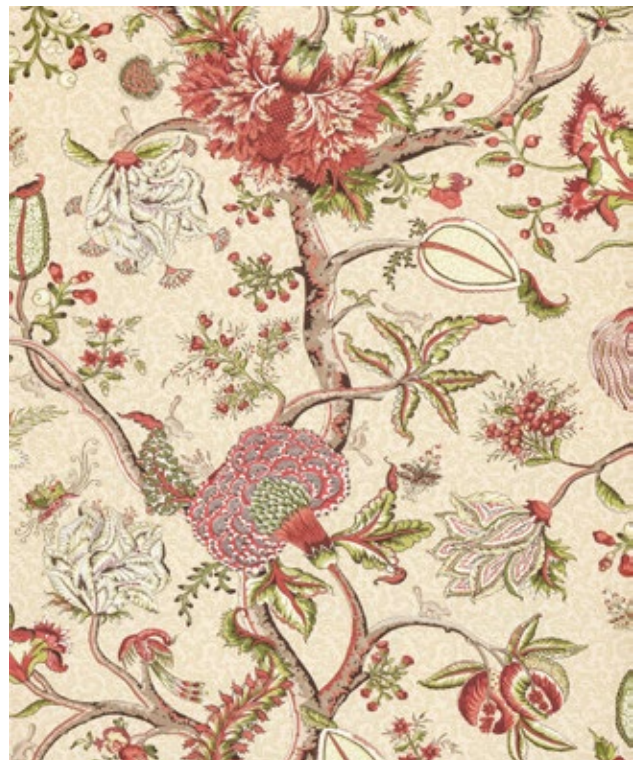
TURKEY RED ON LIME FERN

WALLCOVERING - SC 0003 WP88585 / FABRIC - SC 0003 16430