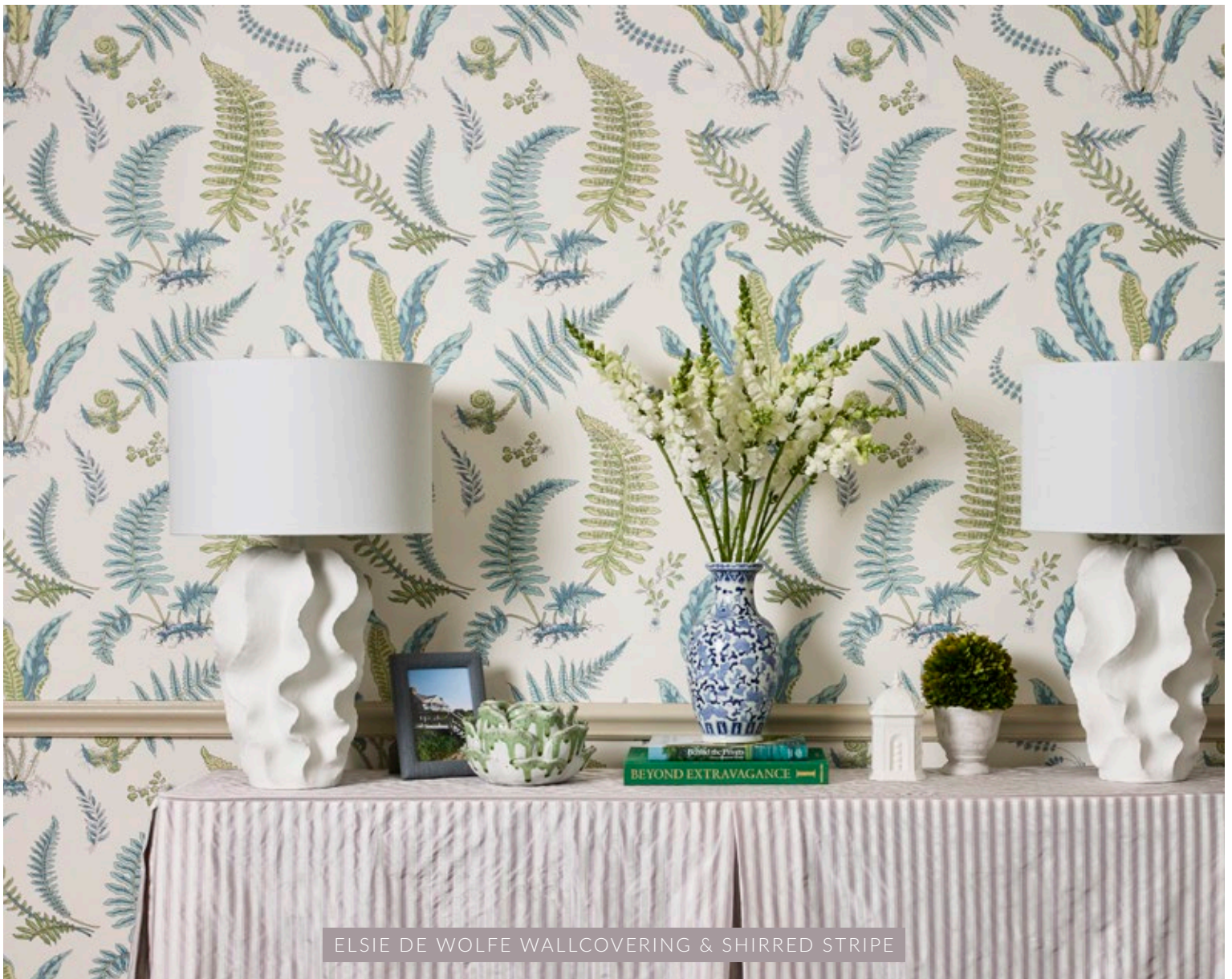
ELSIE DE WOLFE WALLCOVERING & SHIRRED STRIPE