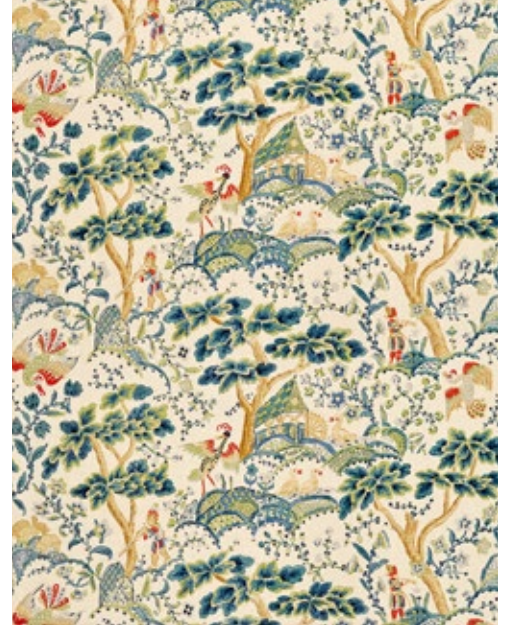
PEACOCK ON SAND SC 0003 16590