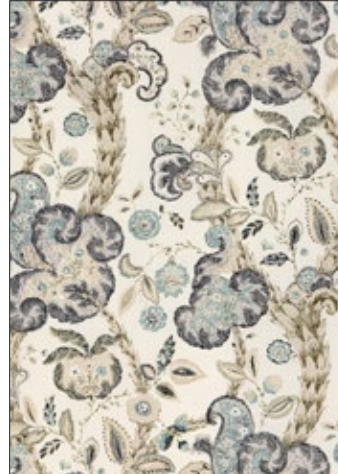
CUMBRIA HAND BLOCK PRINT 4 COLORWAYS (SC 16603)