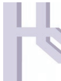
LAVENDER SC 0013 WP88582D