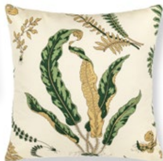
GREENS ON OFF-WHITE FABRIC - SC 0001 16425 OUTDOOR PILLOW - SC 0001 ELSIEOUT