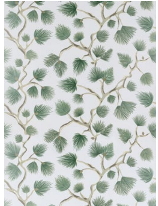
EVERGREEN SC 0006 WP88593D