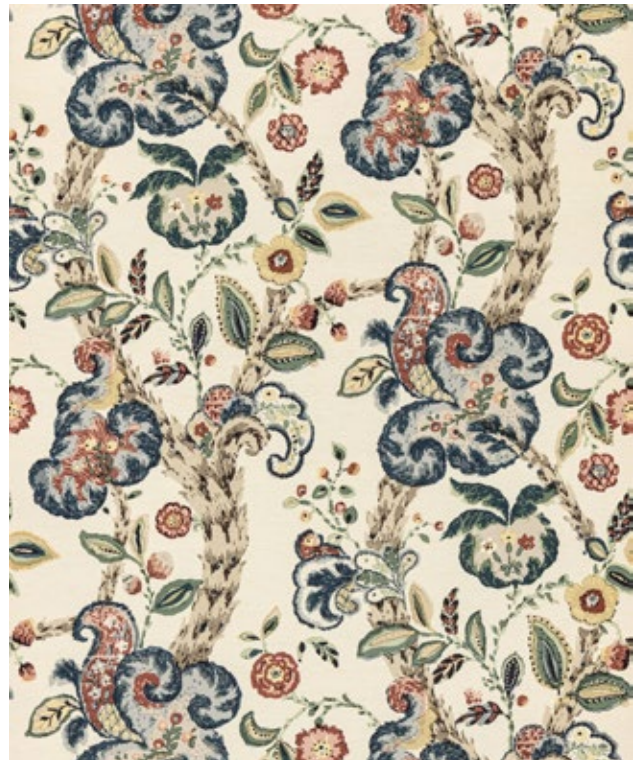
MULTI ON CREAM WALLCOVERING - SC 0004 WP88589 / FABRIC SC 0004 16603