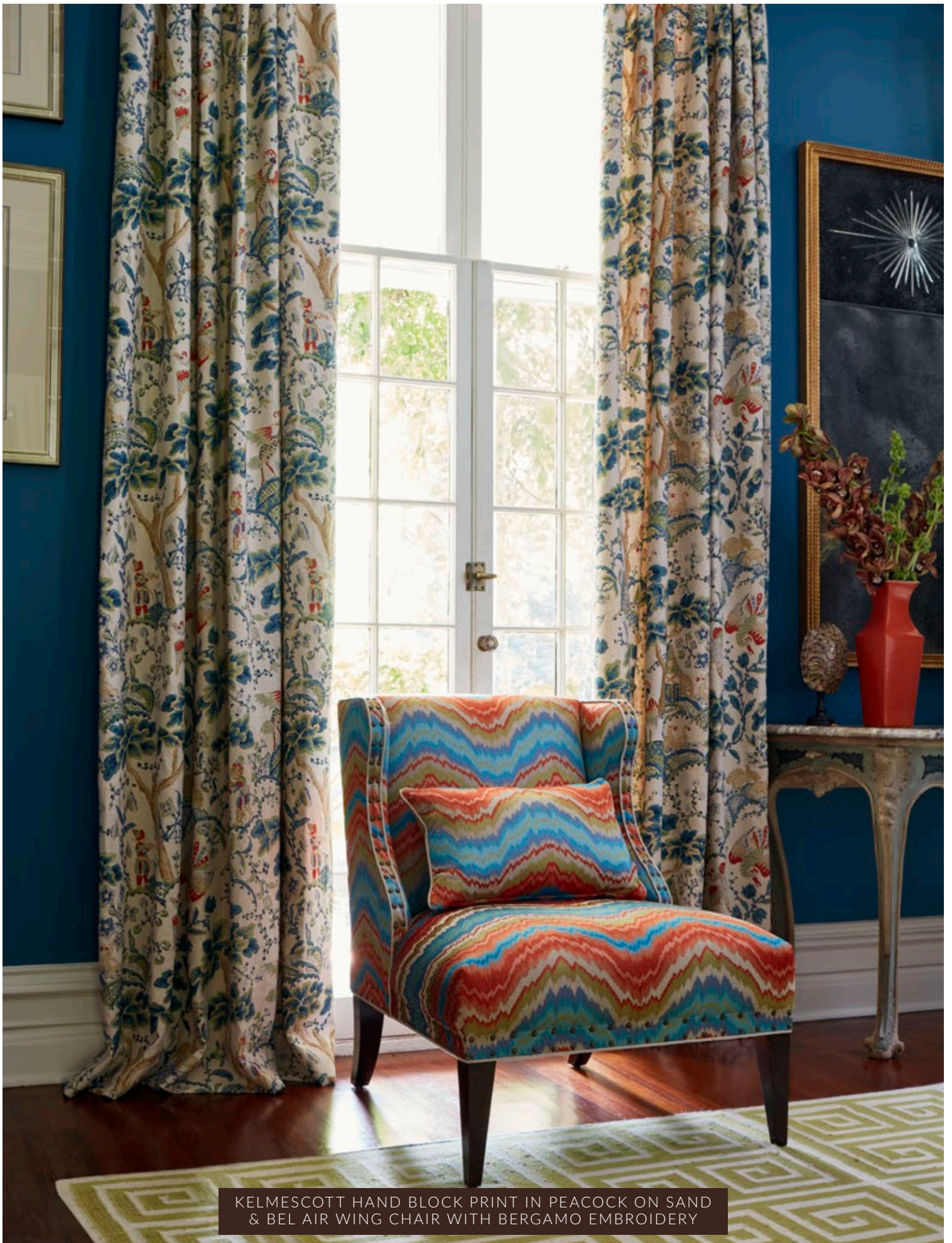
KELMESCOTT HAND BLOCK PRINT IN PEACOCK ON SAND & BEL AIR WING CHAIR WITH BERGAMO EMBROIDERY