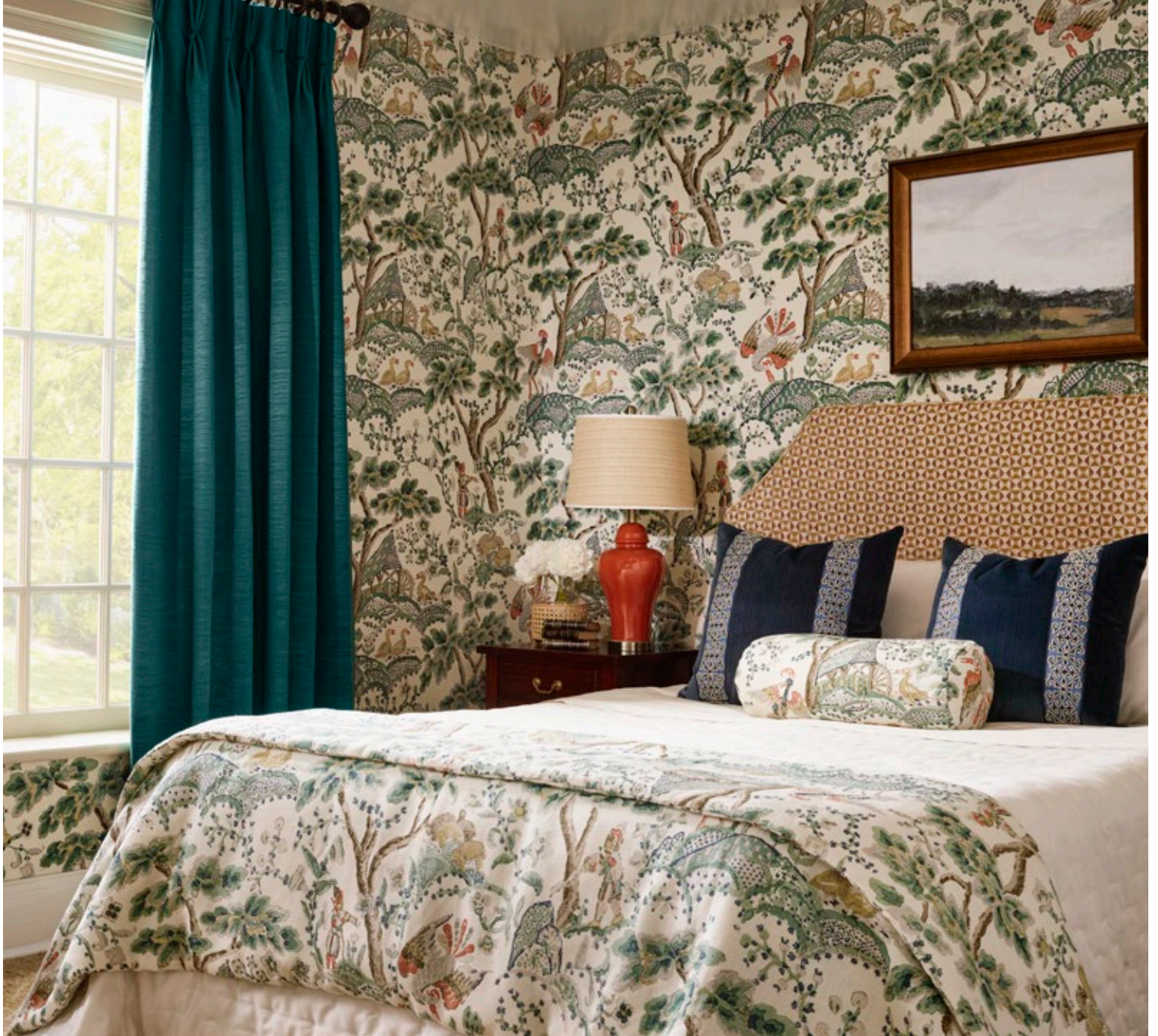
KELMESCOTT IN LEAF ON IVORY, RIVA MOIRÉ & PARLOR VELVET