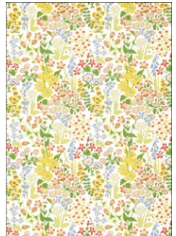
NYMPH FLORAL 3 COLORWAYS (GW 16630)