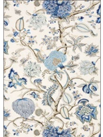
PONDICHERRY 4 COLORWAYS (SC 16556 & SC 16430)