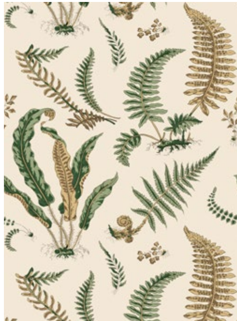
GREENS ON OFF WHITE SC 0001 WP88593D