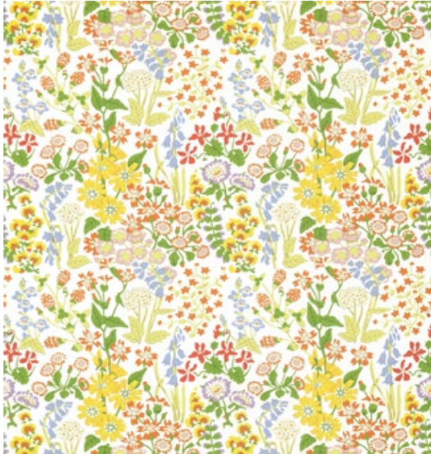
SPRINGTIME GW 0001 WP88586