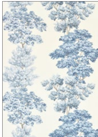
CENTRAL PARK 3 COLORWAYS (CN 0071)