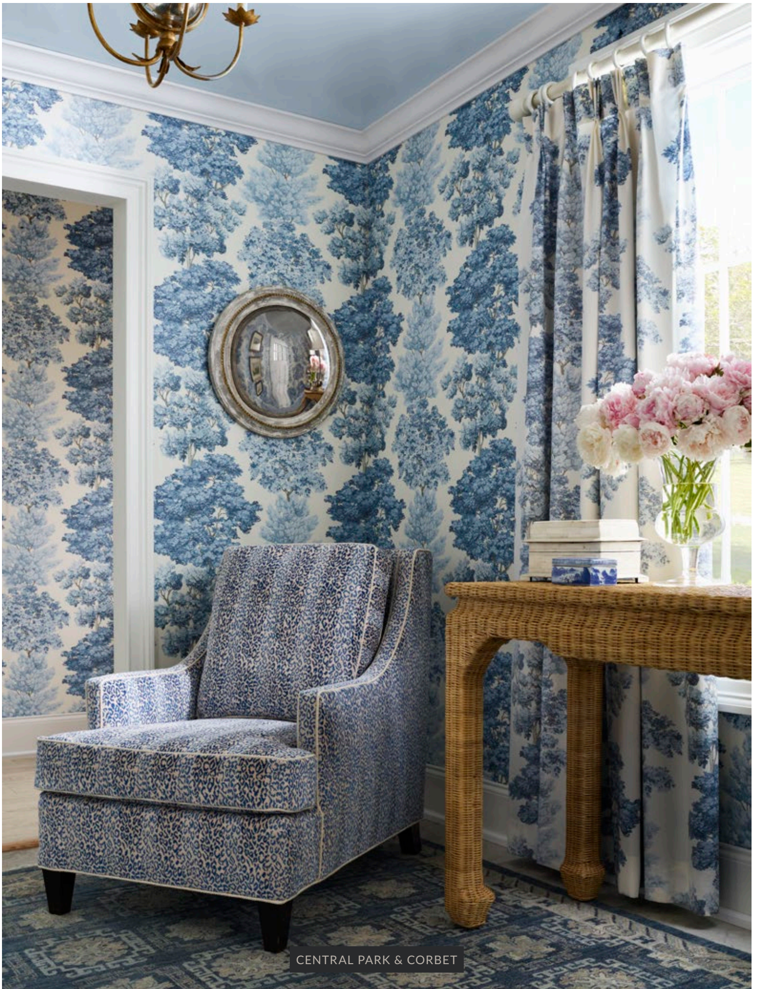
CENTRAL PARK & CORBET