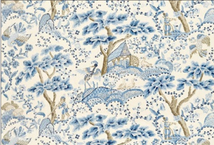
KELMESCOTT HAND BLOCK PRINT 3 COLORWAYS (SC 16590)