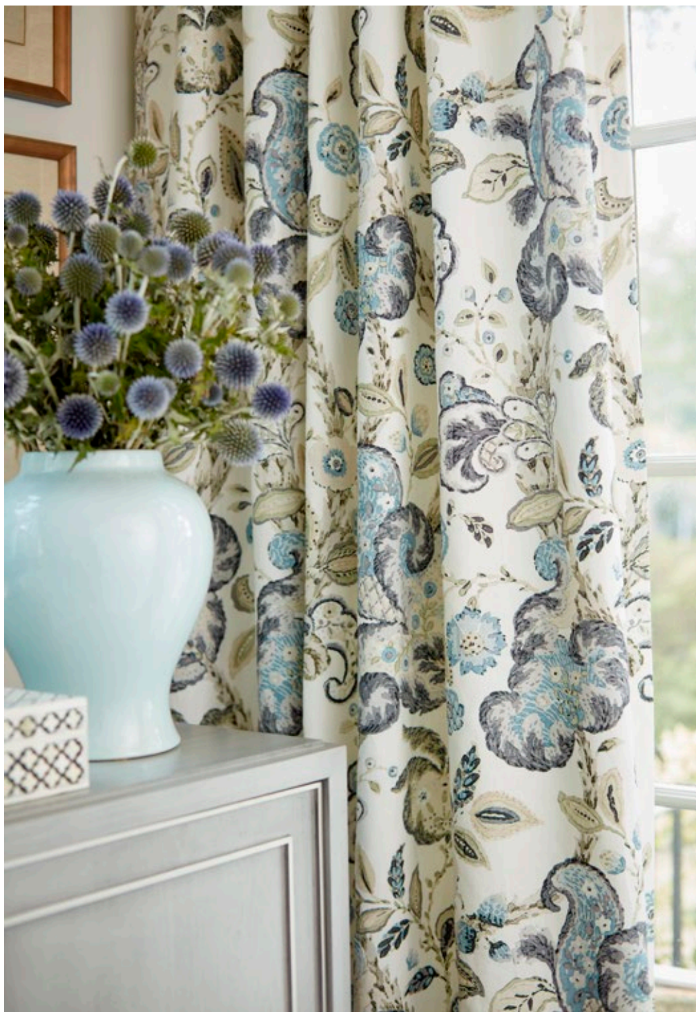
CUMBRIA HAND BLOCK PRINT