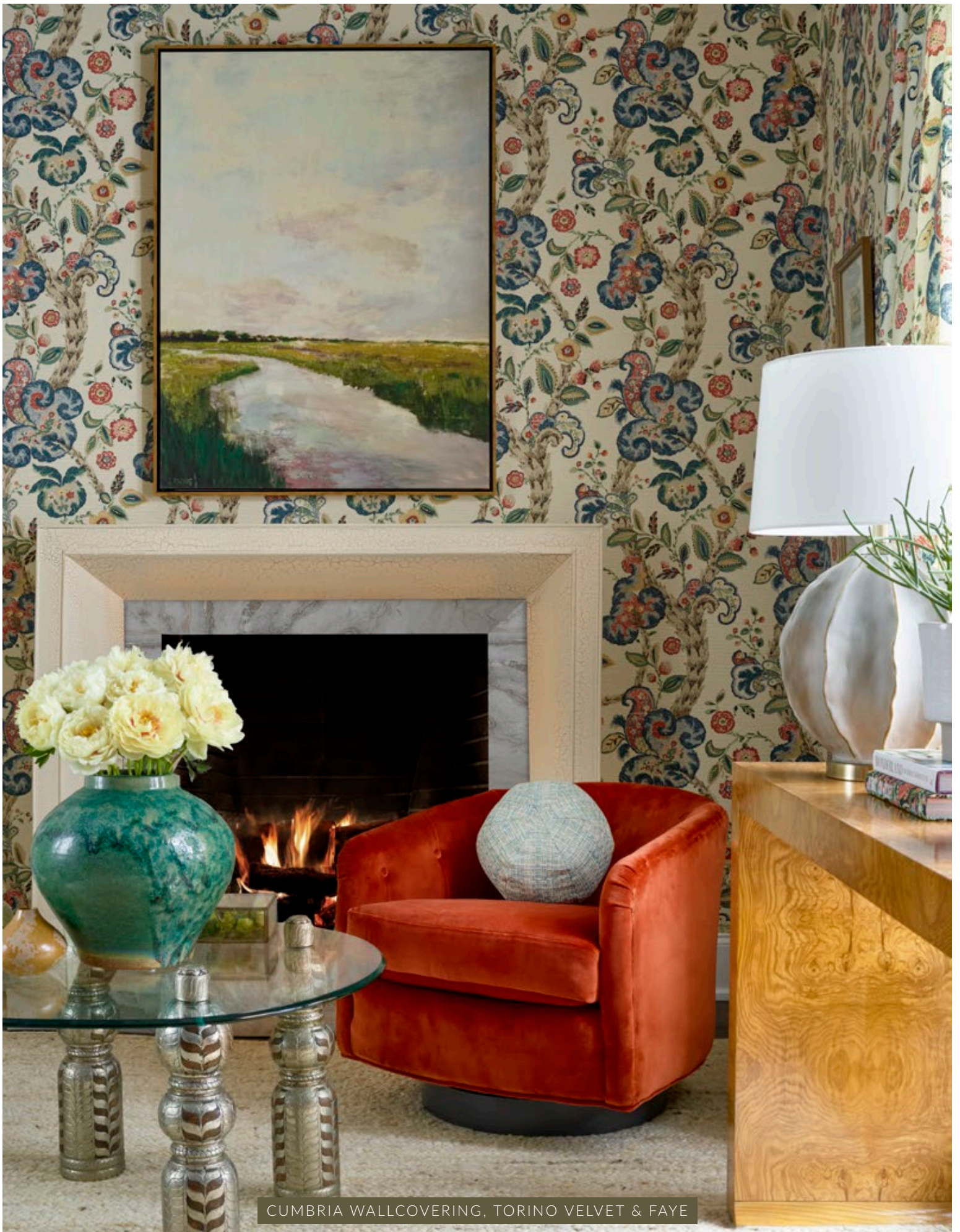
CUMBRIA WALLCOVERING, TORINO VELVET & FAYE