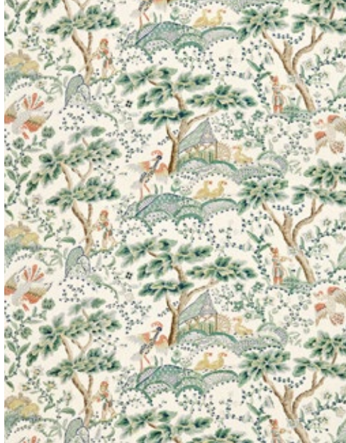
LEAF ON IVORY SC 0002 16590