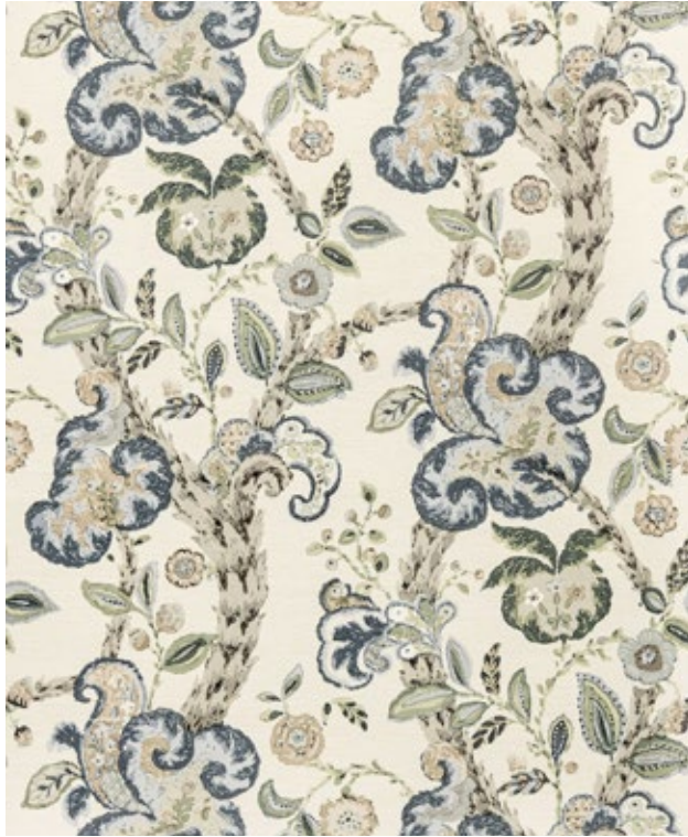
AQUAMARINE ON IVORY WALLCOVERING - SC 0001 WP88589 / FABRIC SC 0001 16603

This lively hand block print was first created in 1922 features a stylized "Tree of Life" motif. The pattern is digitally printed, on a grasscloth ground, with pigment-based dyes that fully emphasize the color variation typical of hand block printing. The colors include newer palettes of neutrals, cobalt blues and soft aquamarine, as well as an updated multicolored combination based on the early twentieth century document. Directly interpreted from the original pattern as a fabric, it has been rescaled to make a coordinating grasscloth wallcovering.