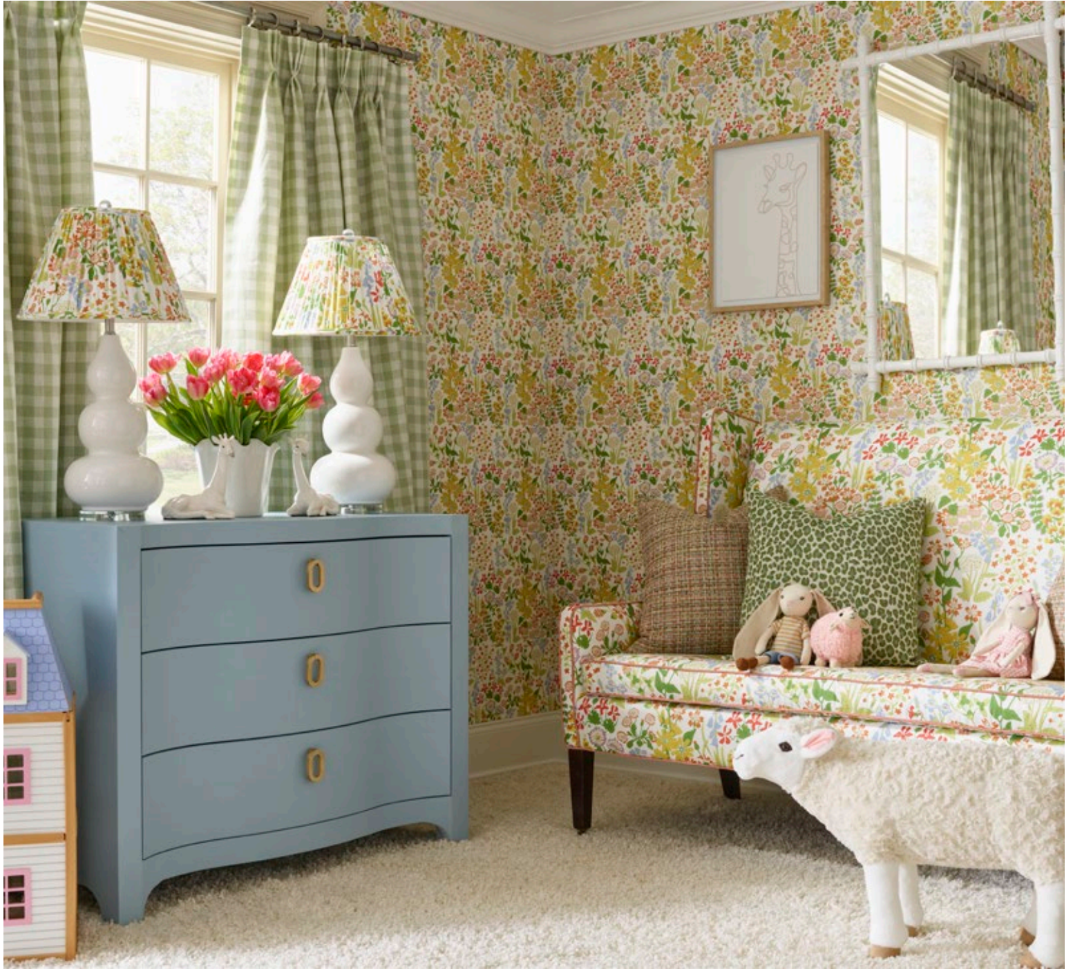
NYMPH FLORAL, SWEDISH LINEN CHECK, FAYE & BACKYARD BENGAL