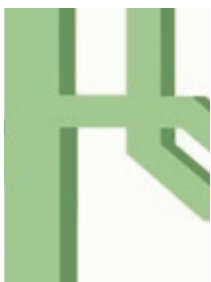
PEAR SC 0009 WP88582D