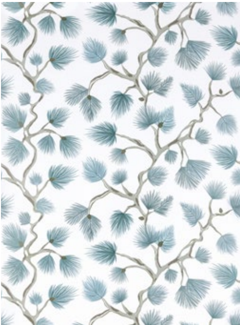
TEAL SC 0004 WP88593D