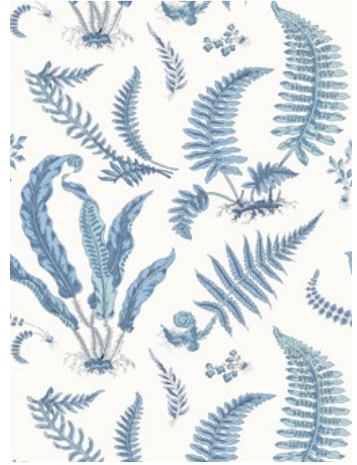
ULTRAMARINE SC 0004 WP88593D