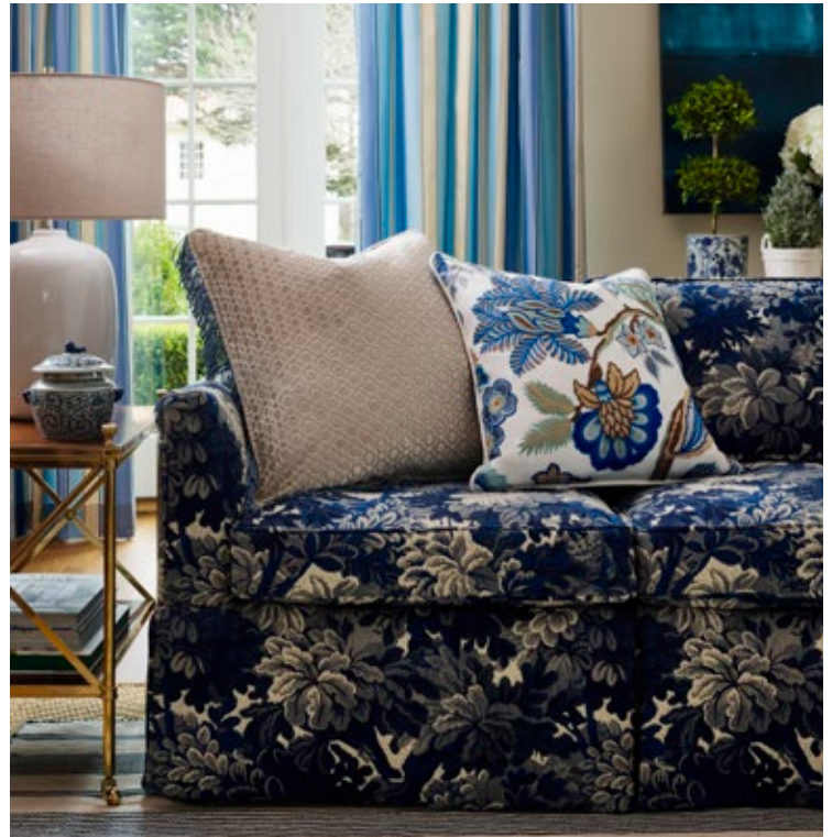
RIDGE EDGE WOOL IN BLUE SHADOW BZ 0062 060W