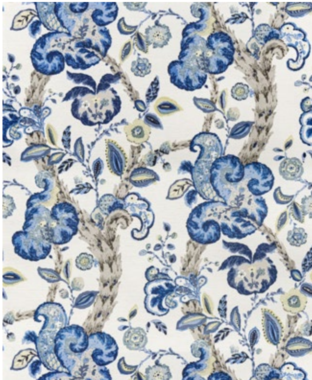
CHINA BLUE ON IVORY WALLCOVERING - SC 0003 WP88589 / FABRIC SC 0003 16603