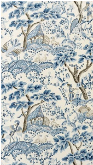
PORCELAIN SC 0001 WP88588

NEW IN 2024 - Kelmescott Wallcovering is digitally printed, on a 34" wide grasscloth ground, with pigment-based dyes that fully emphasize the color variation typical of hand block printing. Freshly interpreted and rescaled for the story to read vertically for a wall friendly layout.