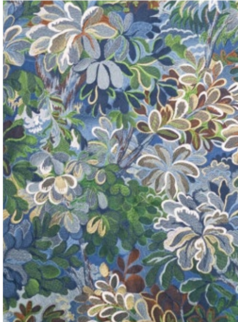
MOSS WW 0002 WP88590