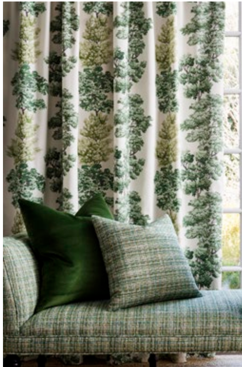
GREEN CN 0001 0071