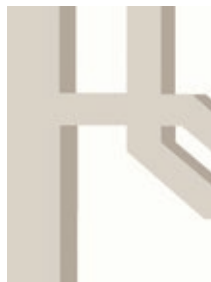
TAUPE SC 0004 WP88582D