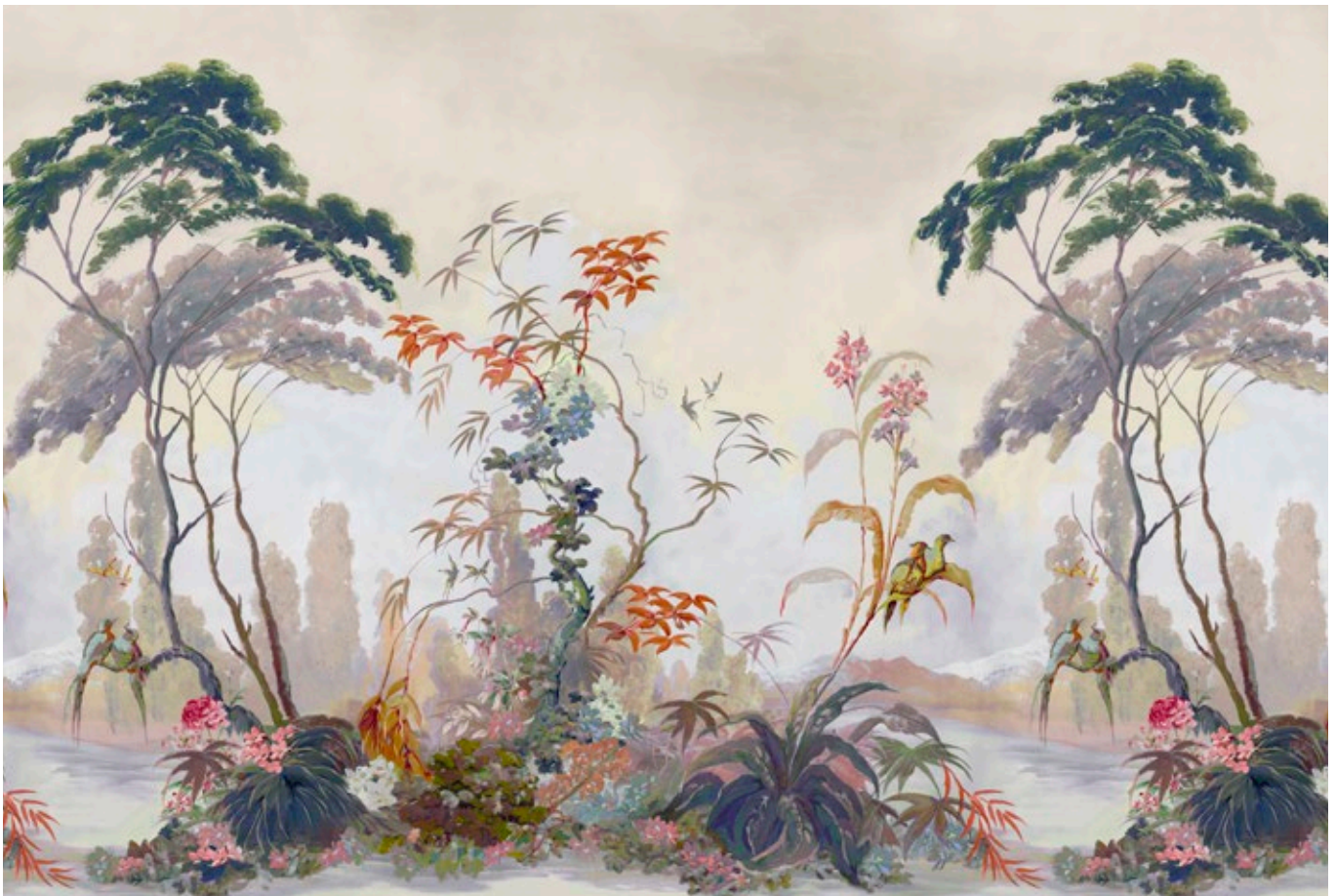
SUNSET SC 0003 WP88587