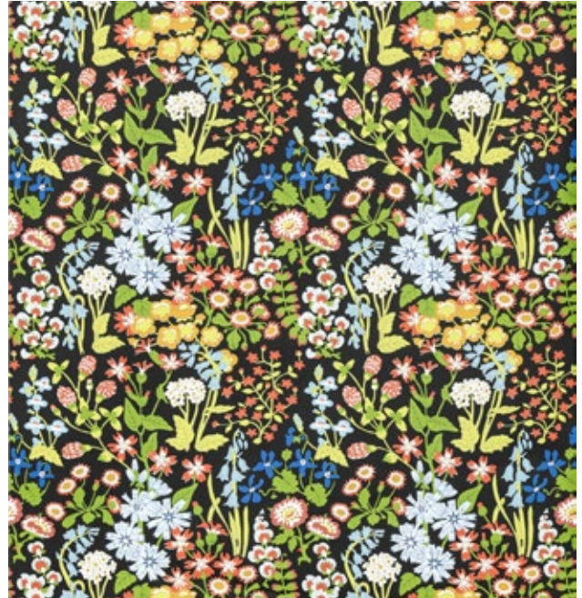
BLACK MULTI GW 0002 WP88586