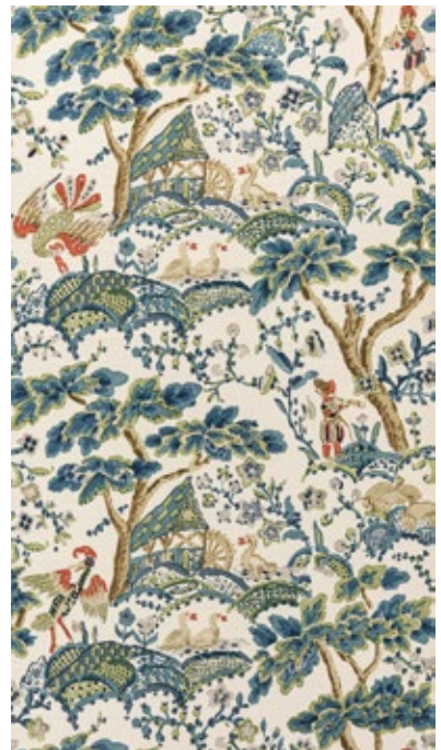
PEACOCK ON SAND SC 0003 WP88588