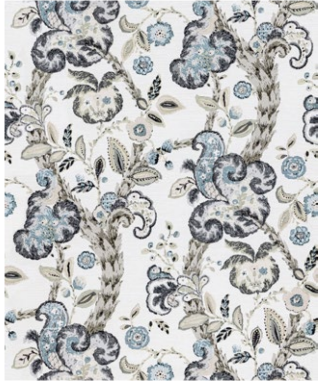
SMOKE ON IVORY WALLCOVERING - SC 0002 WP88589 / FABRIC SC 0002 16603