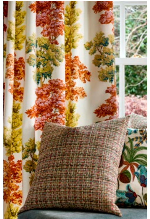
AUTUMN CN 0003 0071