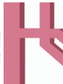
RASPBERRY SC 0014 WP88582D