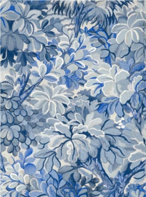
BLUE STONE WW 0001 WP88590