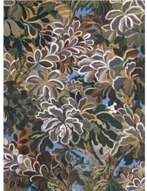
MIDNIGHT LEAF WW 0003 WP88590