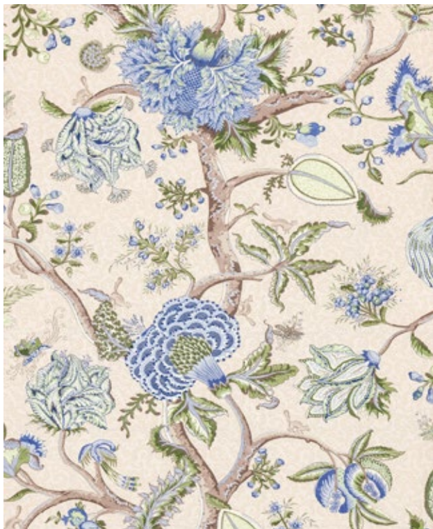
BLUE GREEN ON CREAM FERN

WALLCOVERING - SC 0001 WP88585 / FABRIC - SC 0001 16556