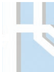
POWDER BLUE SC 0012 WP88582D