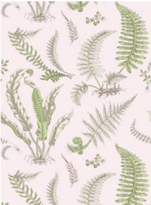
BALLET SLIPPER SC 0002 WP88593D