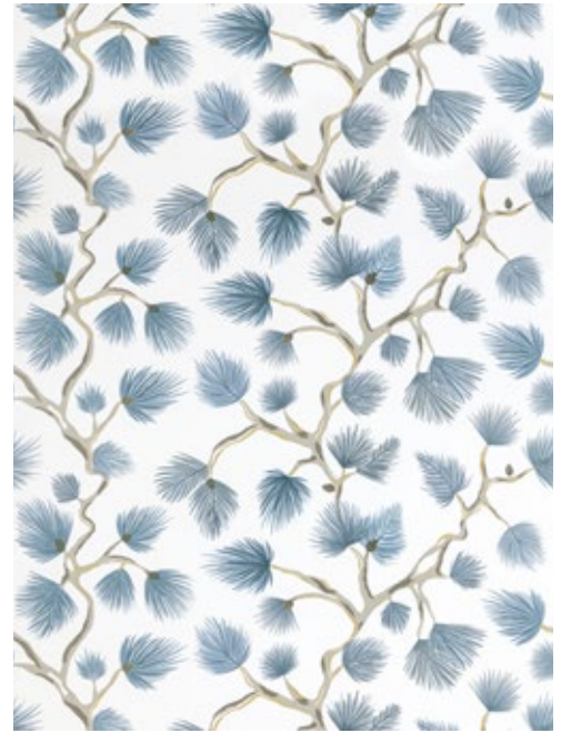
BLUE JAY SC 0003 WP88593D