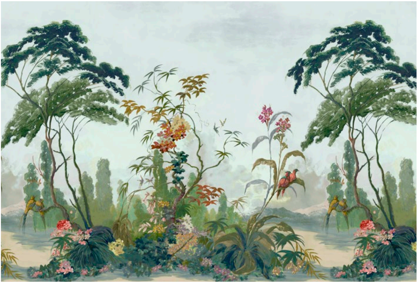
EVERGLADE SC 0002 WP88587