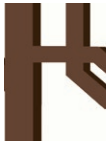
AFFOGATO SC 0005 WP88582D