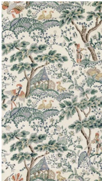
LEAF ON IVORY SC 0002 WP88588