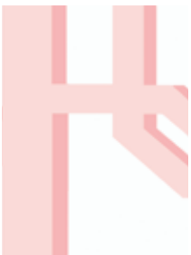
BALLET SLIPPER SC 0001 WP88582D