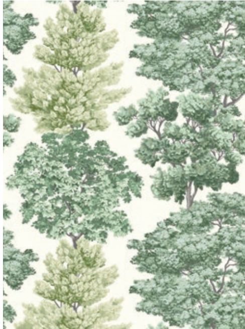
GREEN WW 0001 WP88583D