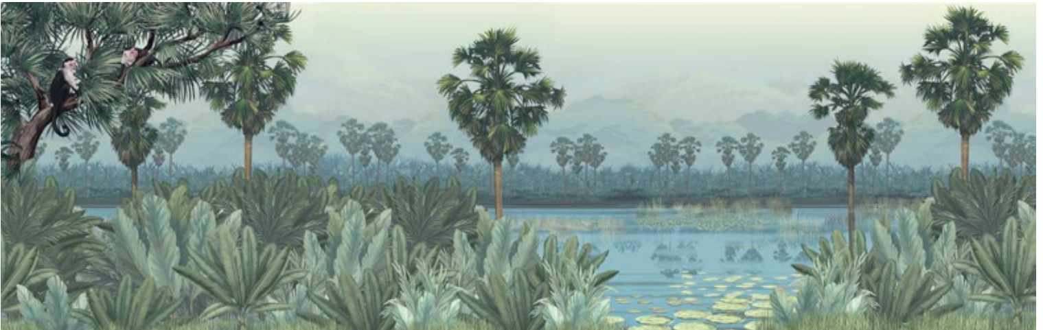
TROPICAL MURAL - 13 PANEL SET - SC 0001 WP88591B