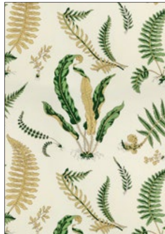
ELSIE DE WOLFFE OUTDOOR 2 COLORWAYS (SC 16425)