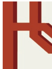
LACQUER RED SC 0006 WP88582D