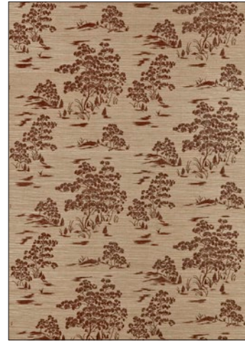
KATSURA EMBROIDERED TOILE