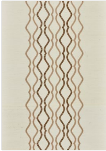
VALENTINA EMBELLISHED SISAL