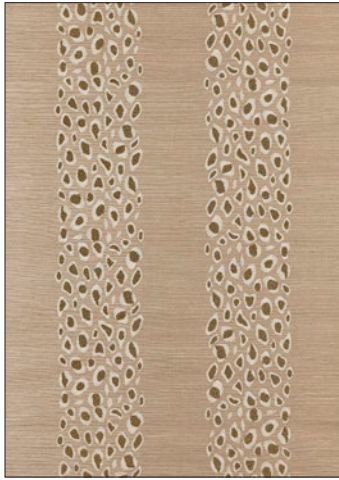
CATWALK EMBELLISHED GRASSCLOTH