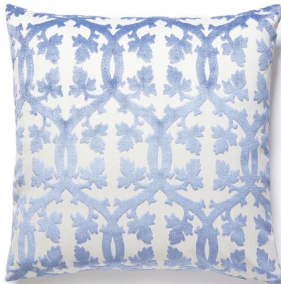
FALK MANOR HOUSE