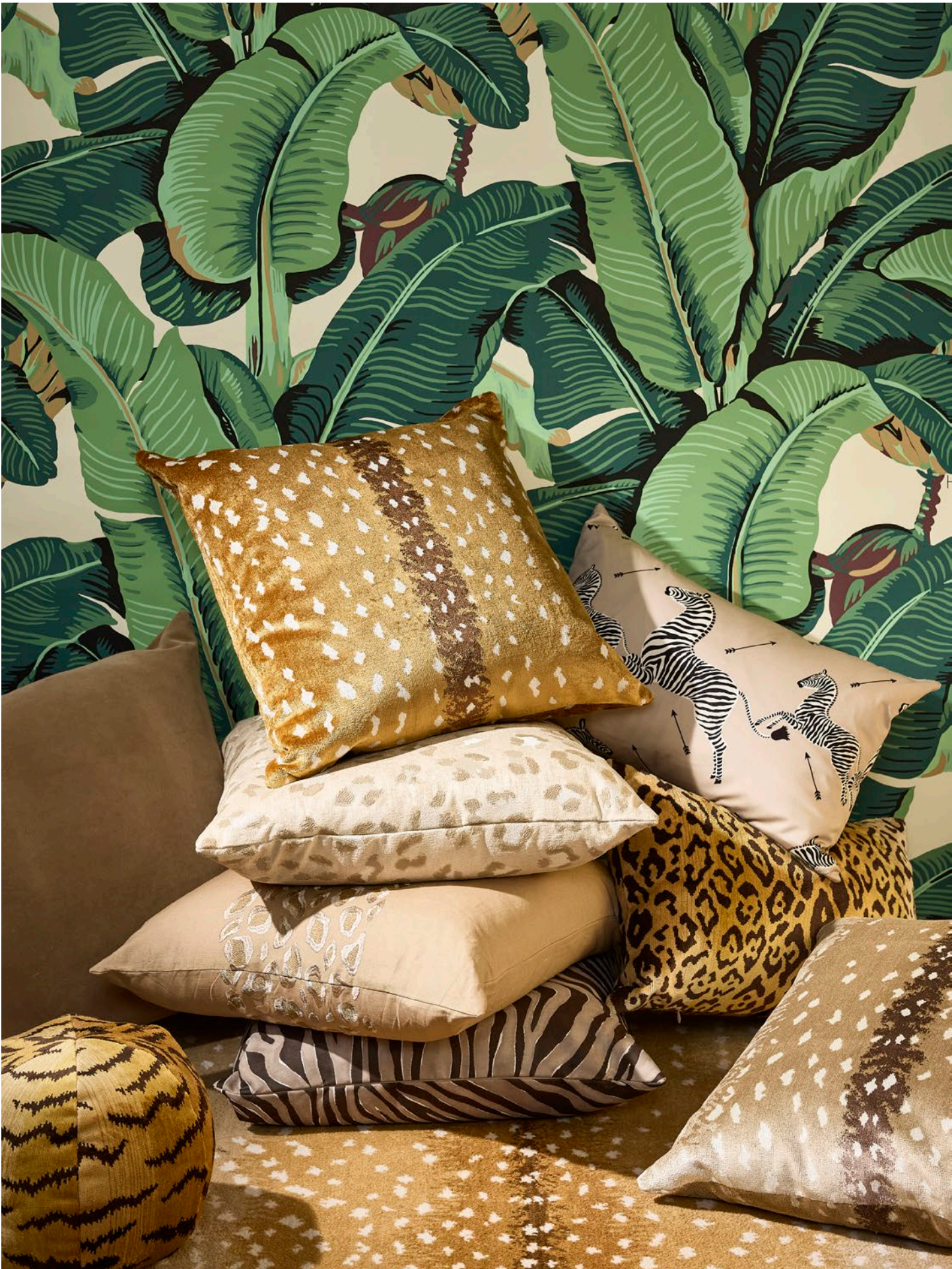
HINSON PALM WALLCOVERING