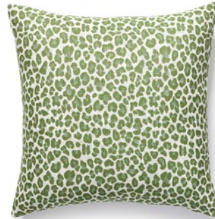
BACKYARD BENGAL OUTDOOR