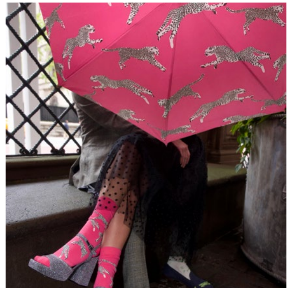
LEAPING CHEETAH UMBRELLA & SOCKS