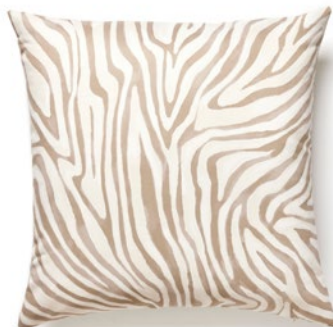
KENYA FAUX SUEDE