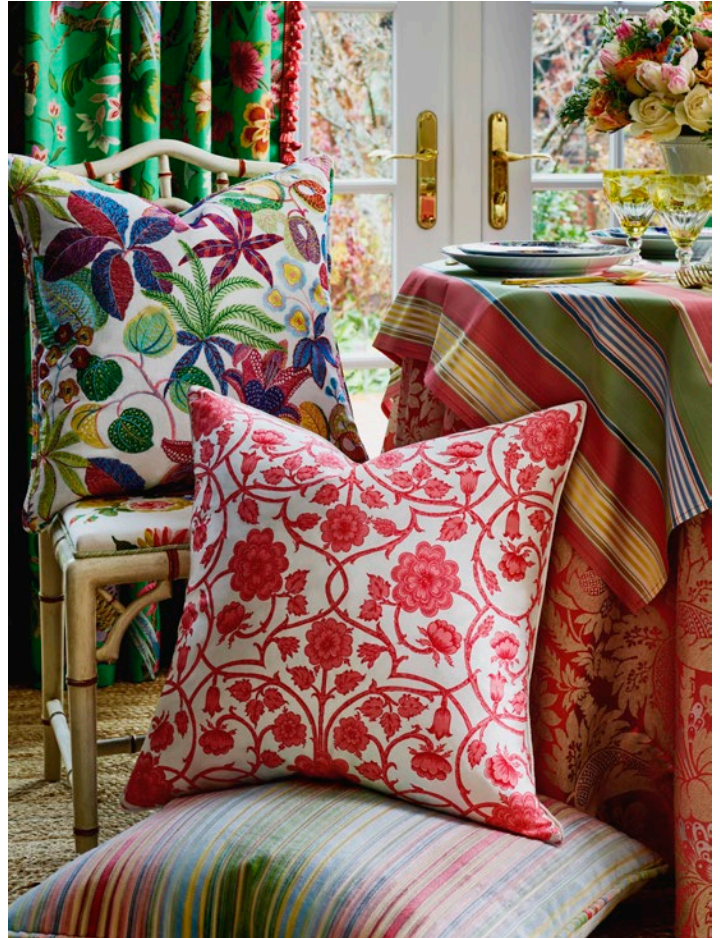
GREENHOUSE, ORNAMENTAL GATE & TIMBERLAKE