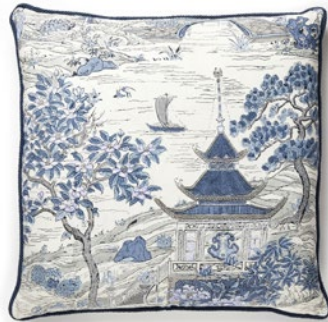
SATOMI HAND BLOCK