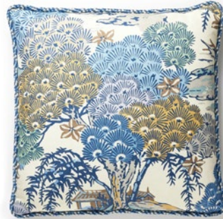
SEA OF TREES