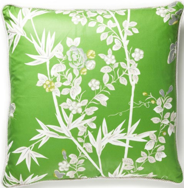
JARDIN DE CHINE