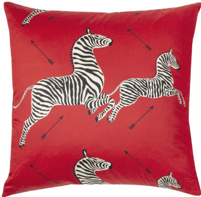
DAZZLE OF ZEBRAS