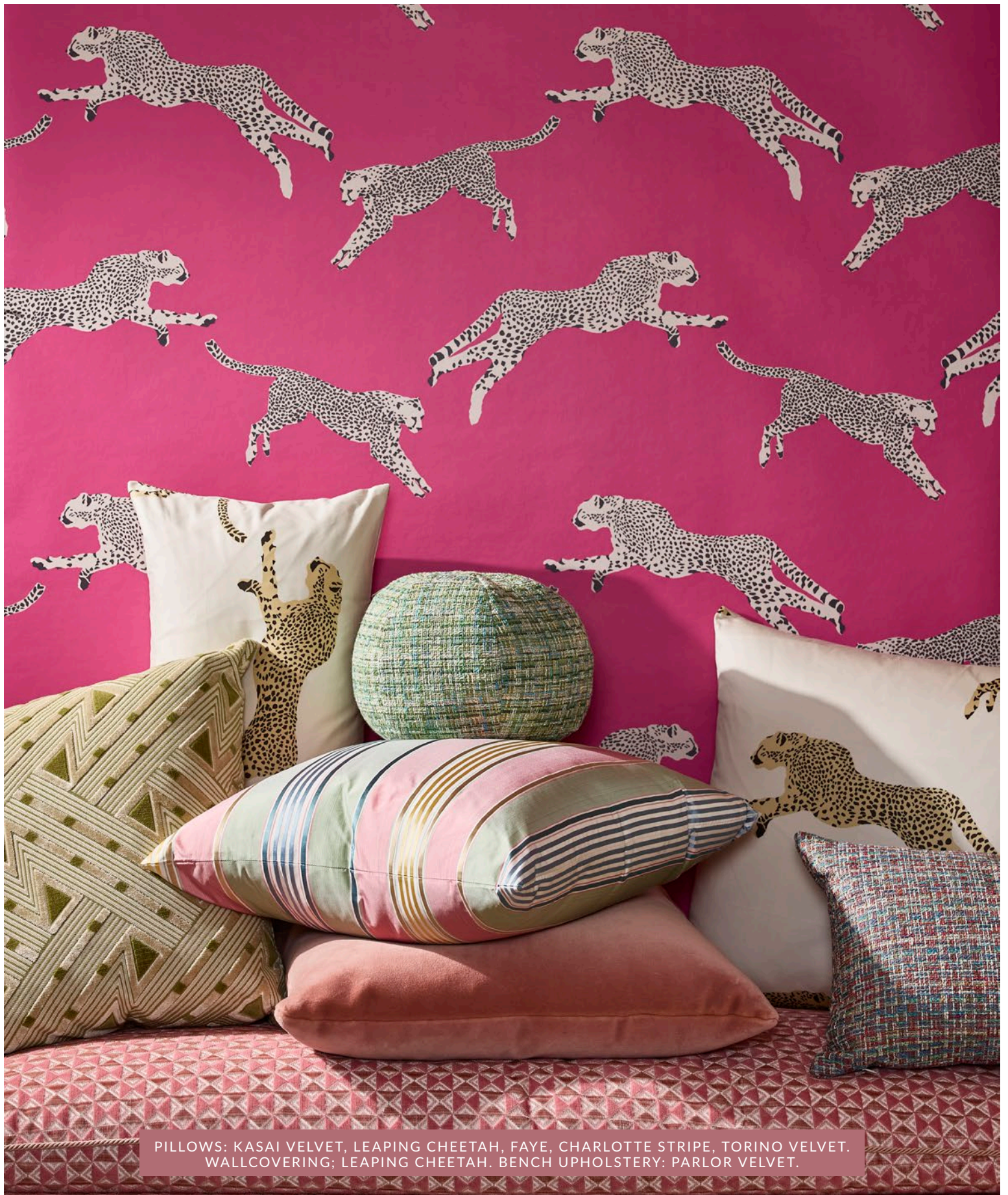
PILLOWS: KASAI VELVET, LEAPING CHEETAH, FAYE, CHARLOTTE STRIPE, TORINO VELVET. WALLCOVERING; LEAPING CHEETAH. BENCH UPHOLSTERY: PARLOR VELVET.