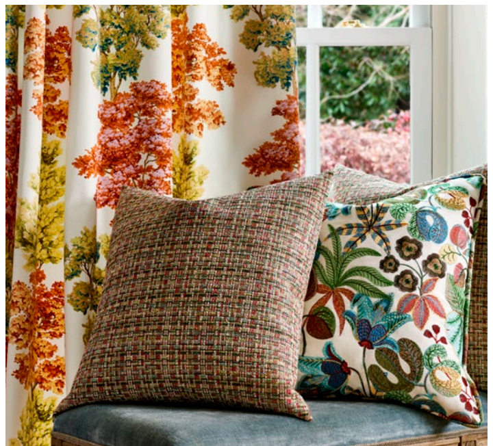
FAYE, GREENHOUSE & CENTRAL PARK DRAPERY