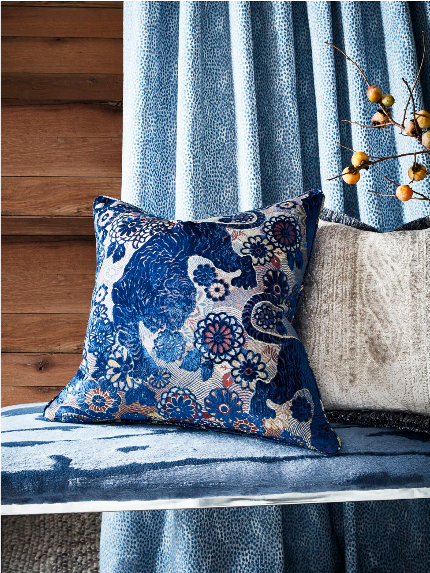
SIBERIAN TIGER PILLOW, SWEATER PILLOW, FLURRY DRAPERY & POLAR BEAR UPHOLSTERY