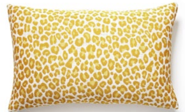
BACKYARD BENGAL OUTDOOR