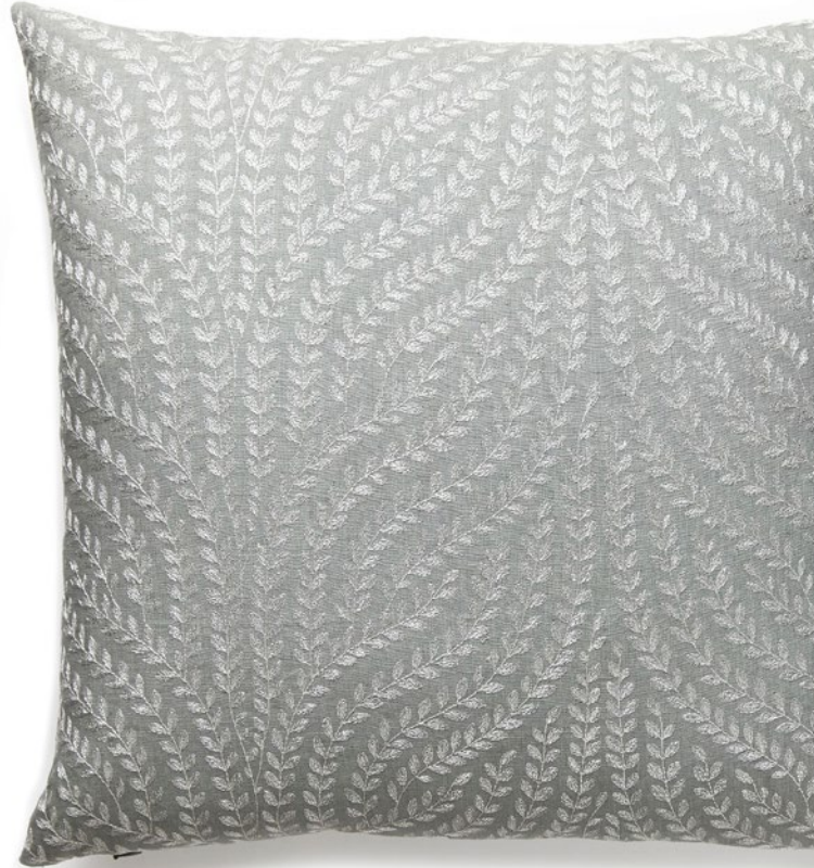
WILLOW VINE EMBROIDERY