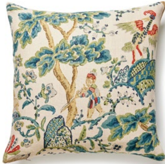
KELMESCOTT HAND BLOCK