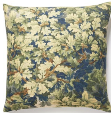
BOIS DE CHÈNE