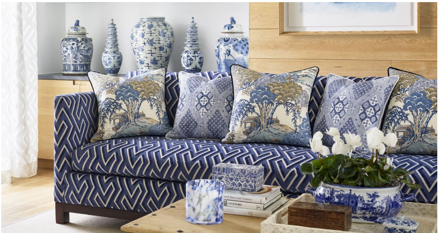
REINA SHEER, SEA OF TREES PILLOWS, FARRAH PRINT PILLOWS & MAZE VELVET UPHOLSTERY