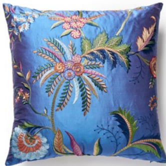
SERAPHINE EMBROIDERED SILK