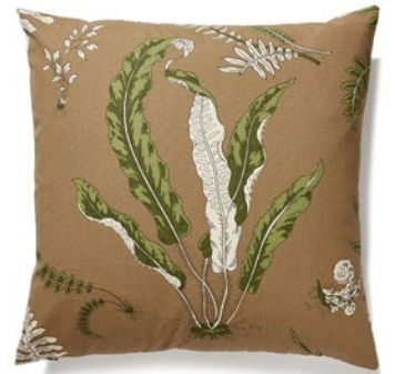
ELSIE DE WOLFE