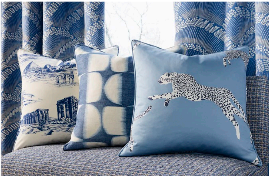
LOVEGRASS EMBROIDERY, CAIRO TOILE, RIFT LINEN PRINT, LEAPING CHEETAH & HIGHLAND CHENILLE