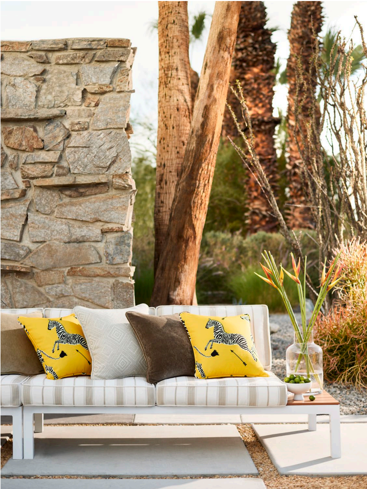
BAY VELVET, ZEBRAS, ANTIGUA WEAVE & SCONSET STRIPE