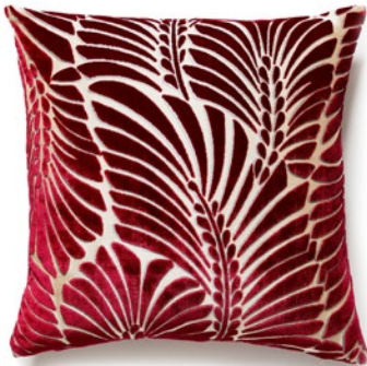
PLUMES SILK VELVET