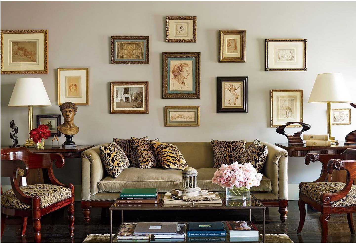
DESIGN: @NINAGGG