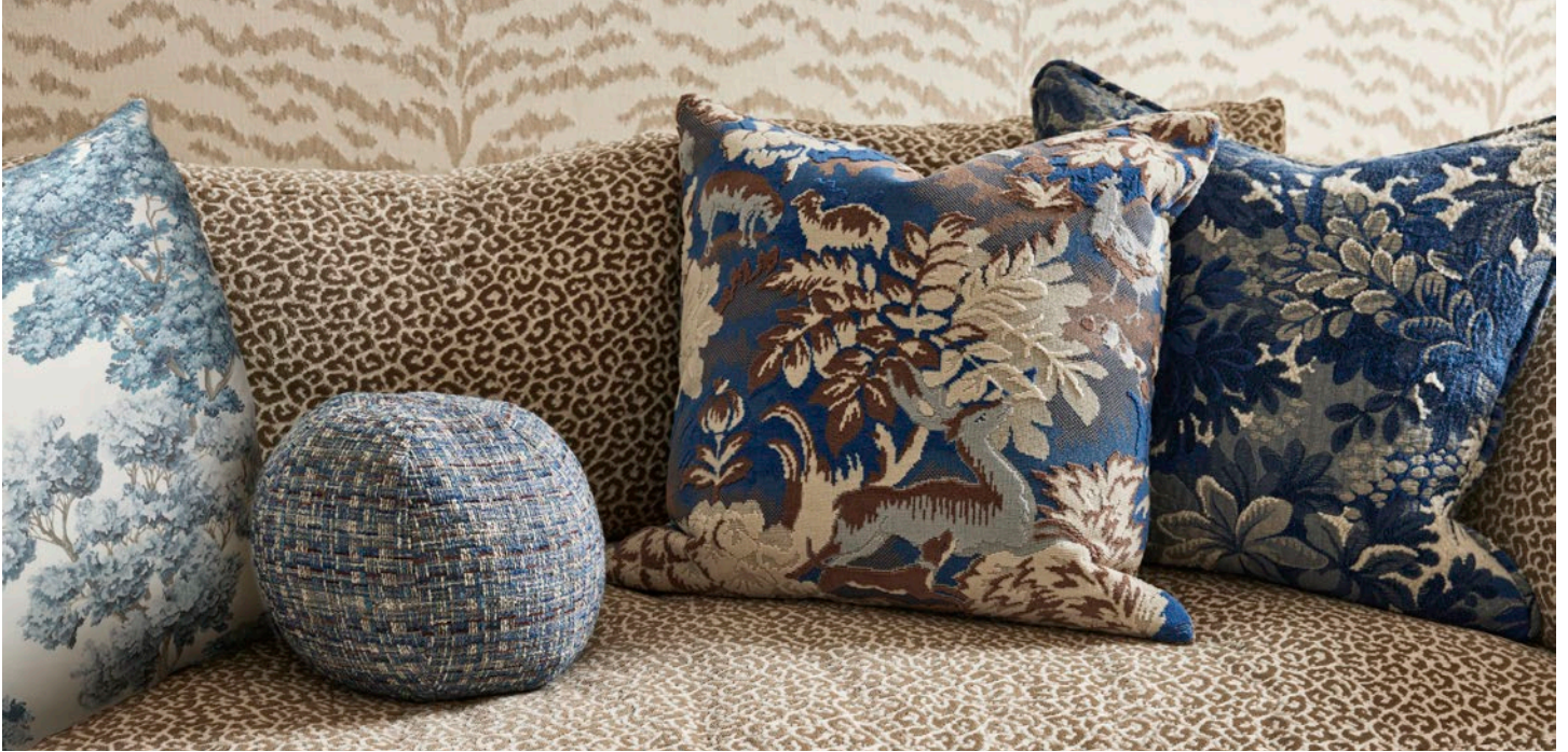
CENTRAL PARK, FAYE, TAILS TALE, RIDGE EDGE PILLOWS, TIGRESS WALLCOVERING & PANTHERA VELVET UPHOLSTERY

Bring the enchanting beauty of nature indoors with our Botanical Pillows, each design meticulously crafted to infuse your space with the serenity of lush gardens. Elevate your décor with the delicate elegance of botanical prints, creating a tranquil ambiance that resonates with a breath of fresh air.