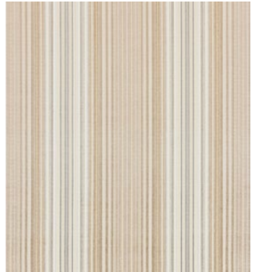
TRAVERTINE JM 0004 0592