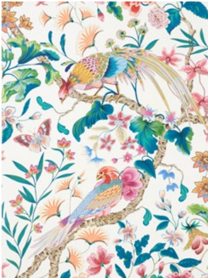
PERENNIAL GARDEN WJR 0005 6822D

Our popular 19C, beautifully drawn English archival print of stately pheasants perched on a floral branch, now has an expanded color palette. We are happy to announce the addition of Botany Bay wallcoverings. The same six colors are produced in England on a non-woven ground for an extension of this cult-classic motif.