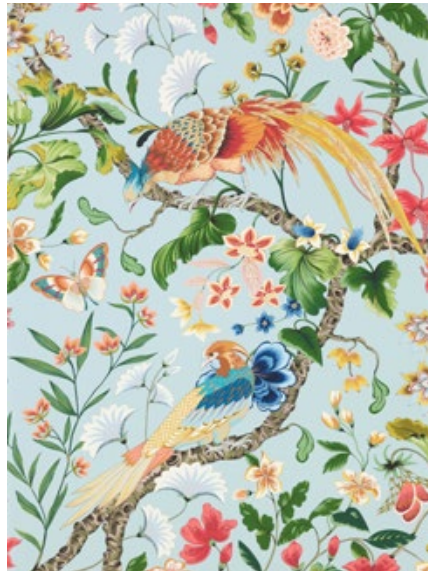
SKY MULTI WJR 0001 6822D