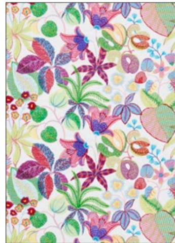
GREENHOUSE 3 COLORWAYS (S7 5400)