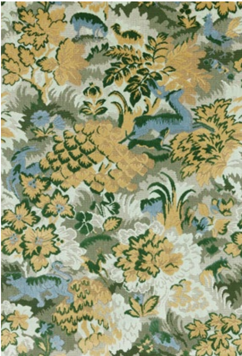
FOREST M1 0002 0264

The springboard pattern for Woodland Estate, Tails Tale is a cut velvet depicting an enchanted forest teeming with peaceful animals. The cut and looped velvet weaves give distinction to the motifs and allow the eye to wander in discovery. The pile is made of cotton for better durability and with its Martindale rating of 50,000 cycles, Tails Tale is well-intended for upholstery use.