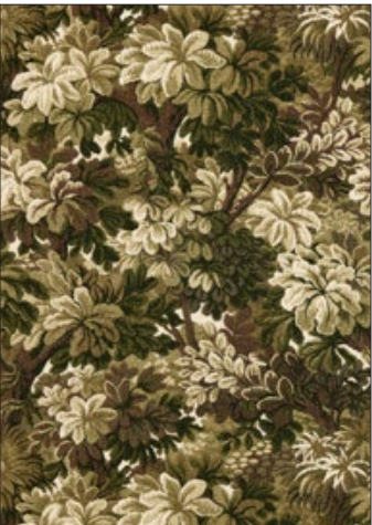
RIDGE EDGE (COTTON) 1 COLORWAY (BZ 060C)