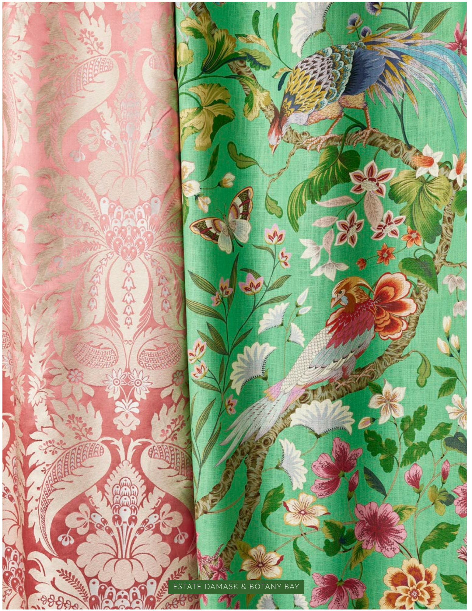
ESTATE DAMASK & BOTANY BAY