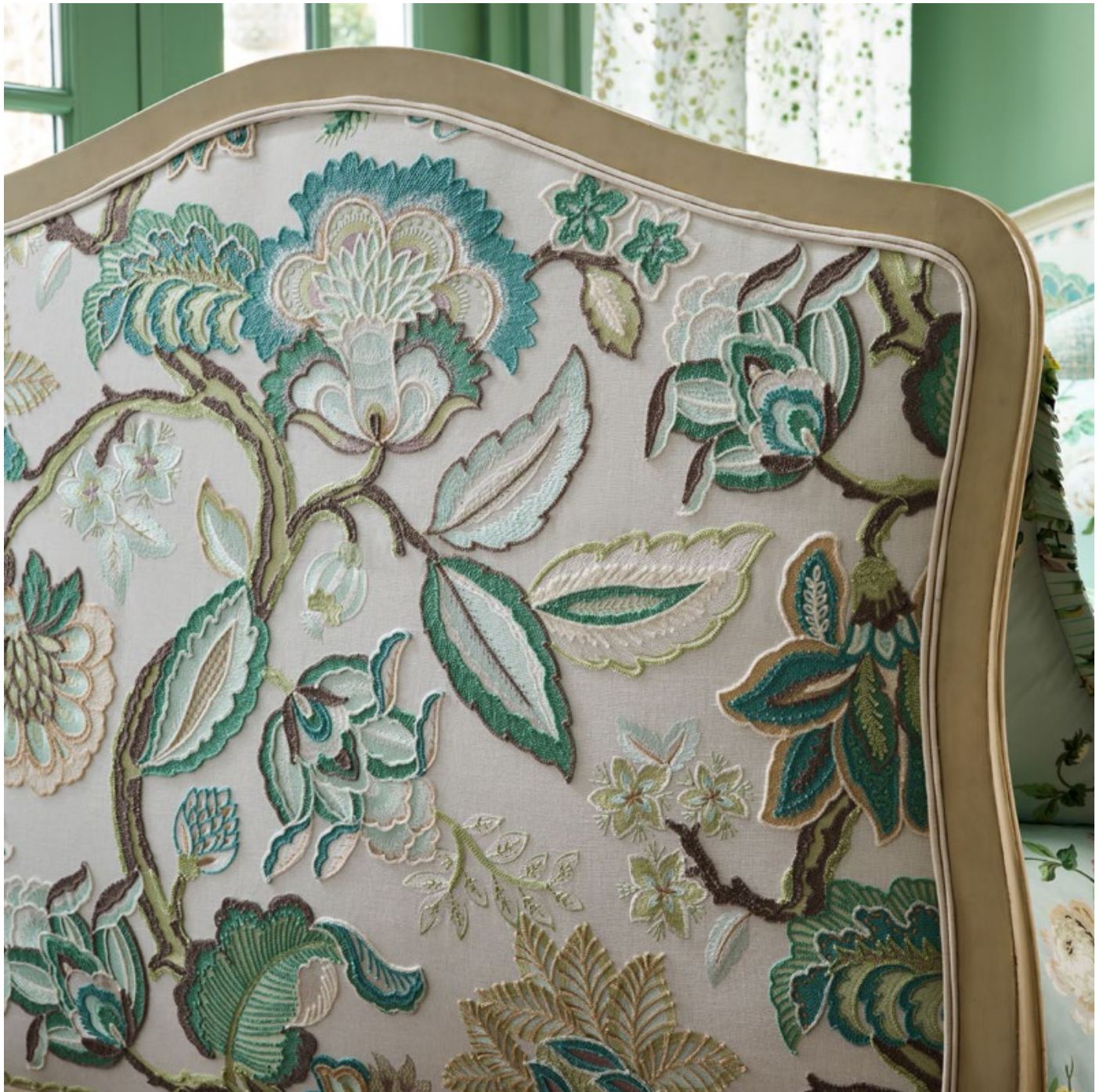
HILLSIDE CREWEL & LILETTE SHEER