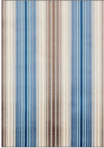
TIMBERLAKE VELVET 6 COLORWAYS (JM 0592)