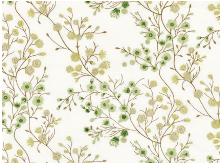
FERN P4 0001 9863