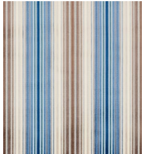
BLUE WOOD JM 0001 0592