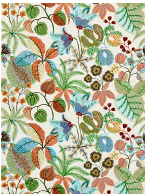
POTTING SOIL S7 0002 5400