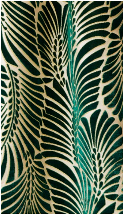
VIRIDIAN CN 0001 1523

This dynamic, Art Deco-inspired, silhouetted cut velvet is a showstopper. Its irresistible Italian flair sets the stage for drama. Imagine these bold, alternating plumes on floor to ceiling drapes, upholstered screens or occasional seat backs. The rich, jewel tone colors become deeper or more brilliant as light plays over the surface of the velvet.