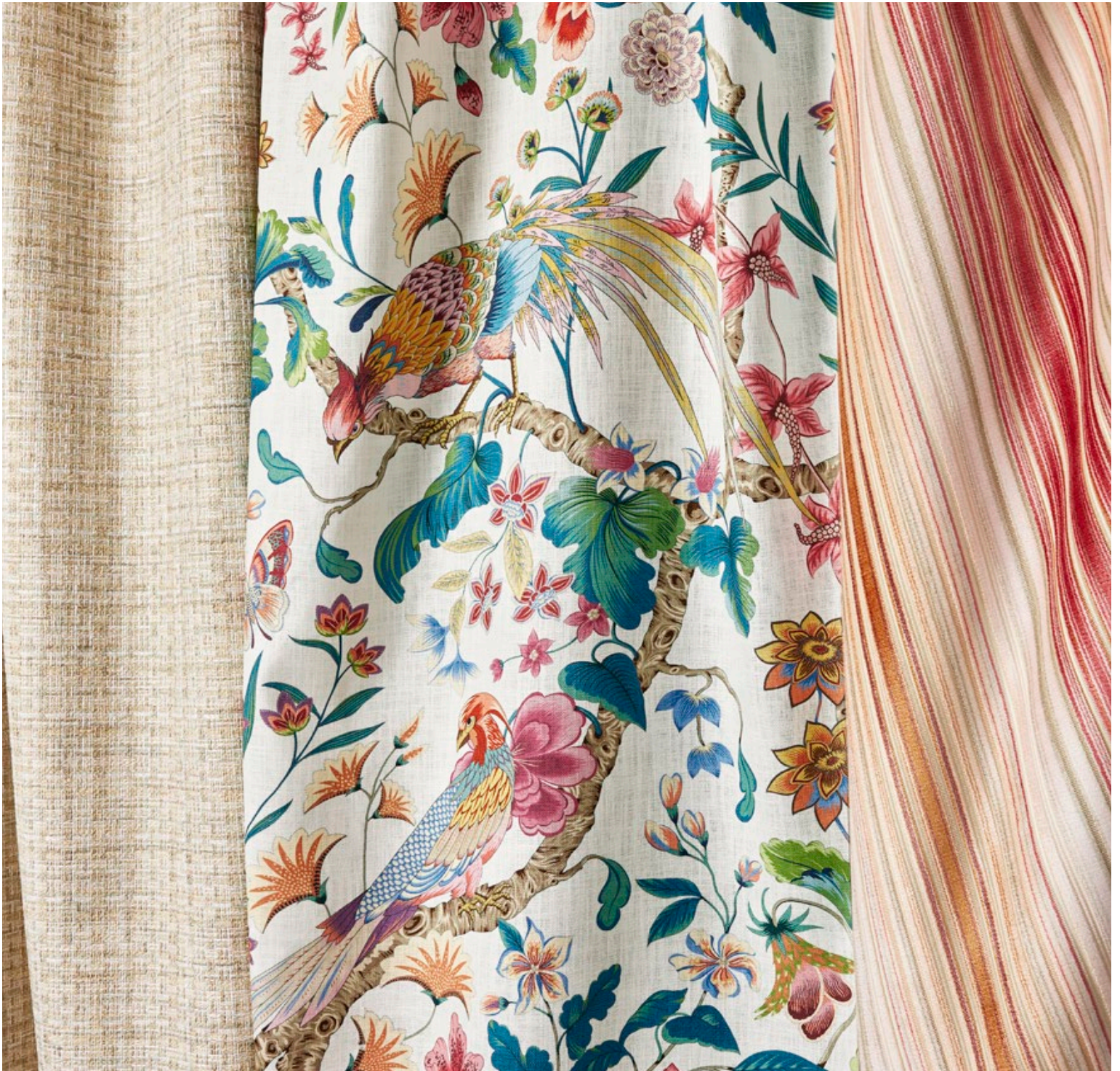
FAYE, BOTANY BAY & TIMBERLAKE VELVET