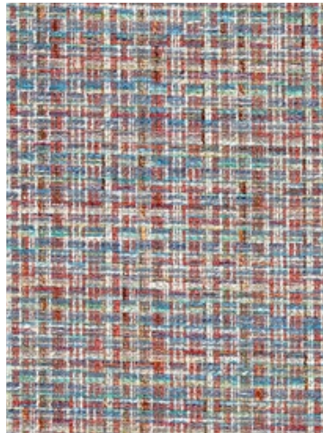
CONFETTI BI 0007 FAYE