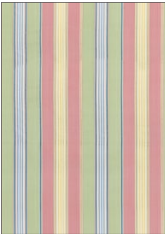
CHARLOTTE STRIPE 6 COLORWAYS (ND 6130)