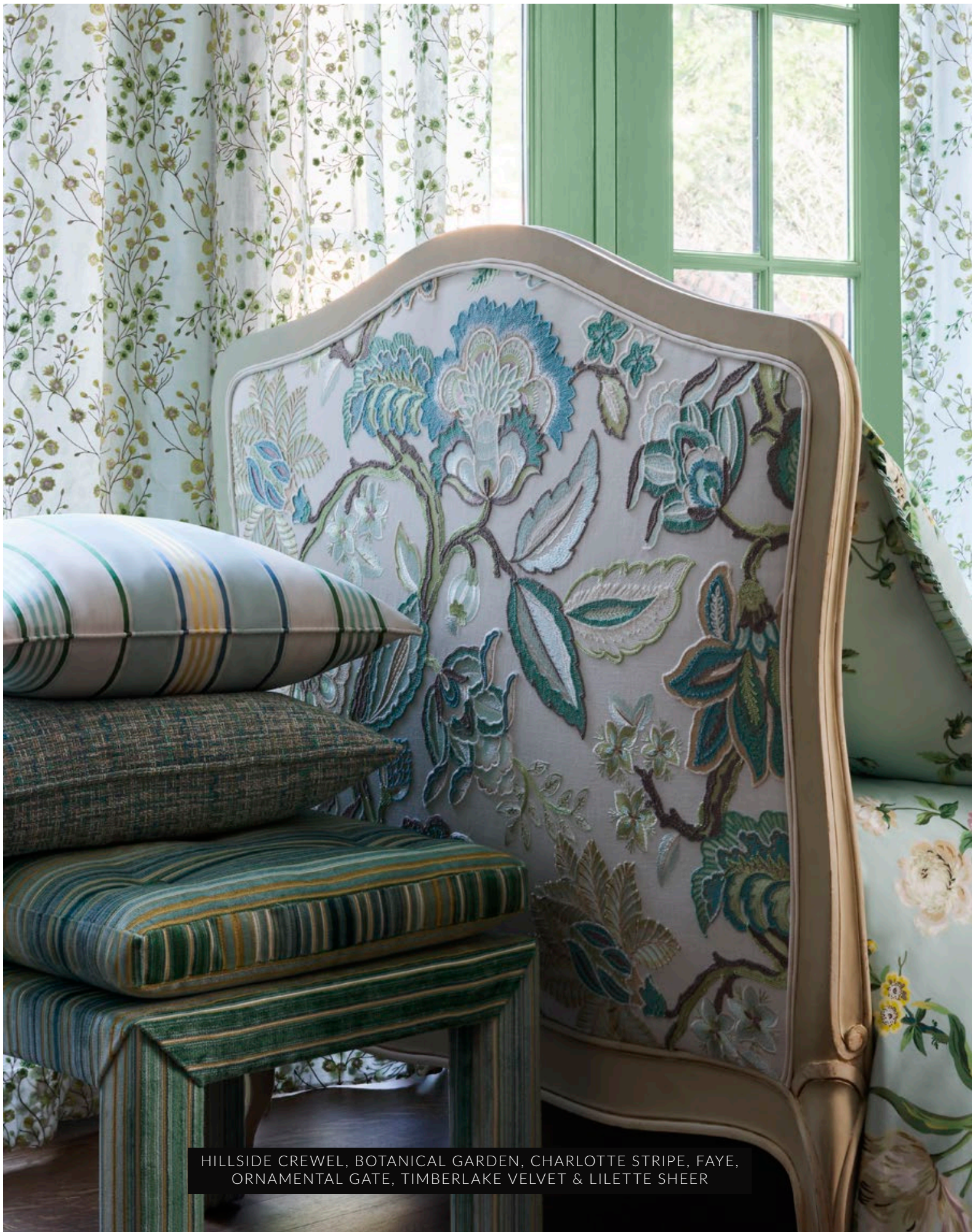
HILLSIDE CREWEL, BOTANICAL GARDEN, CHARLOTTE STRIPE, FAYE, ORNAMENTAL GATE, TIMBERLAKE VELVET & LILETTE SHEER