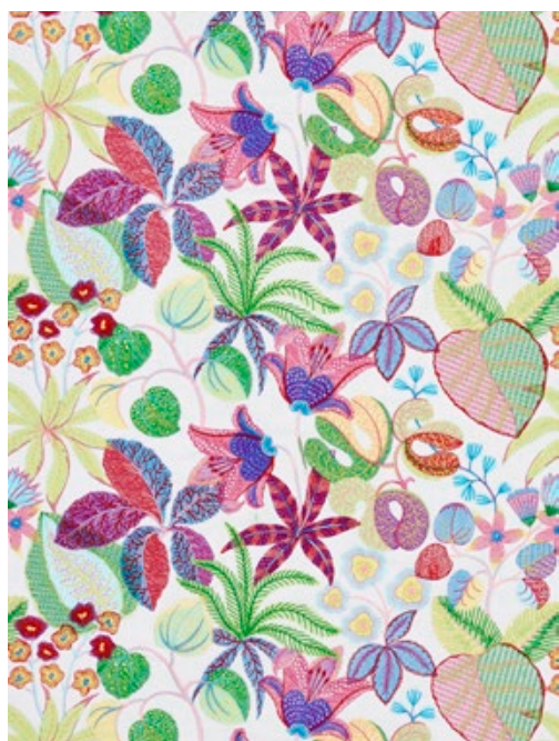
BOUQUET S7 0001 5400

This whimsical interpretation of fantastical flora is not far from the reality of the otherworldly plants that exist in nature. Embroidered on a linen cotton in popping primary and deep mystical colors, Greenhouse has an array of shades to outfit any room with decorative panels.