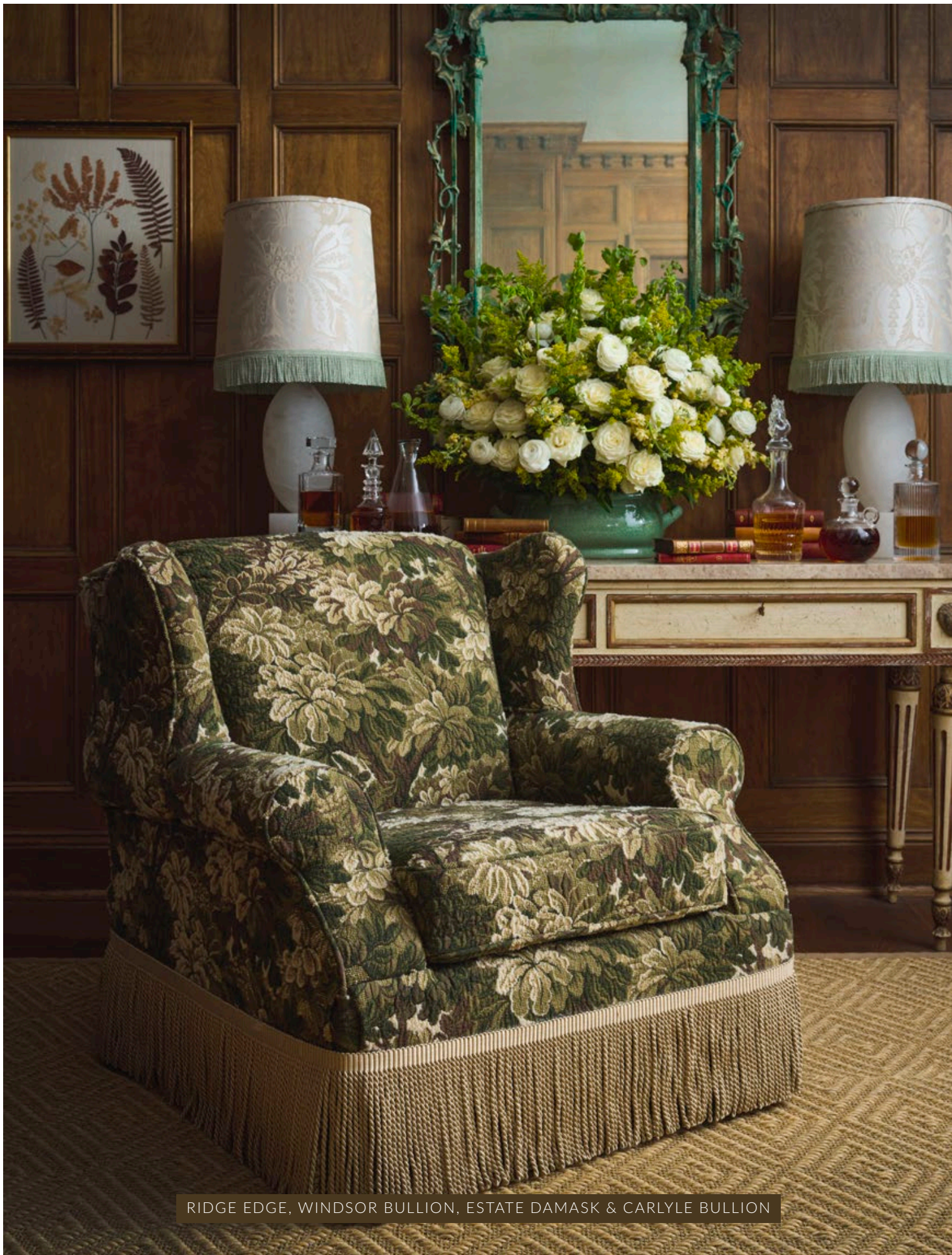
RIDGE EDGE, WINDSOR BULLION, ESTATE DAMASK & CARLYLE BULLION