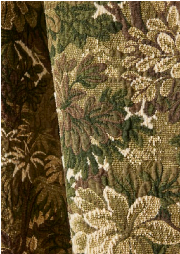
RIDGE EDGE (COTTON) MOSS BZ 0036 060C

A true classic verdure tapestry of deep lush foliage is given new dimension by its washed treatment. This finish both softens and lifts the wool for a unique tactile effect. To create a tapestry, multicolored yarns are set in the warp and then the colors are blended at a Belgian mill.