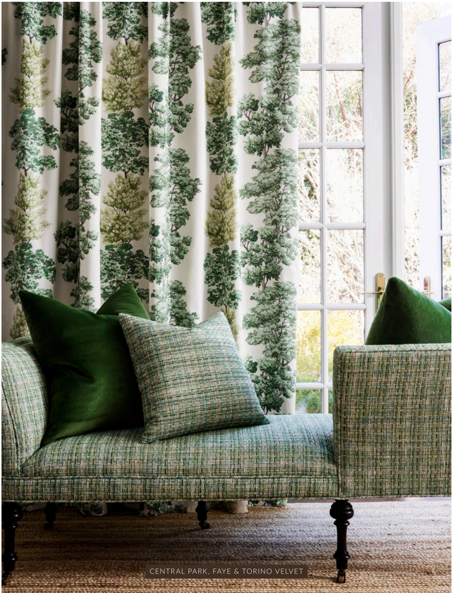
CENTRAL PARK, FAYE & TORINO VELVET