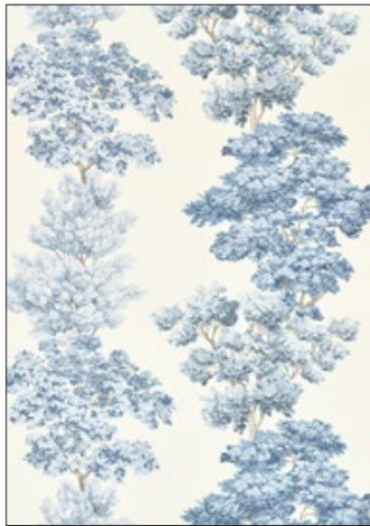
CENTRAL PARK 3 COLORWAYS (CN 0071)