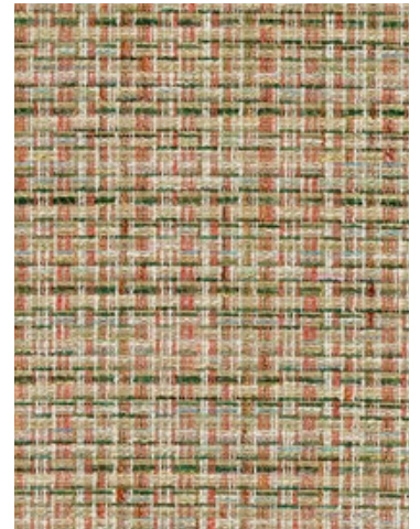
OLIVE CORAL BI 0005 FAYE