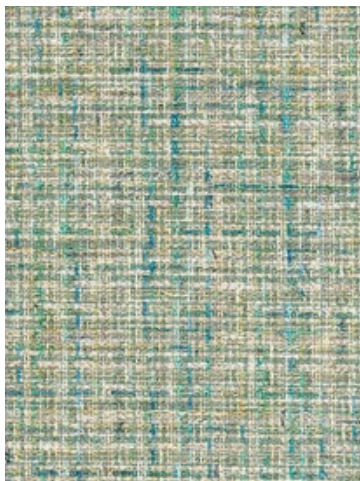
AQUAMARINE BI 0003 FAYE