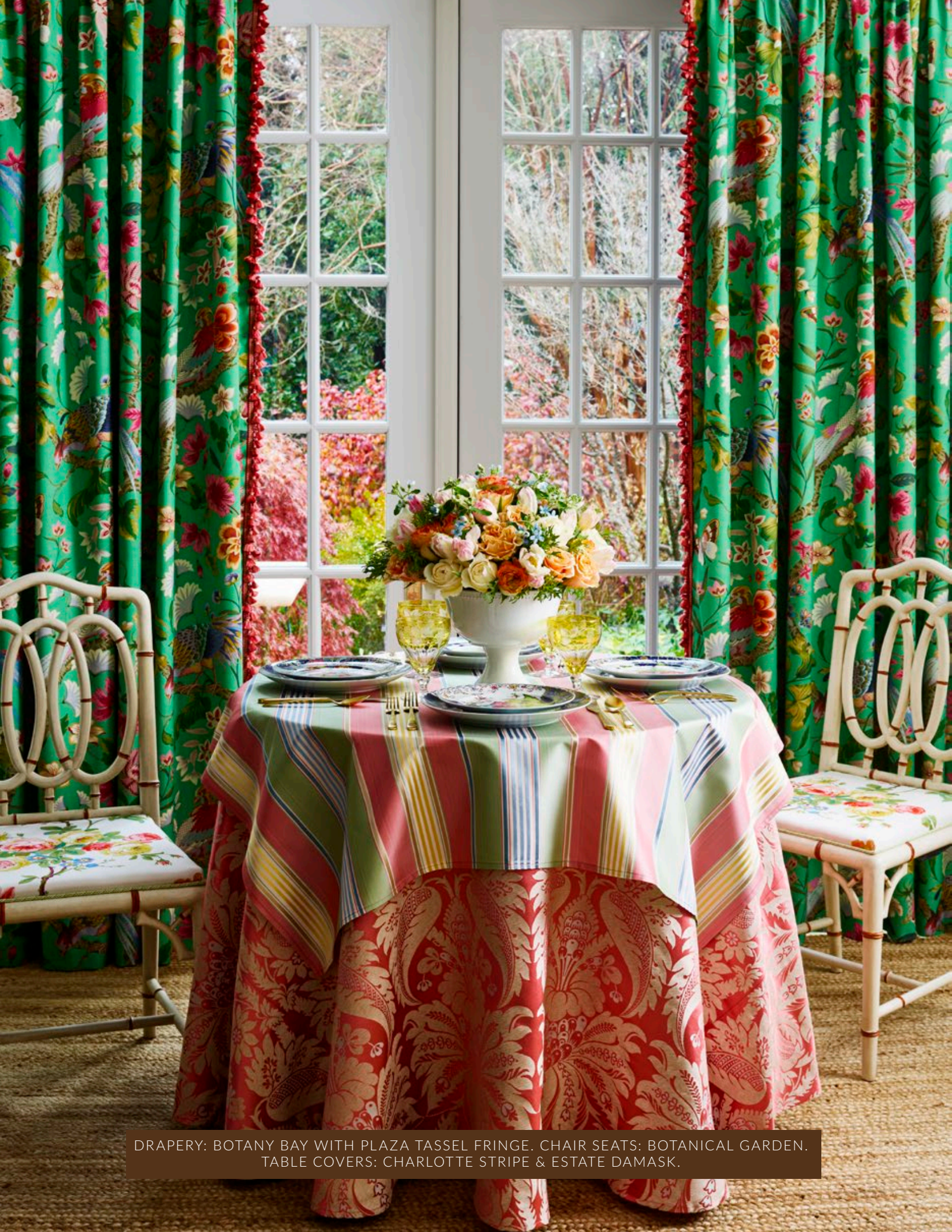
DRAPERY: BOTANY BAY WITH PLAZA TASSEL FRINGE. CHAIR SEATS: BOTANICAL GARDEN. TABLE COVERS: CHARLOTTE STRIPE & ESTATE DAMASK.