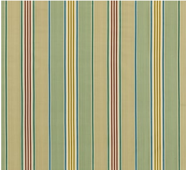
MOSS ND 0001 6130