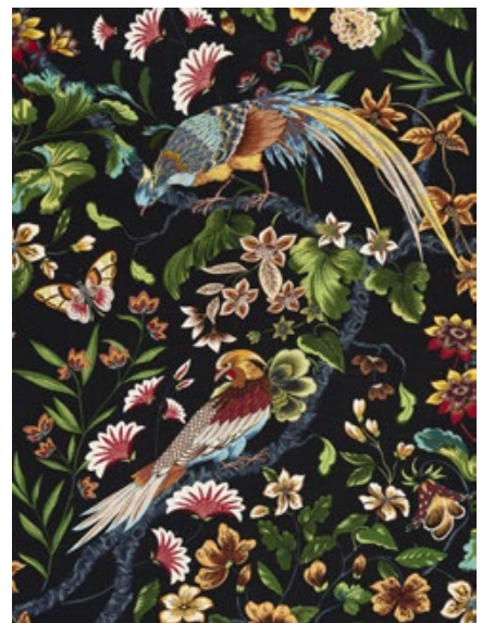
BLACK RUBY JP 0002 1340