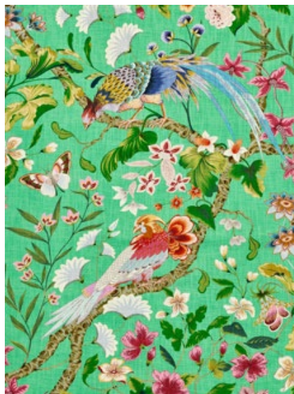
JADE JP 0006 1340