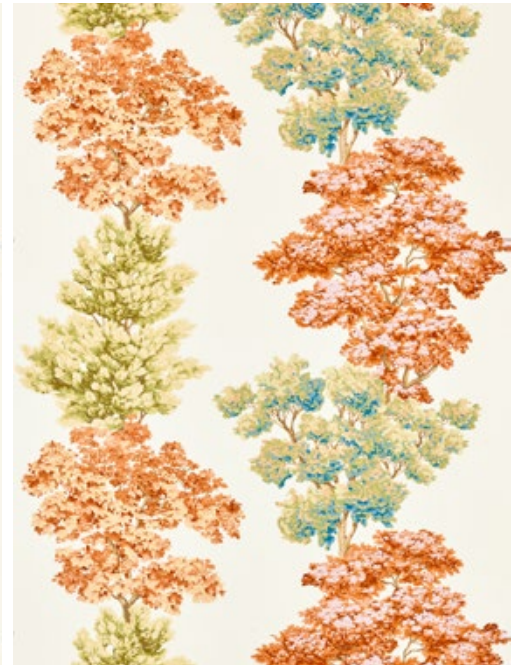
AUTUMN CN 0003 0071