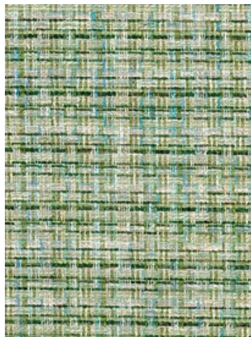
PRAIRIE BI 0004 FAYE