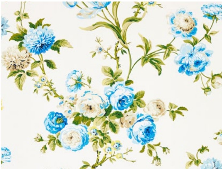
PORCELAIN BLUE B0 0003 3506