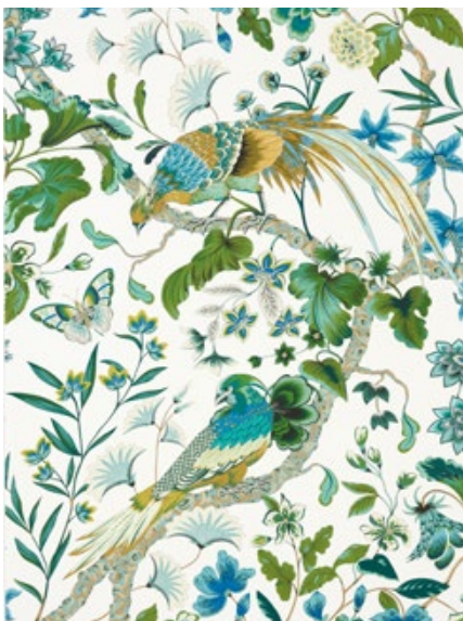
FOREST WJR 0004 6822D