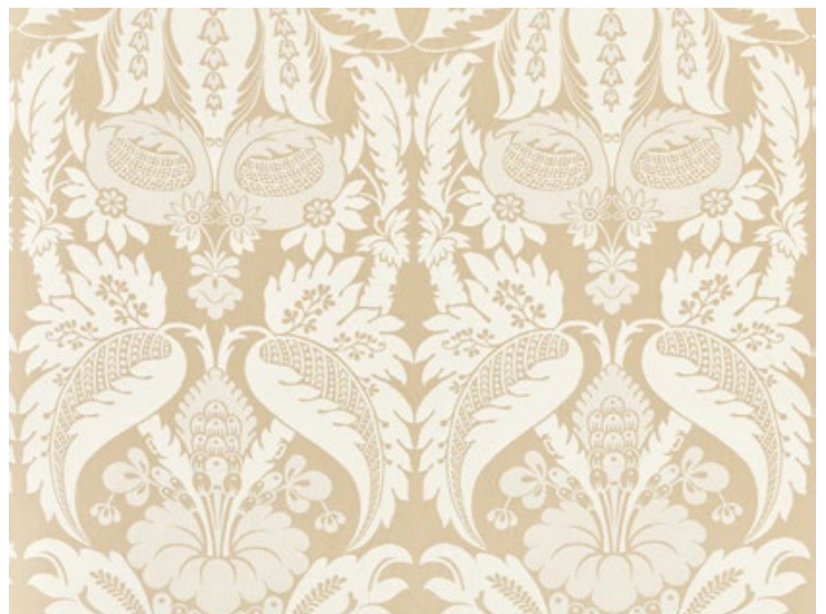
TRAVERTINE PQ 0004 1865