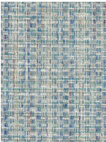
CORNFLOWER BI 0002 FAYE