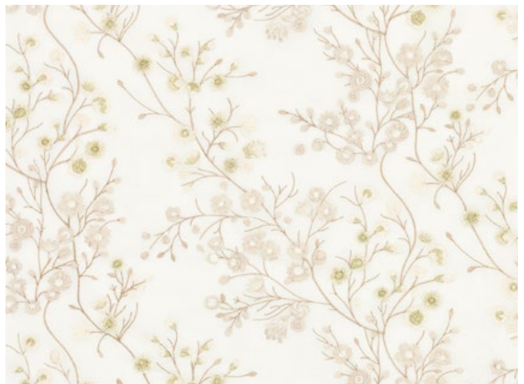
IVORY P4 0002 9863