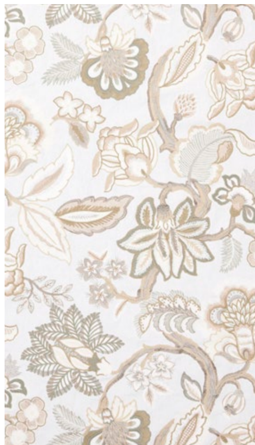
IVORY S7 0003 HILL