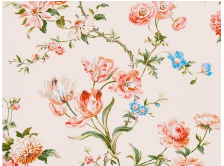
ROSE QUARTZ B0 0004 3506