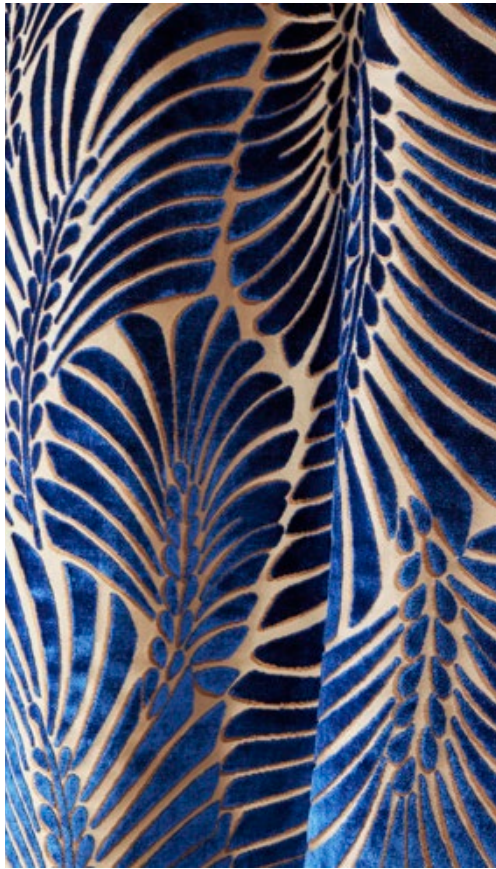
SAPPHIRE CN 0002 1523