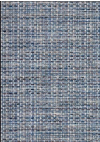
FAYE 8 COLORWAYS (BI FAYE)