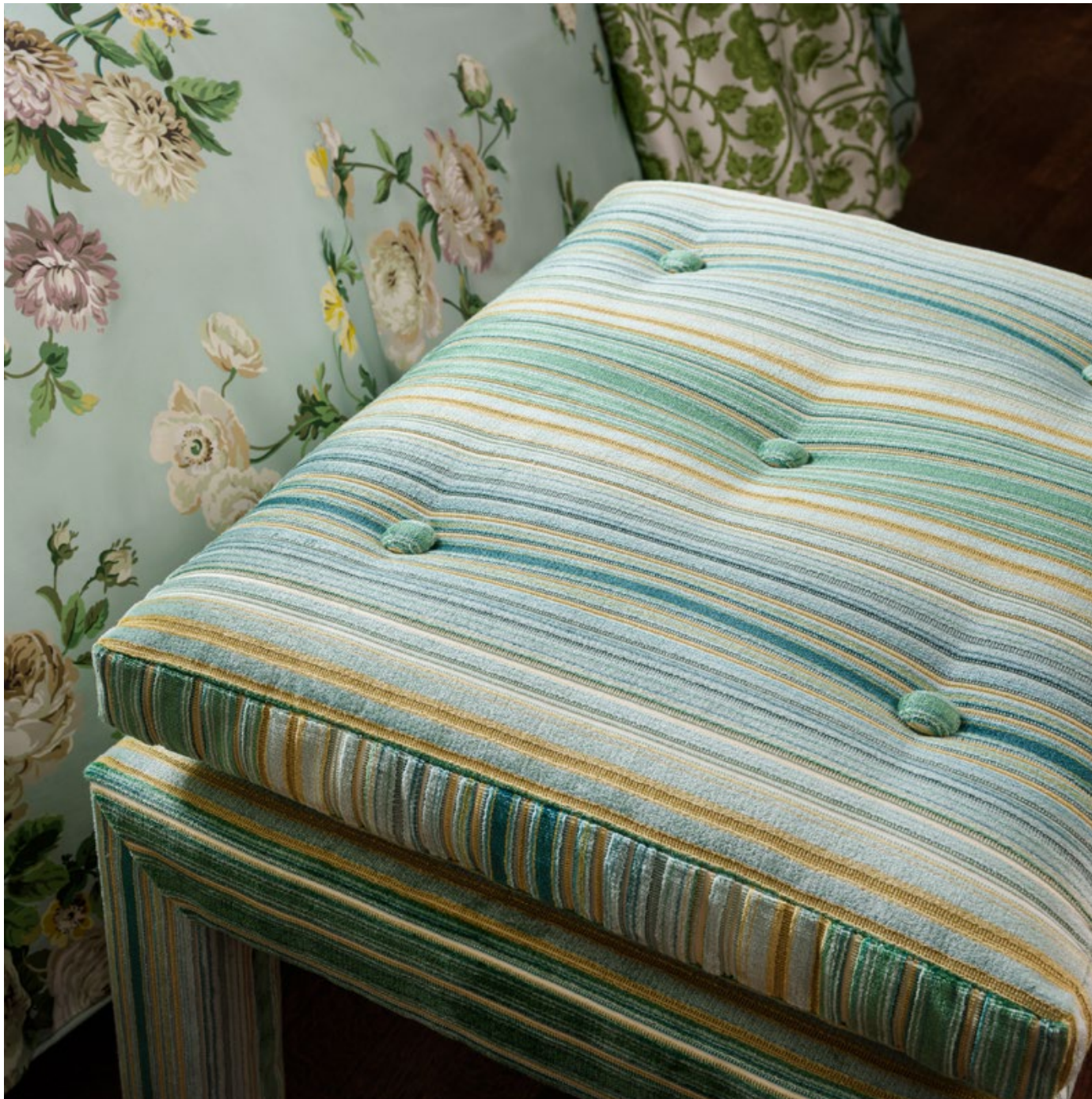
TIMBERLAKE VELVET, BOTANICAL GARDEN & ORNAMENTAL GATE