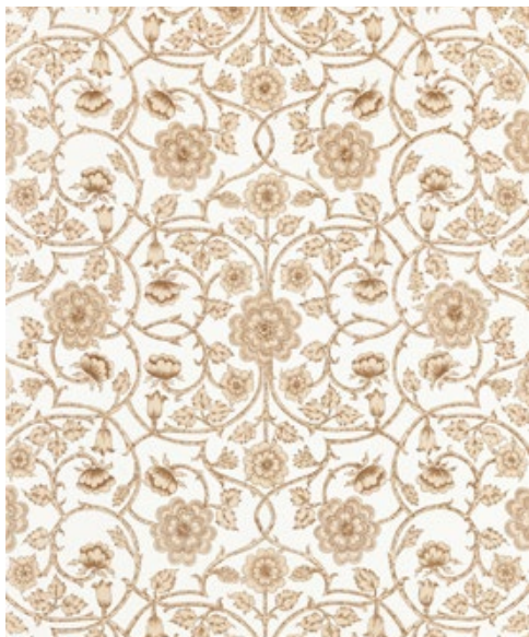
TRAVERTINE YD 0003 5736

Referencing the architectural decorative motifs on ironwork garden gates, this graphic print is softened by the rosettes and lyrical scrolls that are screen printed on a 100% silk ground. The clear, monochromatic colorings allow Ornamental Gate to be used as the focal point of elegant drapery, or to blend easily in a room with our coordinating fabrics such as Estate Damask, Charlotte Stripe, Lilette Sheer and Faye.