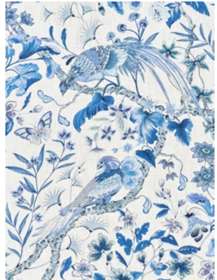
PORCELAIN JP 0003 1340