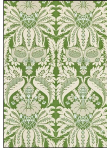
ESTATE DAMASK 4 COLORWAYS (PQ 1865)