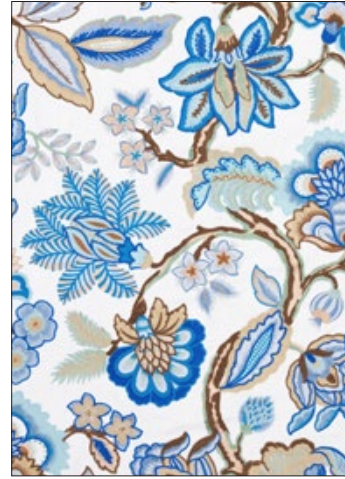
HILLSIDE CREWEL 3 COLORWAYS (S7 HILL)