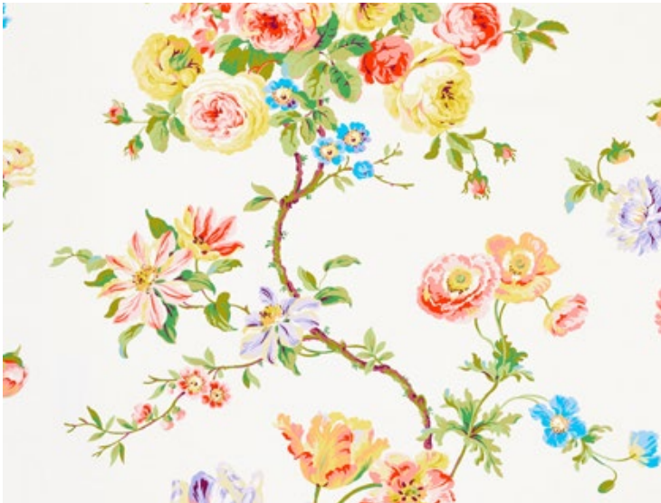
SUMMER MULTI B0 0001 3506

Freshly cut flowers from a spring garden of climbing roses, peonies, tulips and dahlias make the perfect burst of color for draperies or decorative bedding. Printed in Italy on a fine cotton sateen, this lively floral will brighten any living room, dining room or bedroom.