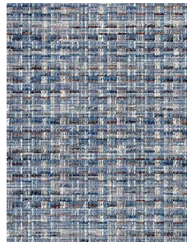
BLUE WOOD BI 0001 FAYE