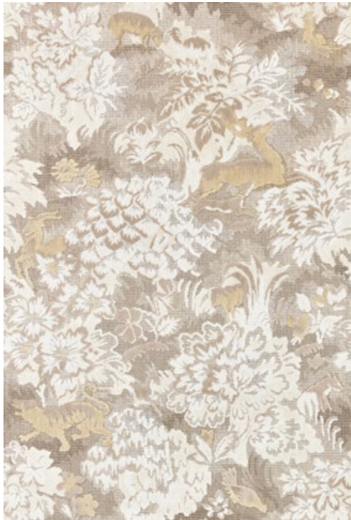
TRAVERTINE M1 0003 0264