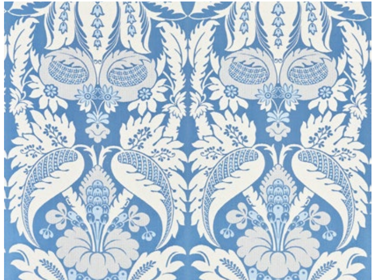
BLUE JAY PQ 0002 1865