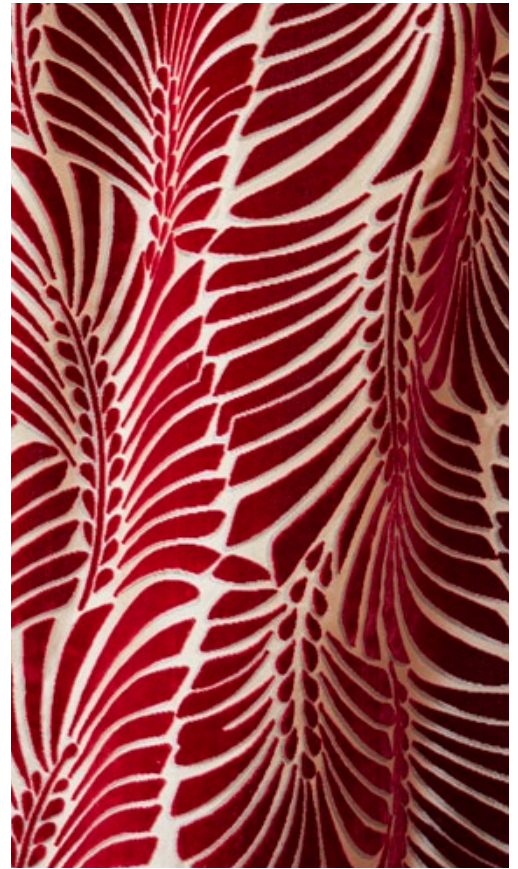
CERISE CN 0003 1523