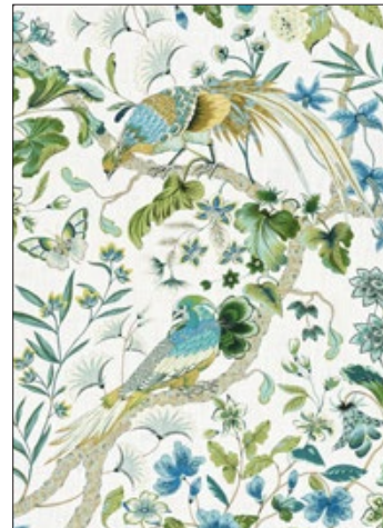
BOTANY BAY 6 COLORWAYS (JP 1340)