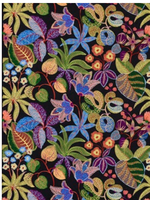
NIGHT SHADE S7 0003 5400