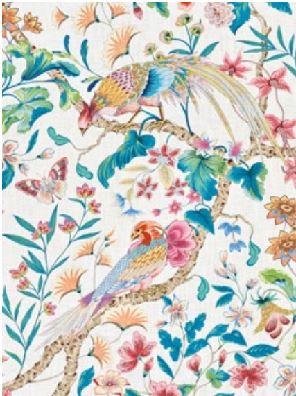
PERENNIAL GARDEN JP 0005 1340

Our popular 19C, beautifully drawn English archival print of stately pheasants perched on a floral branch, now has an expanded color line. Printed in England on a linen blended ground. Botany Bay has been used to make dramatic drapes and to cover occasional seating.