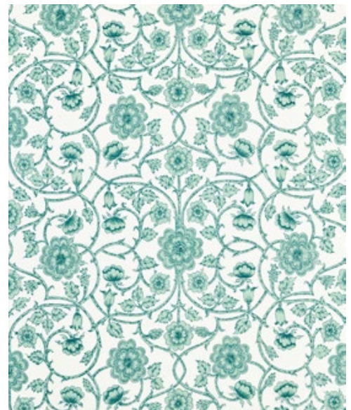
CELADON YD 0005 5736