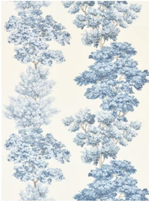
LIGHT BLUE CN 0002 0071