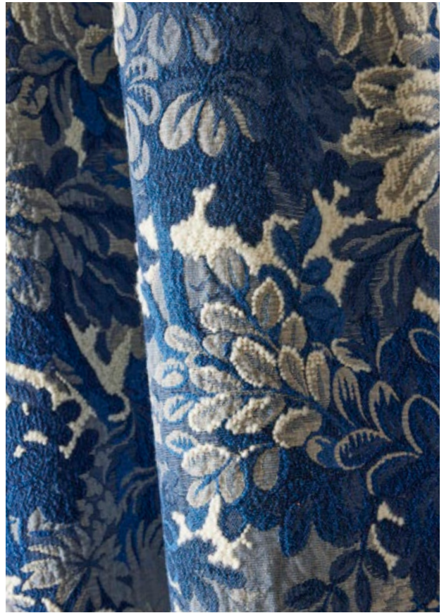
RIDGE EDGE (WOOL) BLUE SHADOW BZ 0062 060W