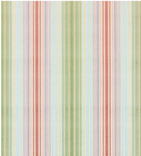
PRISM JM 0005 0592

A striking formal stripe is softened by multicolor ombré gradations in our Timberlake Velvet. This new addition to our stripes offerings has upholstery application in mind. The viscose pile adds luster while not detracting from the durability of 50,000 Martindale cycles. Timberlake Velvet is colored to coordinate with each of our prints and wovens to create a layered room environment.