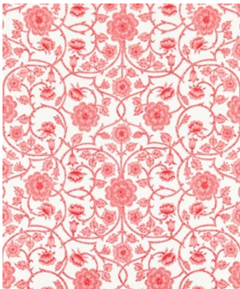
PETAL YD 0004 5736