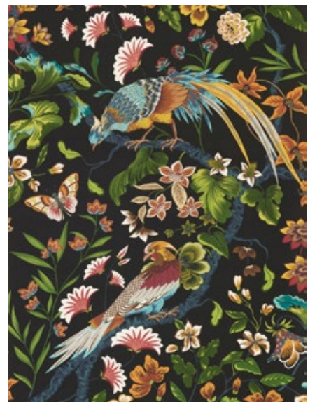
BLACK RUBY WJR 0002 6822D