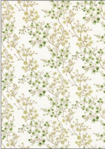
LILETTE SHEER 4 COLORWAYS (P4 9863)