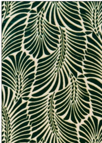
PLUMES SILK VELVET 3 COLORWAYS (CN 1523)