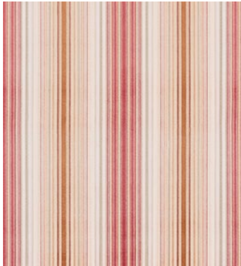
ROSE APRICOT JM 0006 0592