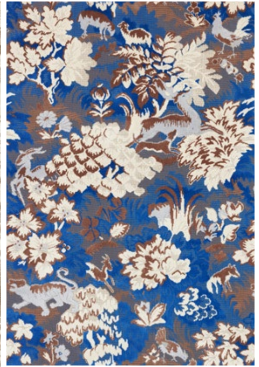
BLUE WOOD M1 0001 0264