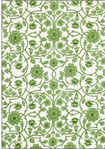
ORNAMENTAL GATE 5 COLORWAYS (YD 5736)