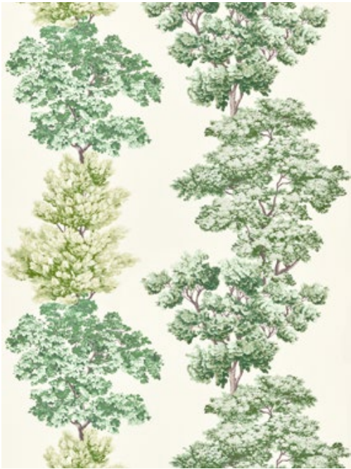
GREEN CN 0001 0071

A twist on the classic tree motif breathes fresh air into interiors. Printed on luxe cotton poplin in Italy, our new print, Central Park, captures the ever-changing beauty of foliage, from muted greens and cloudy blues to bright, multicolor tones. While not a direct coordinate, Central Park makes a fine companion to Raphael wallcovering.