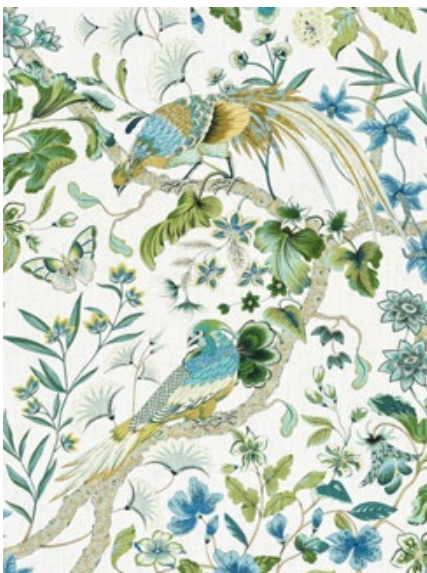
FOREST JP 0004 1340