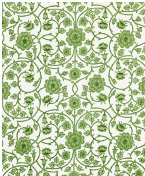
FERN YD 0001 5736