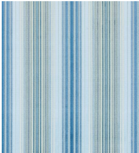
BLUE JAY JM 0002 0592