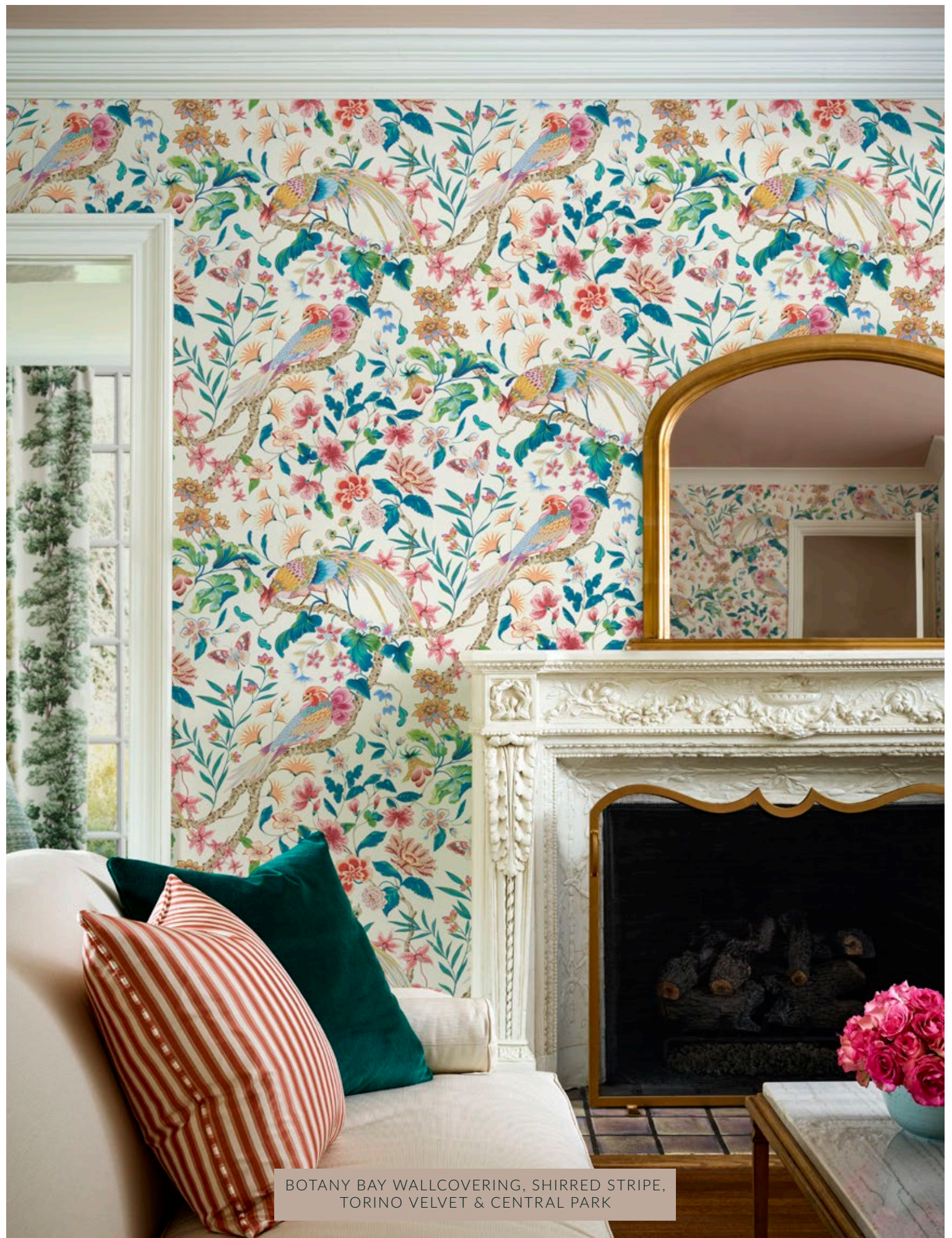
BOTANY BAY WALLCOVERING, SHIRRED STRIPE, TORINO VELVET & CENTRAL PARK