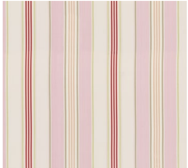
BLUSH ND 0006 6130