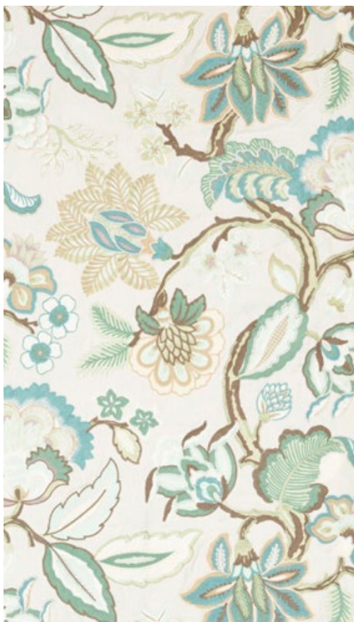
CELADON S7 0002 HILL