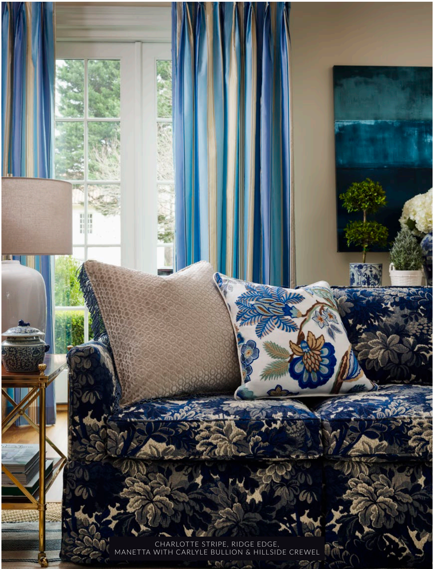
CHARLOTTE STRIPE, RIDGE EDGE, MANETTA WITH CARLYLE BULLION & HILLSIDE CREWEL