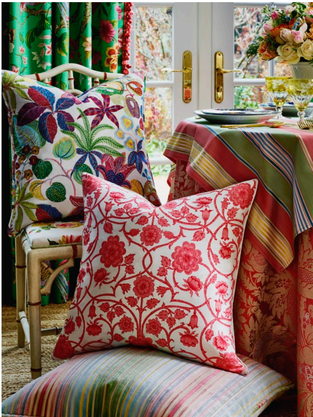
GREENHOUSE, ORNAMENTAL GATE & TIMBERLAKE VELVET