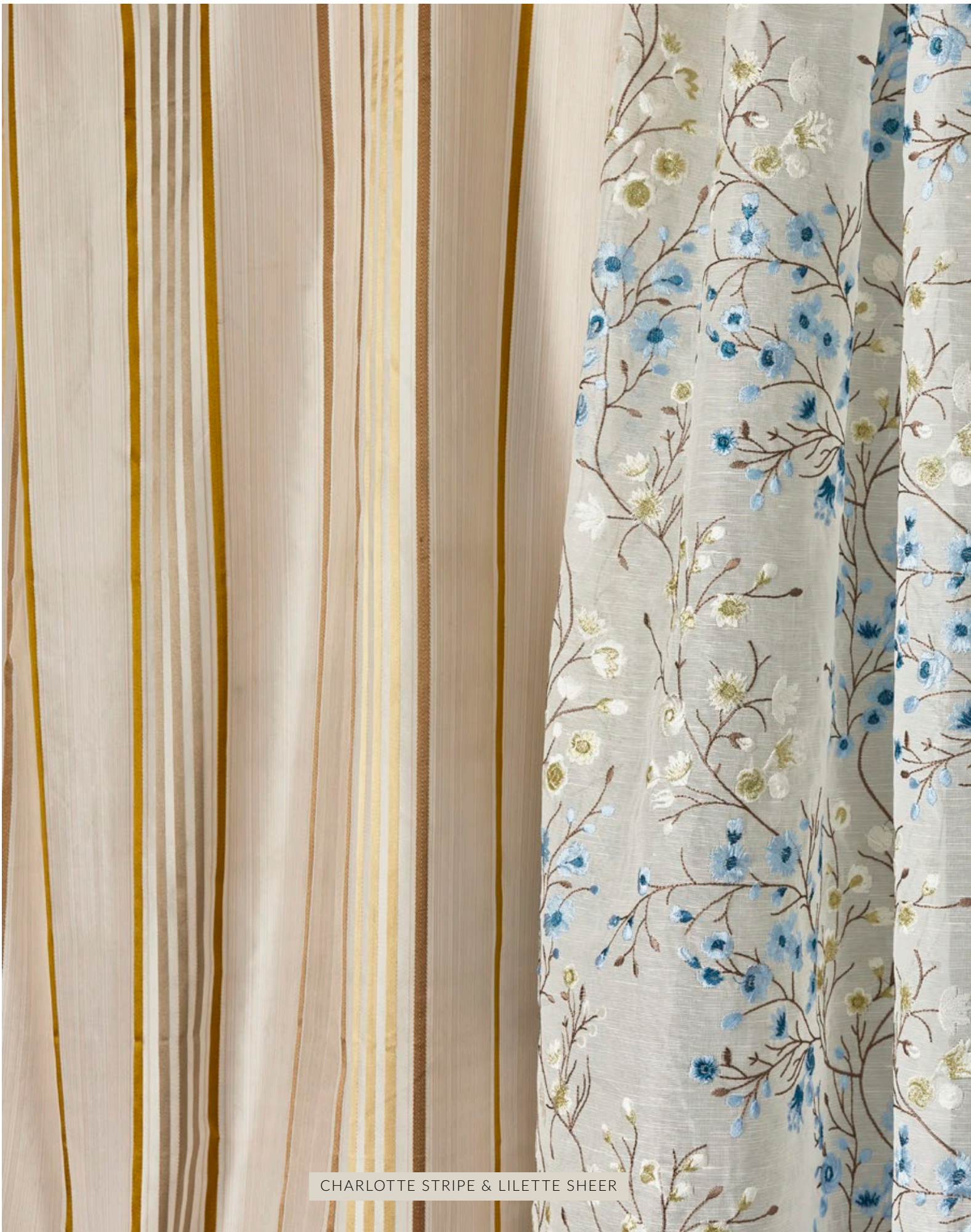
CHARLOTTE STRIPE & LILETTE SHEER