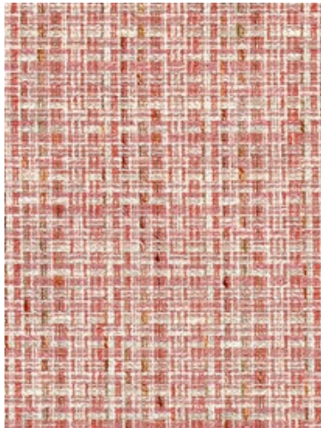
PETAL BI 0006 FAYE