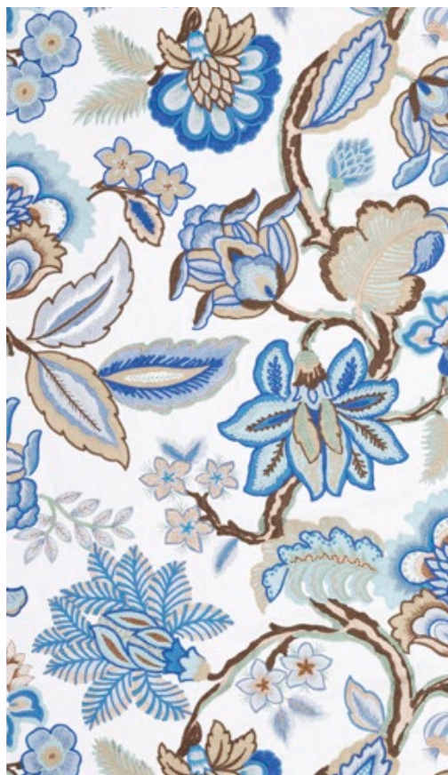
BLUE WOOD S7 0001 HILL

This flowing Jacobean design has been interpreted as a new kind of crewel. With alternated rustic crewel chain stitches with lighter refined embroidery, the effect is multidimensional. Viscose, acrylic and spun polyester yarns are embroidered on a linen cotton ground to create a beautiful juxtaposition.