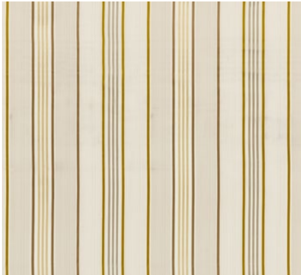
PATINA ND 0005 6130