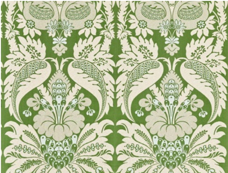
PALM PQ 0001 1865

The silk damask, originally called Diaspron, has been cherished by emperors and kings since it was first introduced in China in 300 BC. Traded along the Silk Road, the caravans passed through Damascus, the center of Syria, which became a hub for manufacturing silk. By the 14th century, these luxury fabrics were known as Damasks. A stylish take on the Newport Damask, this fabric features a thistle artichoke motif with broadly spreading leaves. Estate Damask has translated the traditional motif into a smaller scale, blending silk with cotton and viscose for a less formal air.