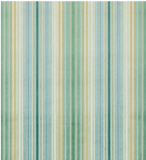
FOREST JM 0003 0592