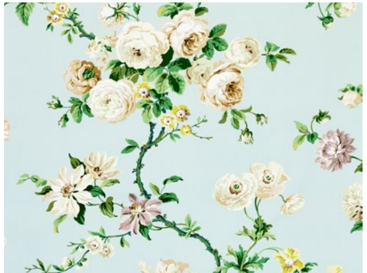
CELADON B0 0002 3506