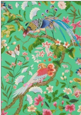
BOTANY BAY WALLCOVERING 6 COLORWAYS (WJR 6822D)

ORDER YOUR MEMOS ONLINE SCALAMANDRE.COM/ WOODLAND-ESTATE