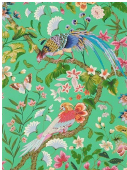
JADE WJR 0006 6822D