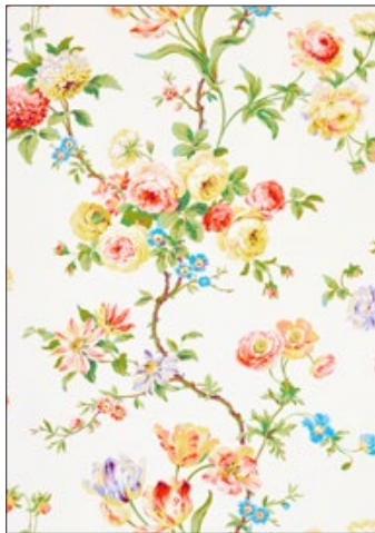
BOTANICAL GARDEN 4 COLORWAYS (B0 3506)