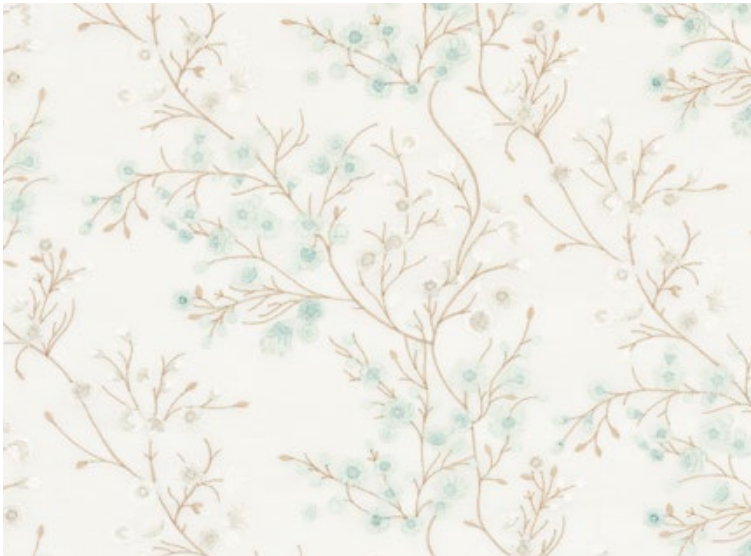
CELADON P4 0003 9863

Lillette embroidered sheer captures hearts with its flowing floral vines in alternating colored and metallic yarns. It is delicately stitched on a silk, cotton and linen sheer ground in single width. In its simple elegance, it is the perfect under curtain for Estate Damask, Ornamental Gate, Charlotte Stripe and Botanical Garden drapery. Complete this perfect room with upholstery in Timberlake Velvet and Faye texture.