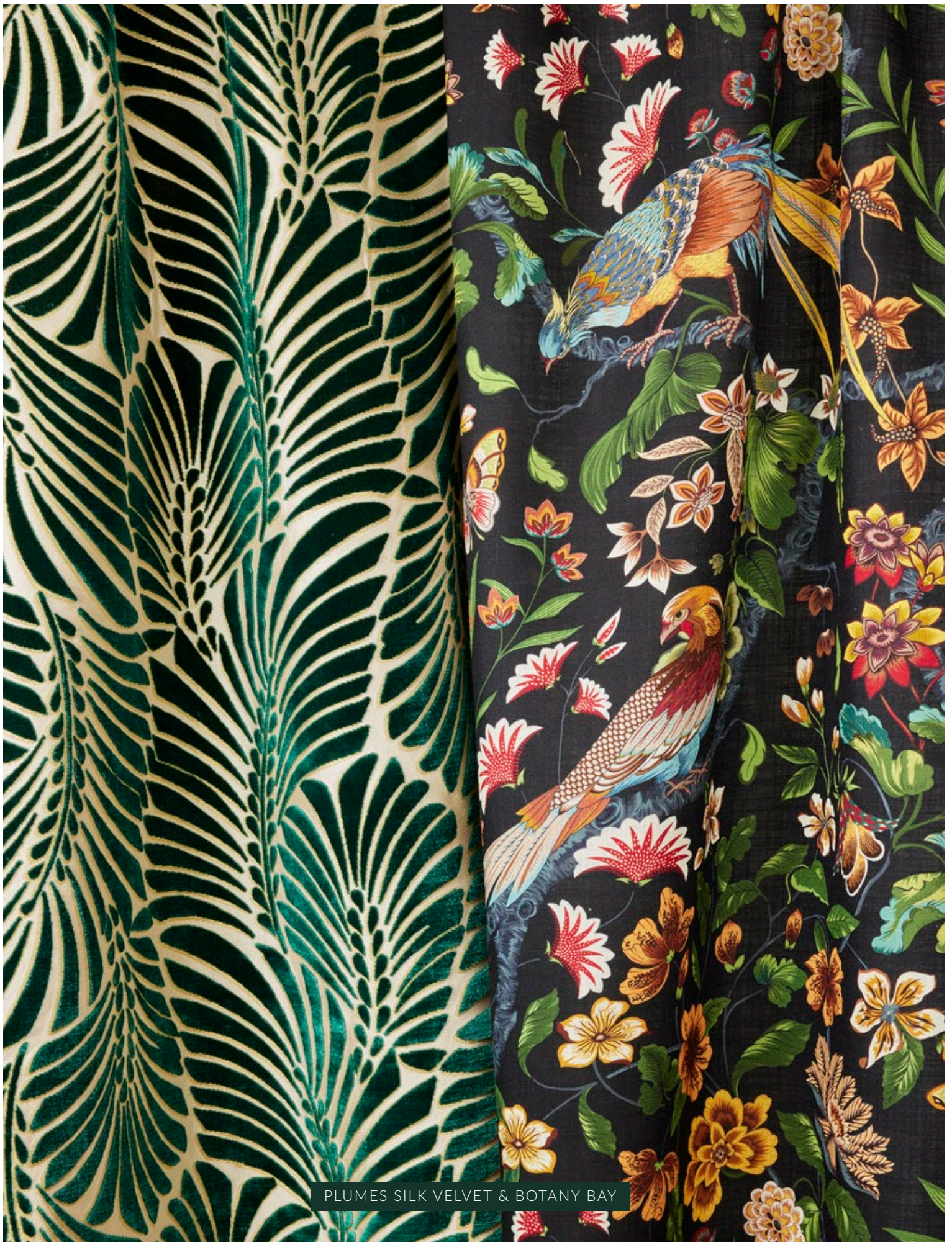
PLUMES SILK VELVET & BOTANY BAY