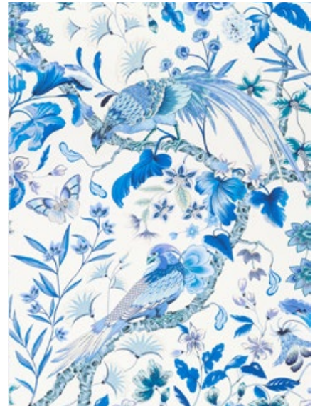
PORCELAIN WJR 0003 6822D