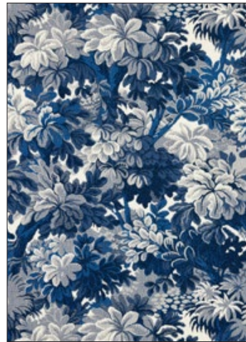
RIDGE EDGE (WOOL) 1 COLORWAY (BZ 060W)