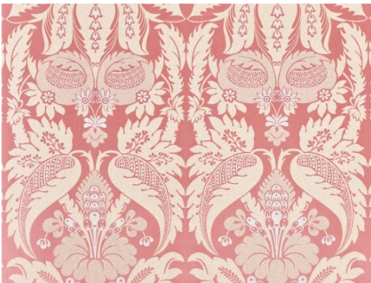
PETAL PQ 0003 1865