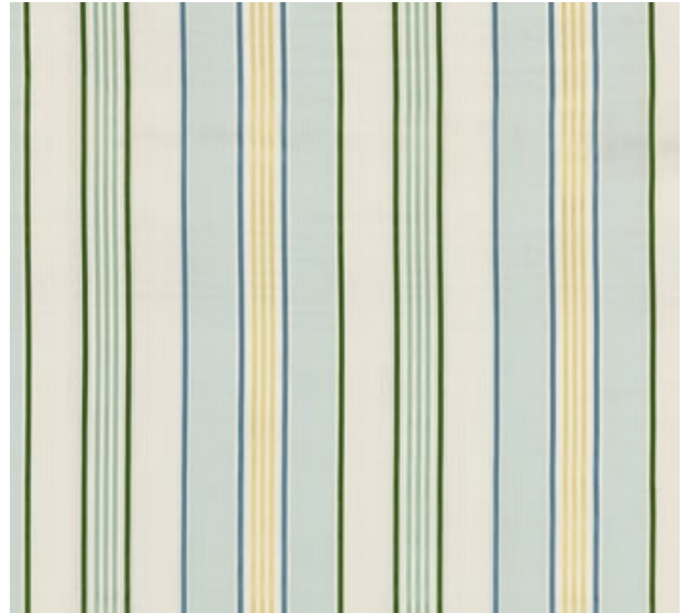
CELADON ND 0003 6130