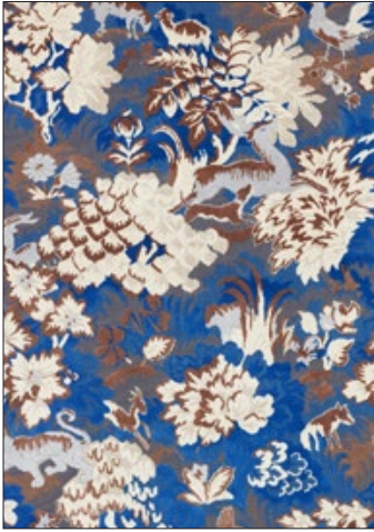
TAILS TALE 3 COLORWAYS (M1 0264)