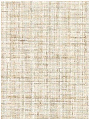
TRAVERTINE BI 0008 FAYE

Faye's immediate appeal as a companion fabric is its interweaving of five diverse, textural yarn qualities in the warp and again in the weft, from space-dyed yarn and chenille to textured linen. While it is unusual and difficult to combine so many kinds of yarns in the warp, this allows for a multicolored, tactile, versatile texture. Faye is woven at a skilled Italian mill and makes a perfect choice for seating in any room.