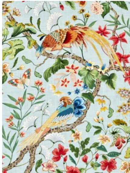
SKY MULTI JP 0001 1340