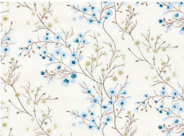
PORCELAIN P4 0004 9863