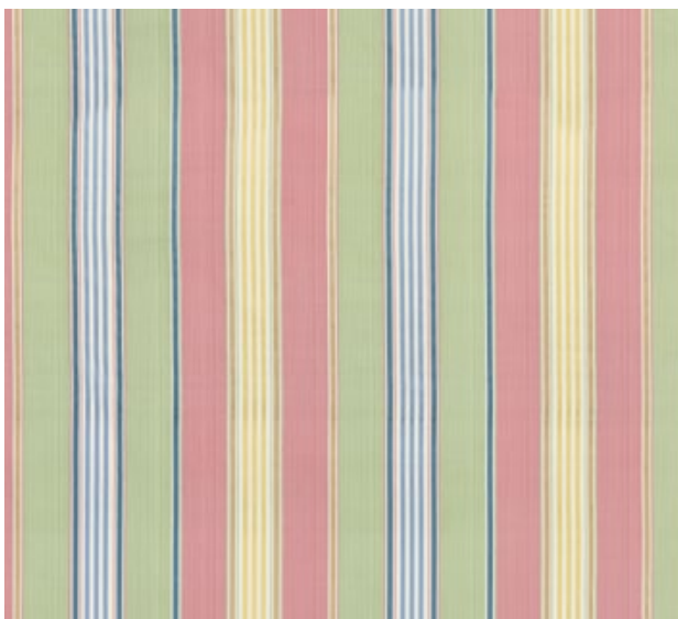
PERENNIAL ND 0004 6130