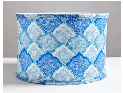
AKIRA - PORCELAIN BLUE LTJ 003S JP4660A