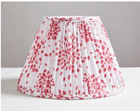
FIREWORKS – CUPCAKE PINK LTJ 00DS HNF1020B