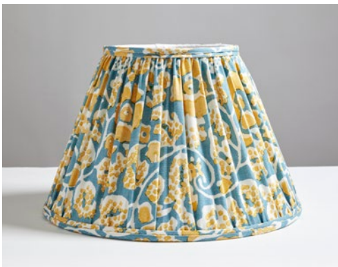
MAIDEN FLORAL – ARUBA LTJ 002S GW16629B