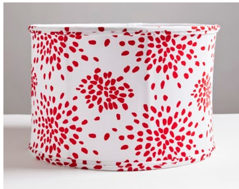
FIREWORKS - RED ON WHITE LTJ 00RS HNF1020A