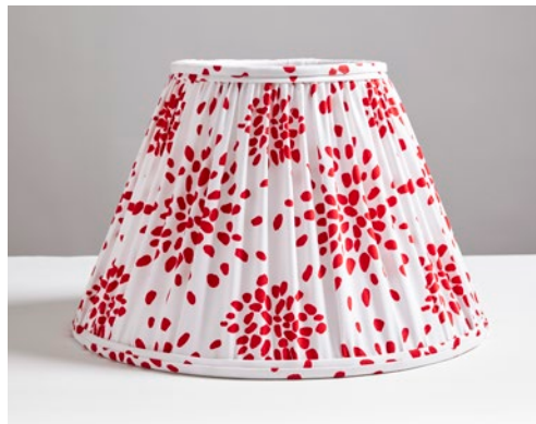
FIREWORKS – RED ON WHITE LTJ 00RS HNF1020B