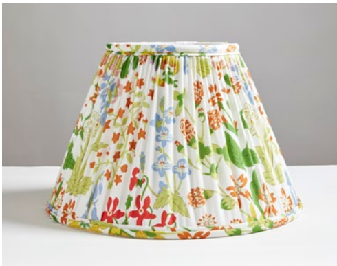
NYMPH FLORAL – SPRINGTIME LTJ 001S GW16630B