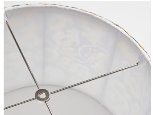
INSIDE VIEW OF DRUM SHADE