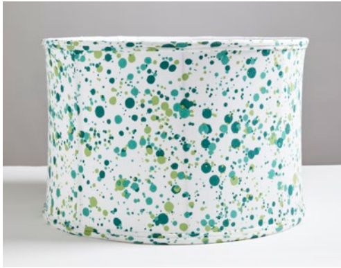
SPATTER - MERMAID* LTJ 00GS HNF0153A