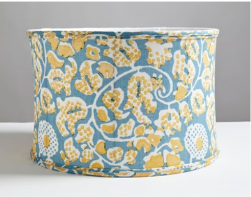
MAIDEN FLORAL - ARUBA LTJ 002S GW16629A