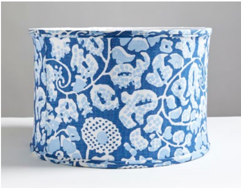
MAIDEN FLORAL - DENIM LTJ 003S GW16629A