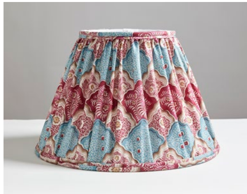
AKIRA – PEACOCK ROSE LTJ 001S JP4660B