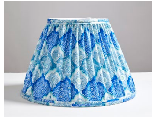
AKIRA – PORCELAIN BLUE LTJ 003S JP4660B