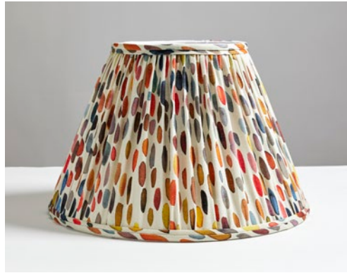
JAMBOREE – BLUE / MULTI LTJ 003S LO5096B