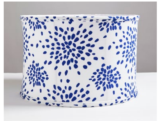
FIREWORKS - BLUE ON WHITE LTJ 00BS HNF1020A