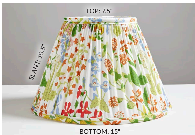
PLEATED SHADE - NYMPH FLORAL - SPRINGTIME