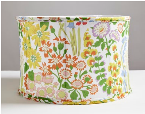
NYMPH FLORAL - SPRINGTIME LTJ 001S GW16630A