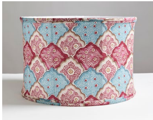
AKIRA - PEACOCK ROSE LTJ 001S JP4660A