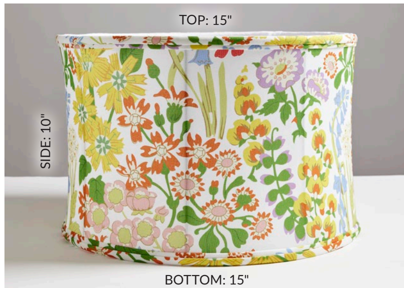
DRUM SHADE - NYMPH FLORAL - SPRINGTIME