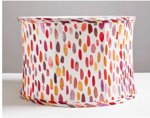
JAMBOREE - WILD BERRY LTJ 007S LO5096A