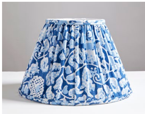
MAIDEN FLORAL – DENIM LTJ 003S GW16629B