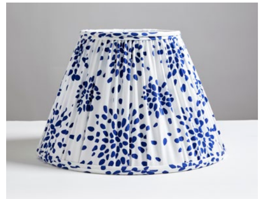
FIREWORKS – BLUE ON WHITE LTJ 00BS HNF1020B