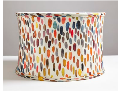
JAMBOREE - BLUE / MULTI LTJ 003S LO5096A