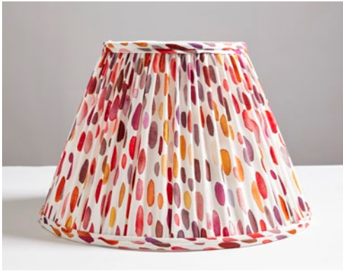
JAMBOREE – WILD BERRY LTJ 007S LO5096B