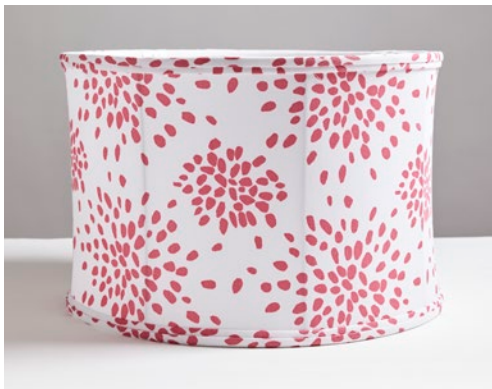
FIREWORKS - CUPCAKE PINK LTJ 00DS HNF1020A