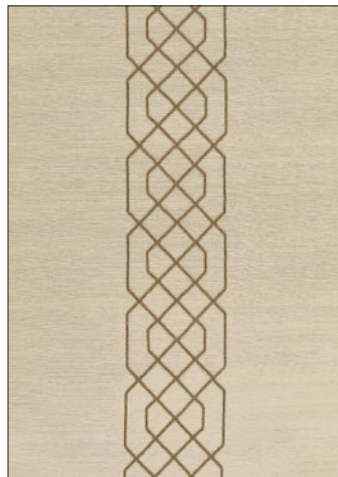
ADELAIDE BEADED SISAL 4 COLORWAYS (SC WP88385)