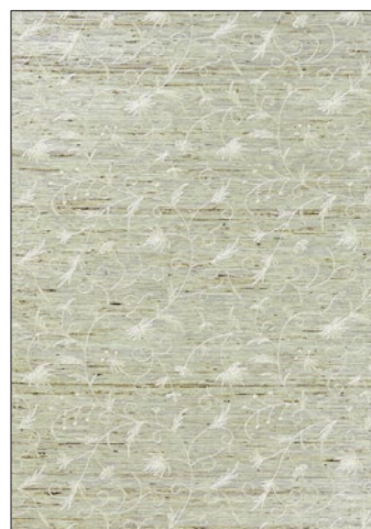
OLIVIA EMBROIDERED GRASSCLOTH 1 COLORWAY (SC WP88384)

PLAIN GROUNDS ARE AVAILABLE FOR ALL KINGSLEY OFFERINGS