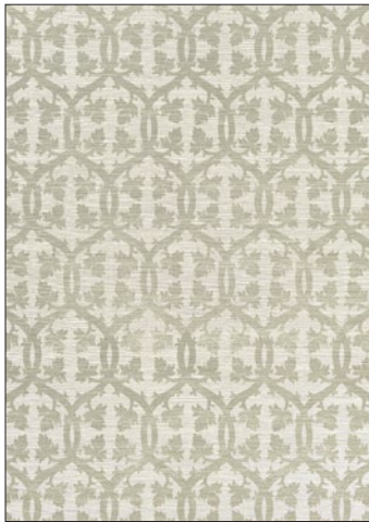
FALK MANOR HOUSE SISAL 4 COLORWAYS (SC WP88379)