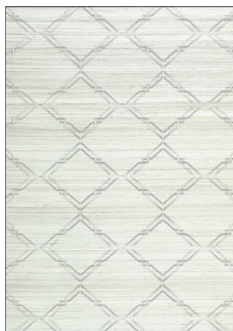
MONROE EMBROIDERED GRASSCLOTH 3 COLORWAYS (SC WP88383)