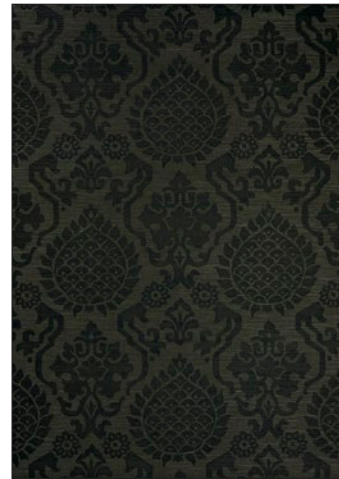
SURAT SISAL 4 COLORWAYS (SC WP88378)