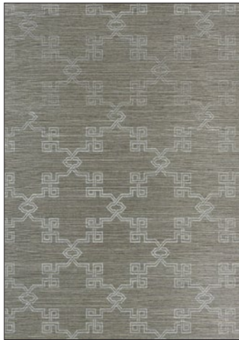
SUZHOU LATTICE SISAL 5 COLORWAYS (SC WP88374)