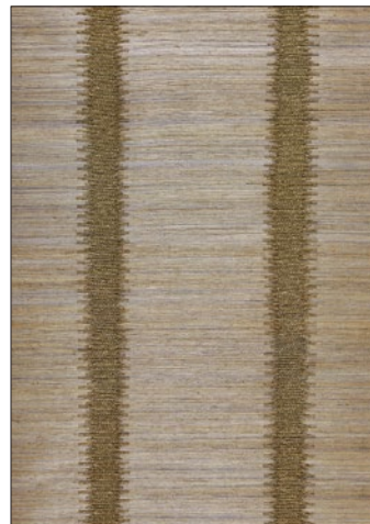
VERONICA BEADED GRASSCLOTH 4 COLORWAYS (SC WP88386)