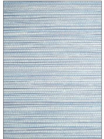
WILLOW WEAVE 12 COLORWAYS (SC WP88441)