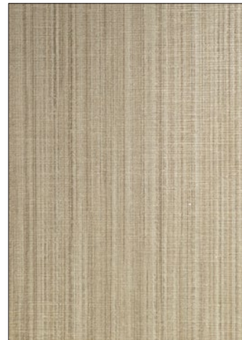
GREAT PLAINS 7 COLORWAYS (SC WP88439)