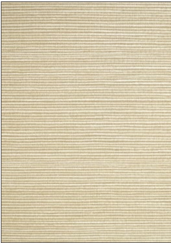
SAVANNA SEEDLING 12 COLORWAYS (SC WP88442)