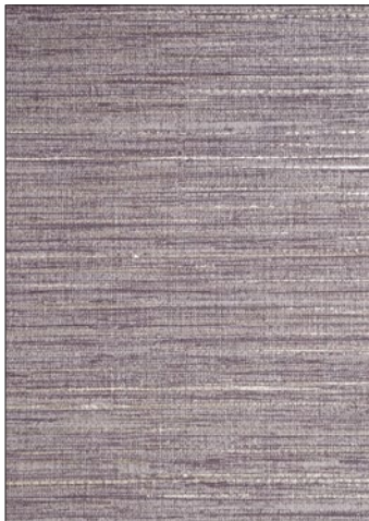
FEATHER REED 11 COLORWAYS (SC WP88437)