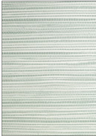
SEAGRASS 7 COLORWAYS (SC WP88440)