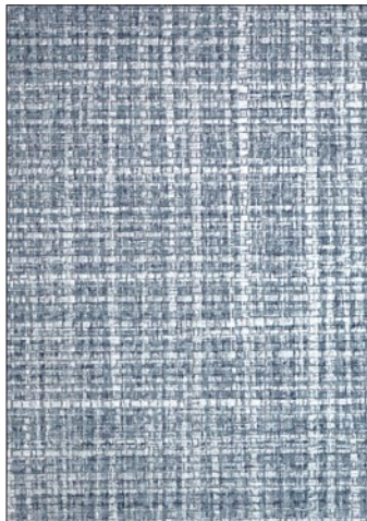
JUTE 8 COLORWAYS (SC WP88443)