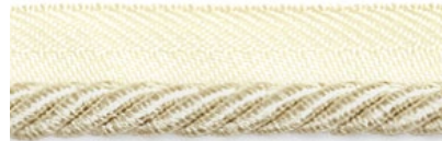
BOULEVARD CORD 24 COLORWAYS (SC C314)