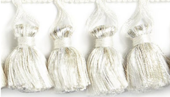
PLAZA TASSEL FRINGE 11 COLORWAYS (SC FT1505)