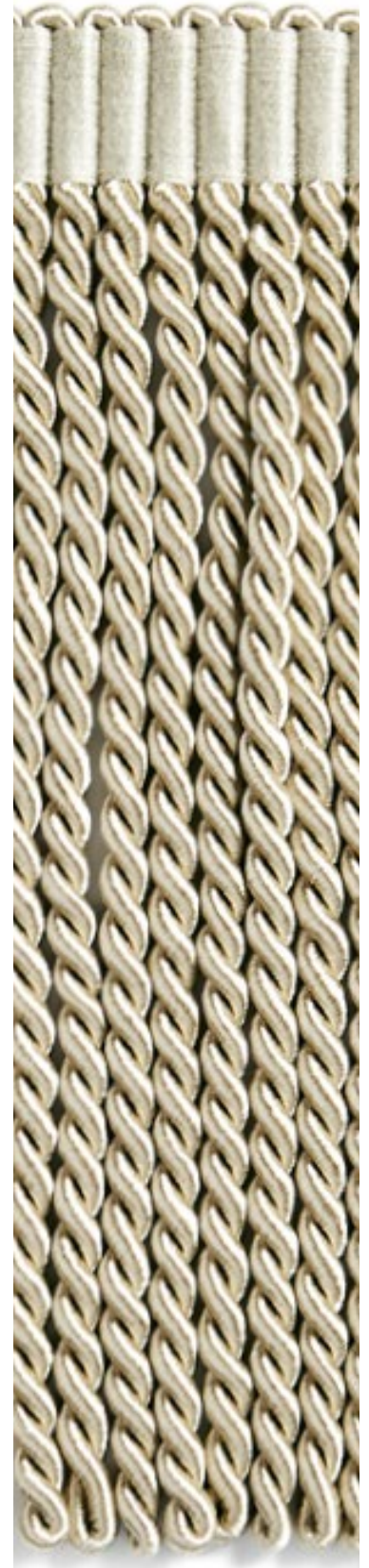
WINDSOR BULLION 5 COLORWAYS (SC FX1503)