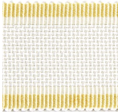
ODEON SHIMMER BRAID 7 COLORWAYS (SC V1249)