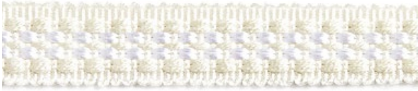
HELENA BRAID 11 COLORWAYS (SC V1250)