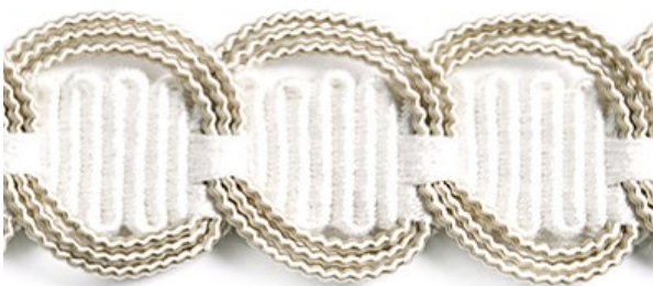
CRESCENT BRAID 6 COLORWAYS (SC V1248)