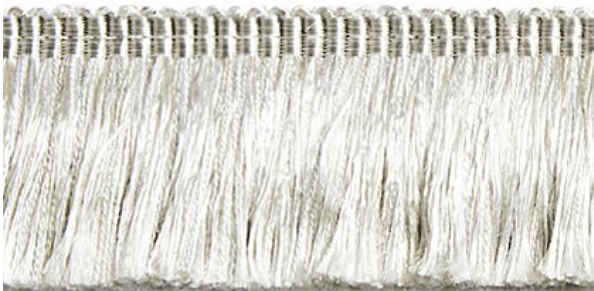
GRIPSHOLM BRUSH FRINGE 11 COLORWAYS (SC FC1497)