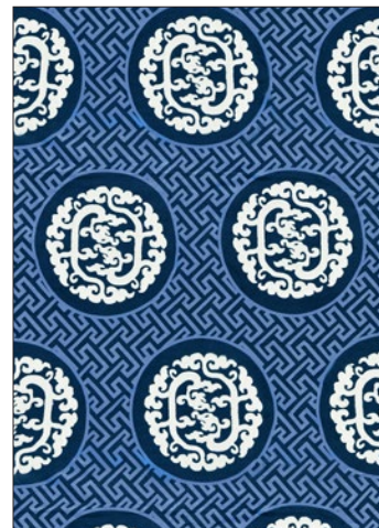
DRAGON'S FRET EMBROIDERY 2 COLORWAYS (SC 27215)