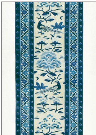
ROYAL PEONY LINEN PRINT 3 COLORWAYS (SC 16613)