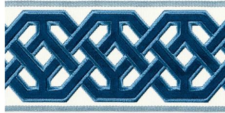
BEAUFORT VELVET TAPE 4 COLORWAYS (SC T3322)