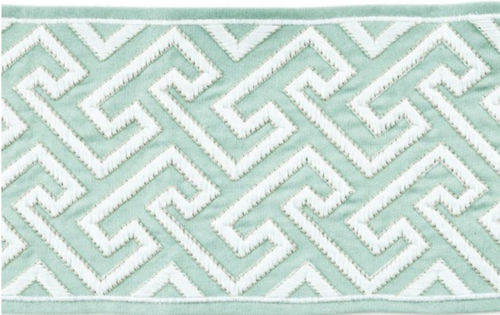
LABYRINTH EMBROIDERED TAPE 5 COLORWAYS (SC T3319)