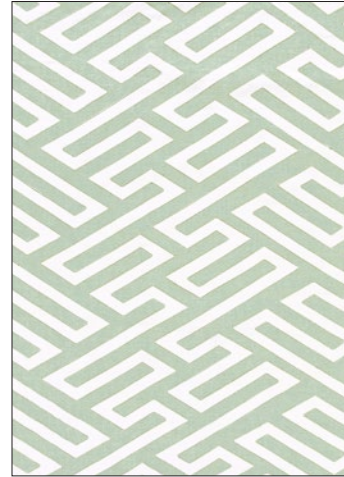
CANTON FRET APPLIQUE 4 COLORWAYS (SC 27218)