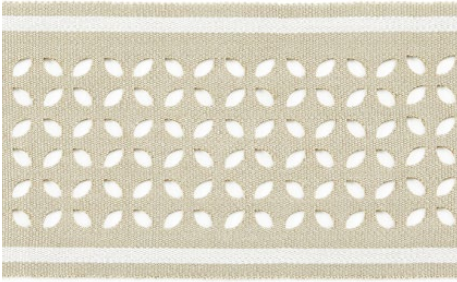
CASSIS LASER CUT TAPE 3 COLORWAYS (SC T3323)