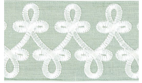
EMPRESS EMBROIDERED TAPE 4 COLORWAYS (SC T3321)