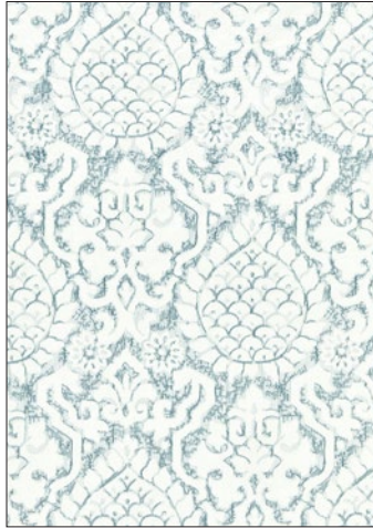
SURAT EMBROIDERY 3 COLORWAYS (SC 27217)