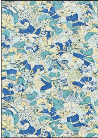
DRAGON DANCE 3 COLORWAYS (SC 16612)