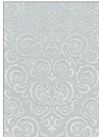
CIRRUS VELVET DAMASK 3 COLORWAYS (SC 27219)