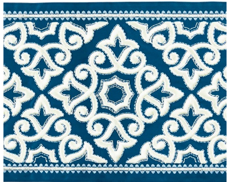
ORNAMENTAL EMBROIDERED TAPE 5 COLORWAYS (SC T3320)