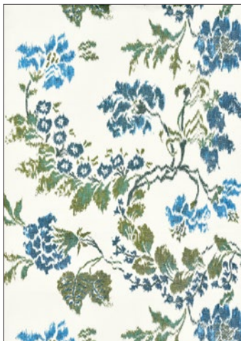
KEW GARDENS WARP PRINT 2 COLORWAYS (SC 16611)