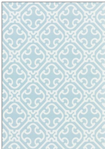
AILIN LATTICE WEAVE 6 COLORWAYS (SC 27214)