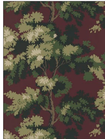
RAPHAEL 8 COLORWAYS (WSB 0444)