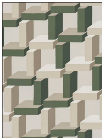
CHRISTIAN 3 COLORWAYS (WSB 0800)