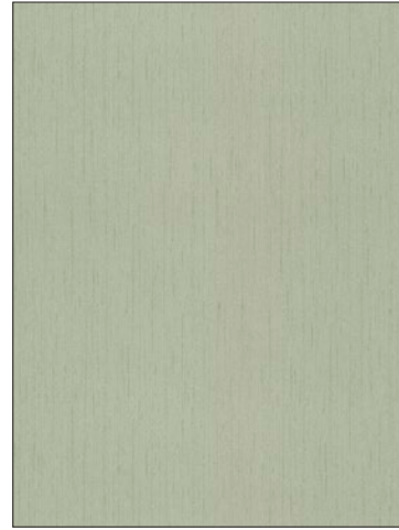
CELINE 4 COLORWAYS (WSB 0230)