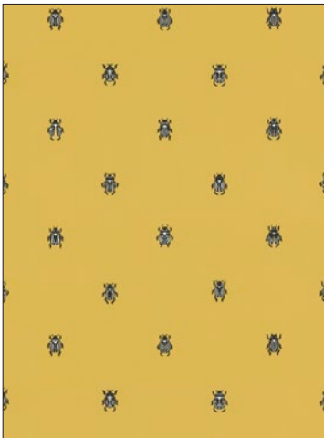
AUDREY 3 COLORWAYS (WSB 0231)