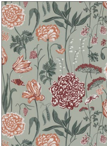
AURELIE 2 COLORWAYS (WSB 0434)