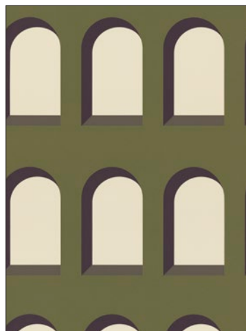
MARIE 3 COLORWAYS (WSB 0801)