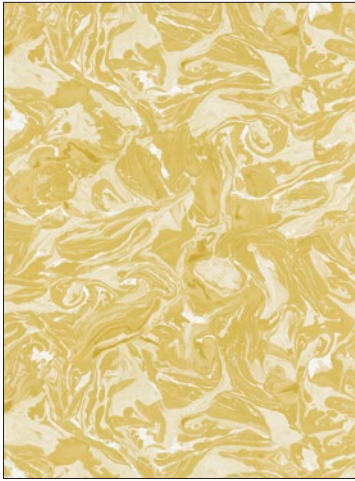
MARION 4 COLORWAYS (WSB 0228)