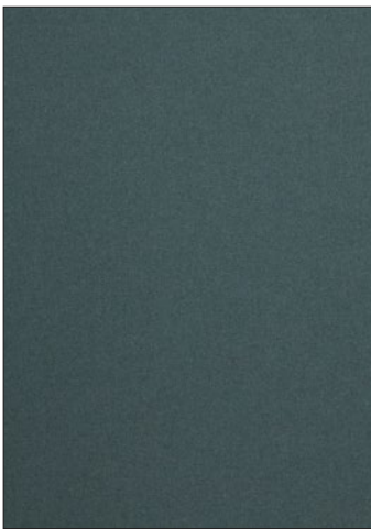
TAIGA 23 COLORWAYS (H0 0638)