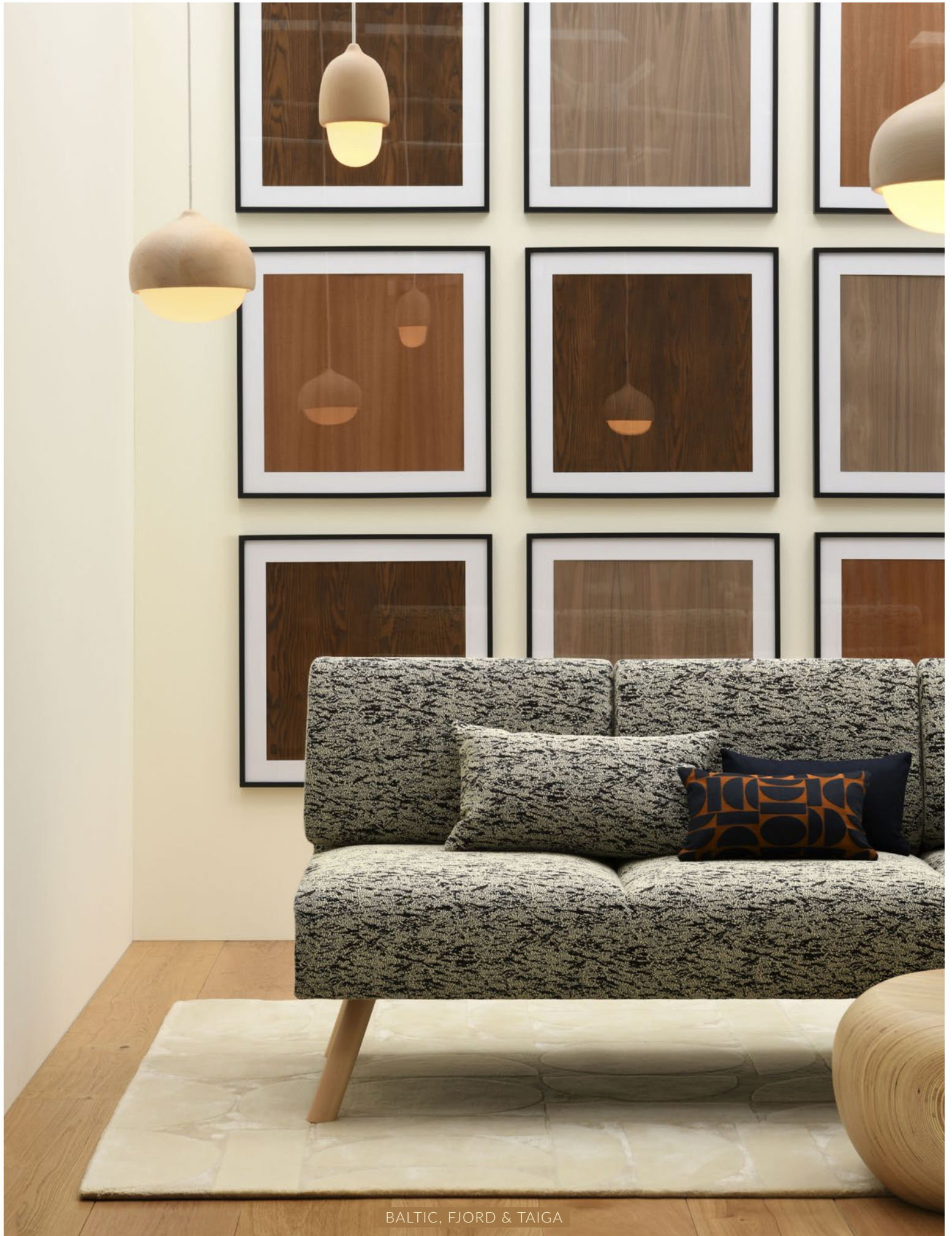
BALTIC, FJORD & TAIGA