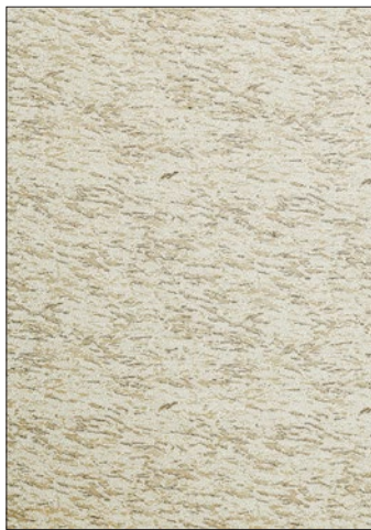
BALTIC 4 COLORWAYS (H0 4259)