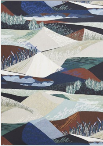
ALTITUDE TAPESTRY 2 COLORWAYS (H0 0635)