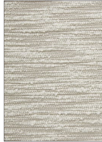
HELSINKI 1 COLORWAY (H0 0636)