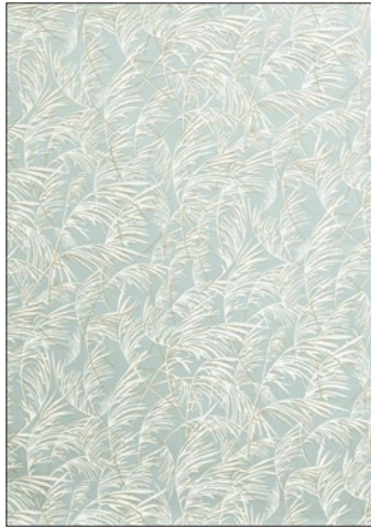
GRAMINAE 5 COLORWAYS (H0 0637)