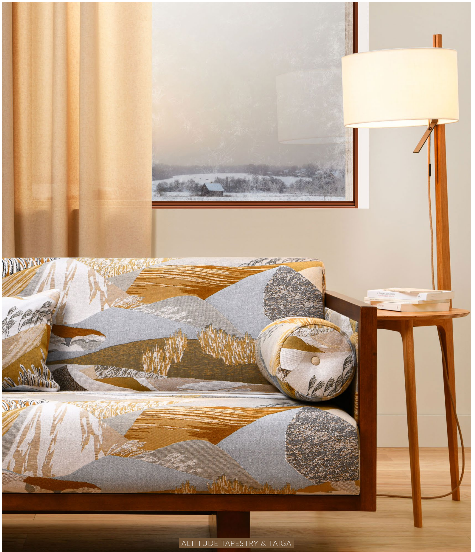
ALTITUDE TAPESTRY & TAIGA