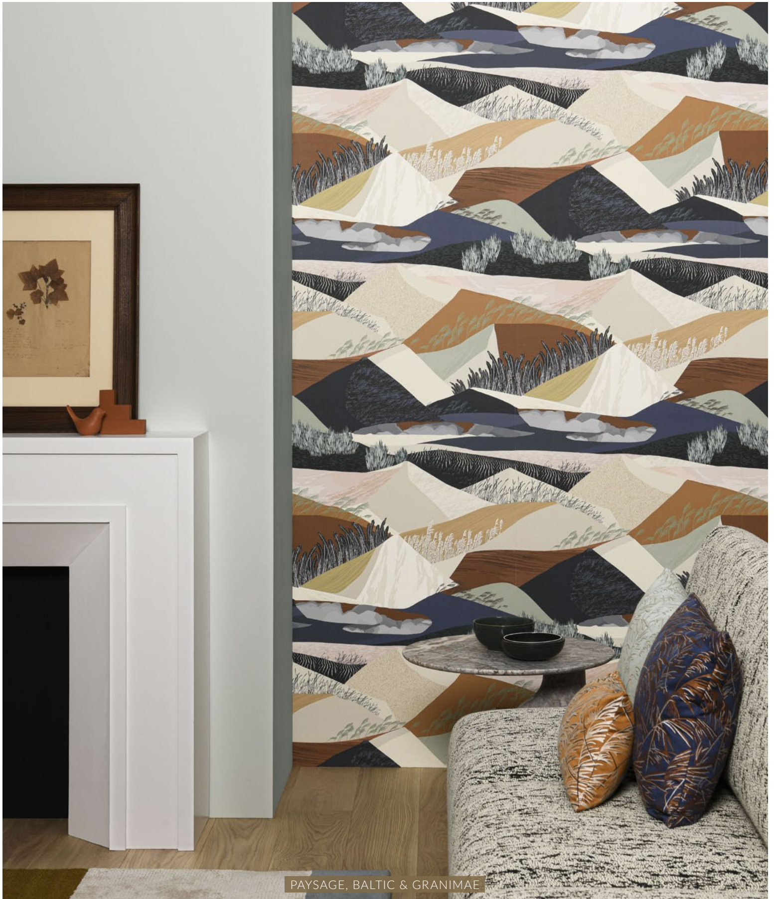
PAYSAGE, BALTIC & GRANIMAE