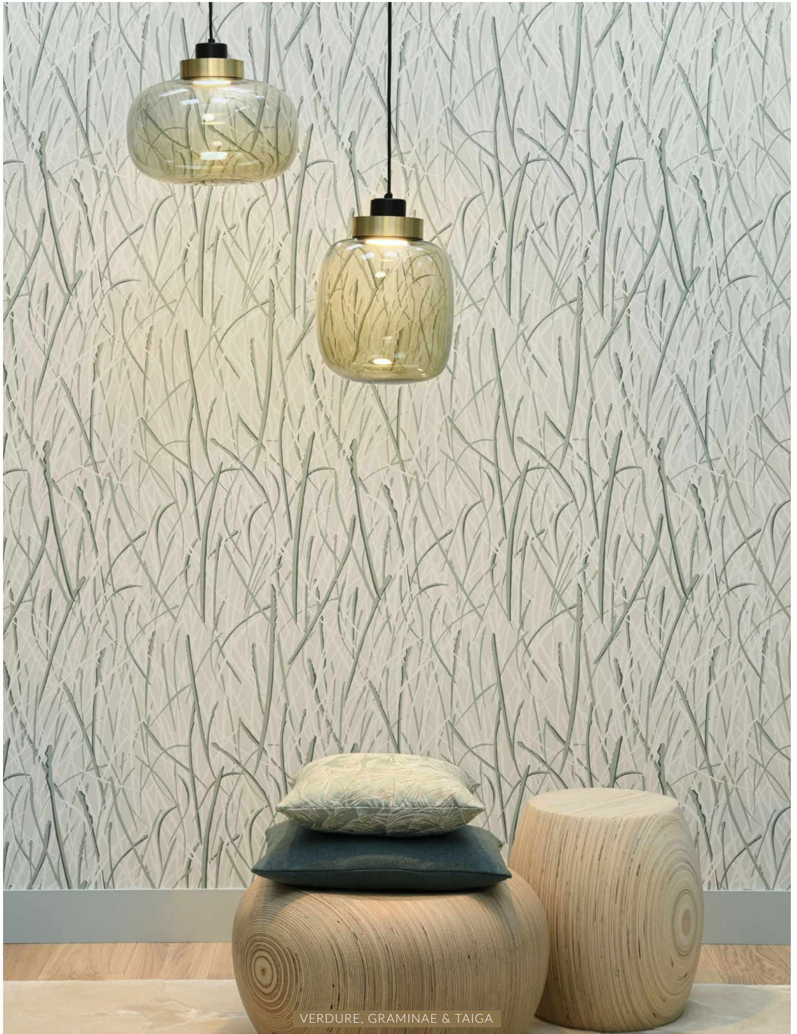
VERDURE, GRAMINAE & TAIGA