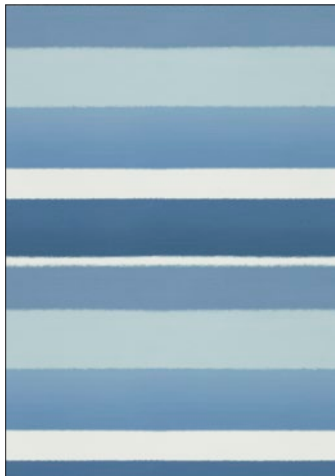
VARIATION 3 COLORWAYS (H0 6456)