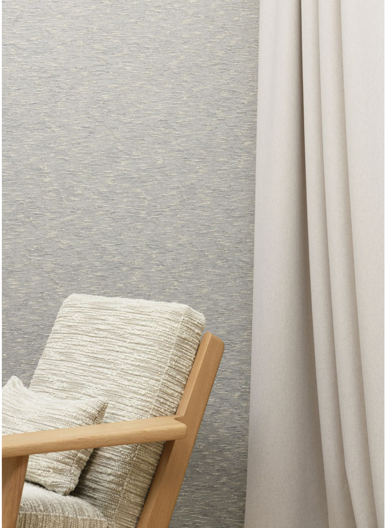
ONDULATION, HELSINKI & TAIGA