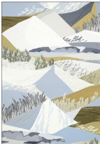
PAYSAGE 2 COLORWAYS (H0 6455) INSPIRED BY ALTITUDE TAPESTRY