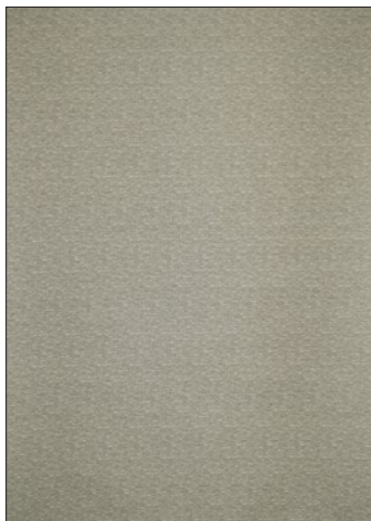
REFLET 6 COLORWAYS (H0 6459)