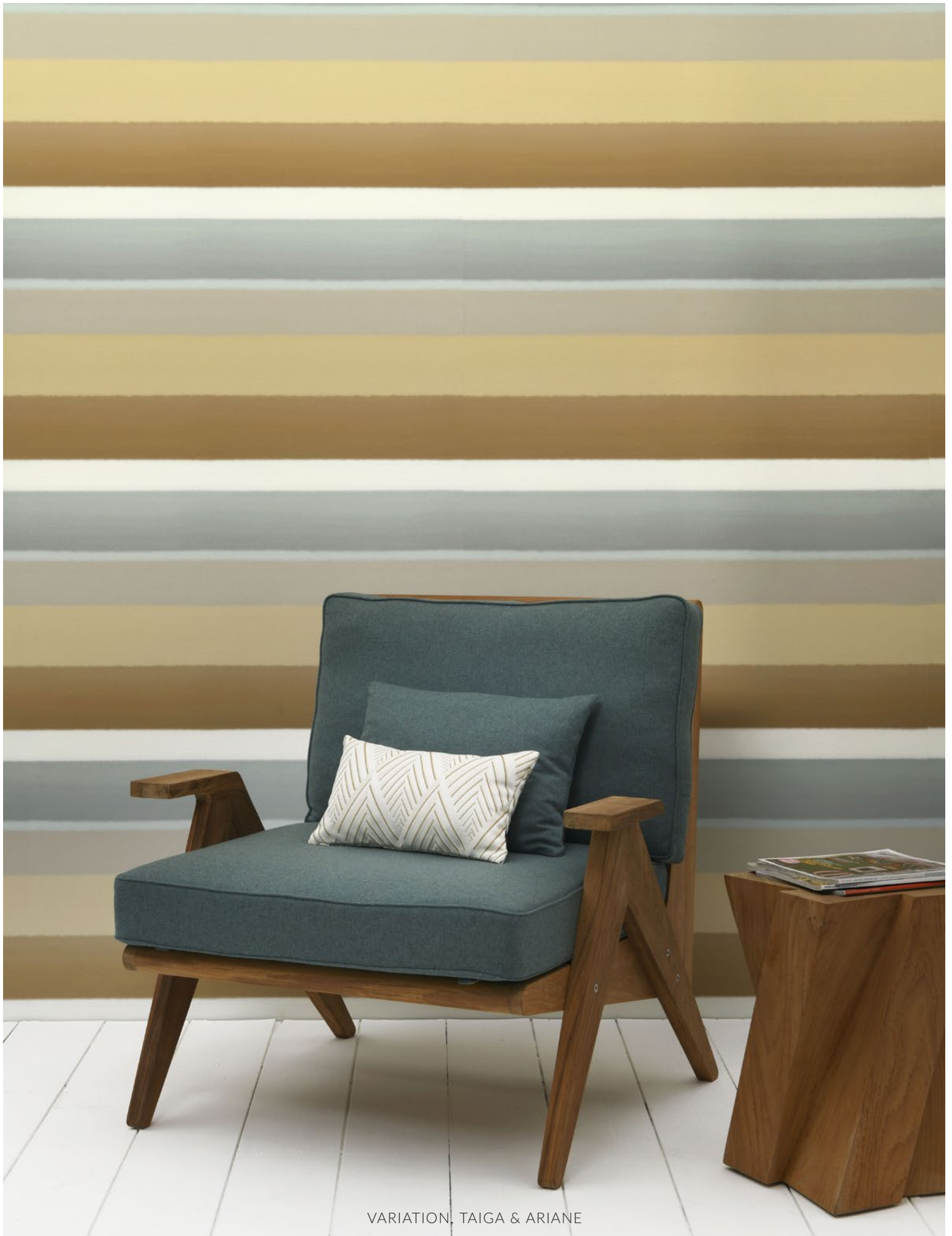
VARIATION, TAIGA & ARIANE