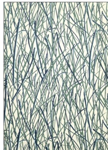
VERDURE 3 COLORWAYS (H0 6454)