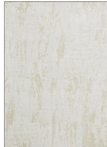
ARBORE 3 COLORWAYS (H0 6460)