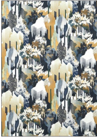
FORÊT 1 COLORWAYS (H0 6451) INSPIRED BY MERLIN TAPESTRY