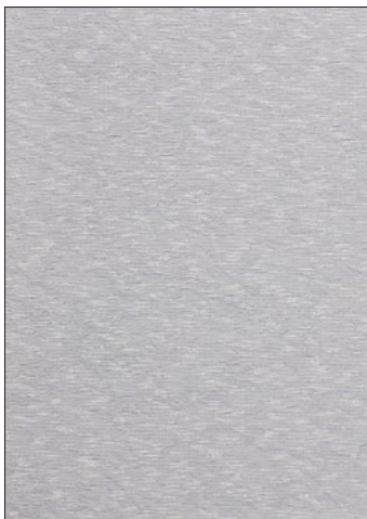
ONDULATION 3 COLORWAYS (H0 6458) INSPIRED BY BALTIC