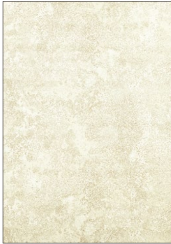
CONSTELLATION 2 COLORWAYS (H0 6452) INSPIRED BY ASTRAL