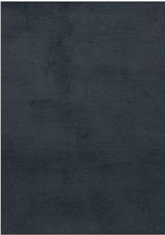
COSSE 4 COLORWAYS (H0 0614)