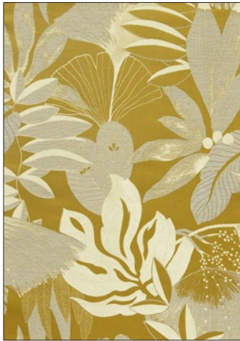
HORTUS 4 COLORWAYS (H0 0609)