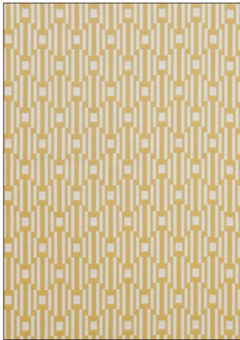
OSIER 6 COLORWAYS (H0 0615)