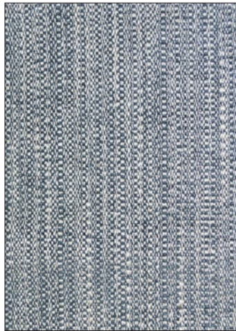
PALISSE 5 COLORWAYS (H0 0605)