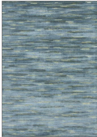
MERISIER 6 COLORWAYS (H0 0611)