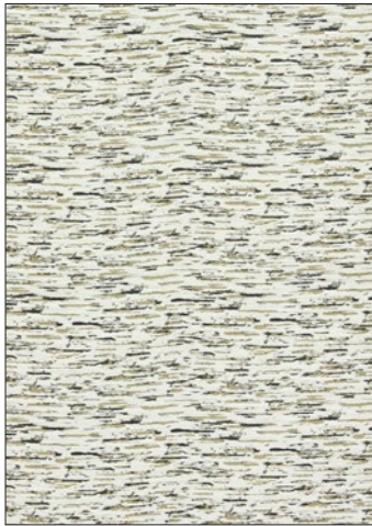
ECORCE 1 COLORWAY (H0 0612)