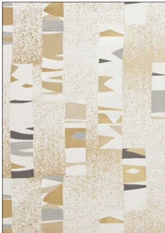
TOUNDRA 1 COLORWAY (H0 4247)