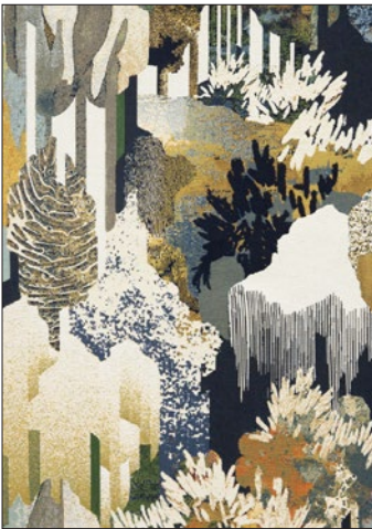
MERLIN 1 COLORWAY (H0 0610)