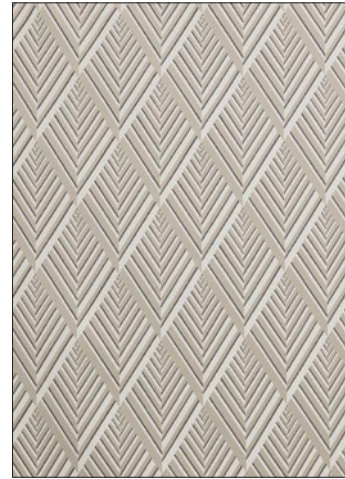
ARIANE 7 COLORWAYS (HO 4256)