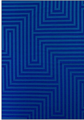
HERA 8 COLORWAYS (HO 4258)