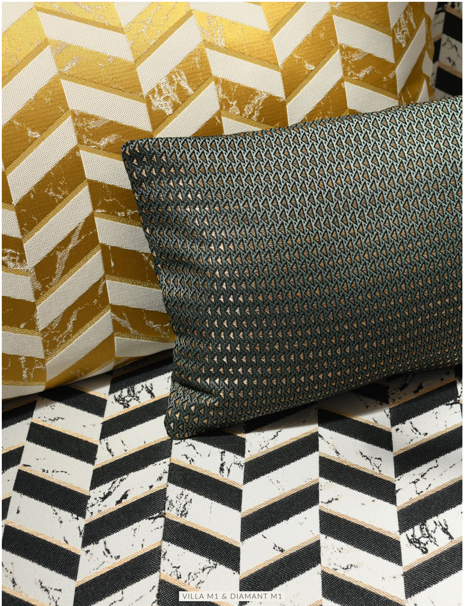
VILLA M1 & DIAMANT M1