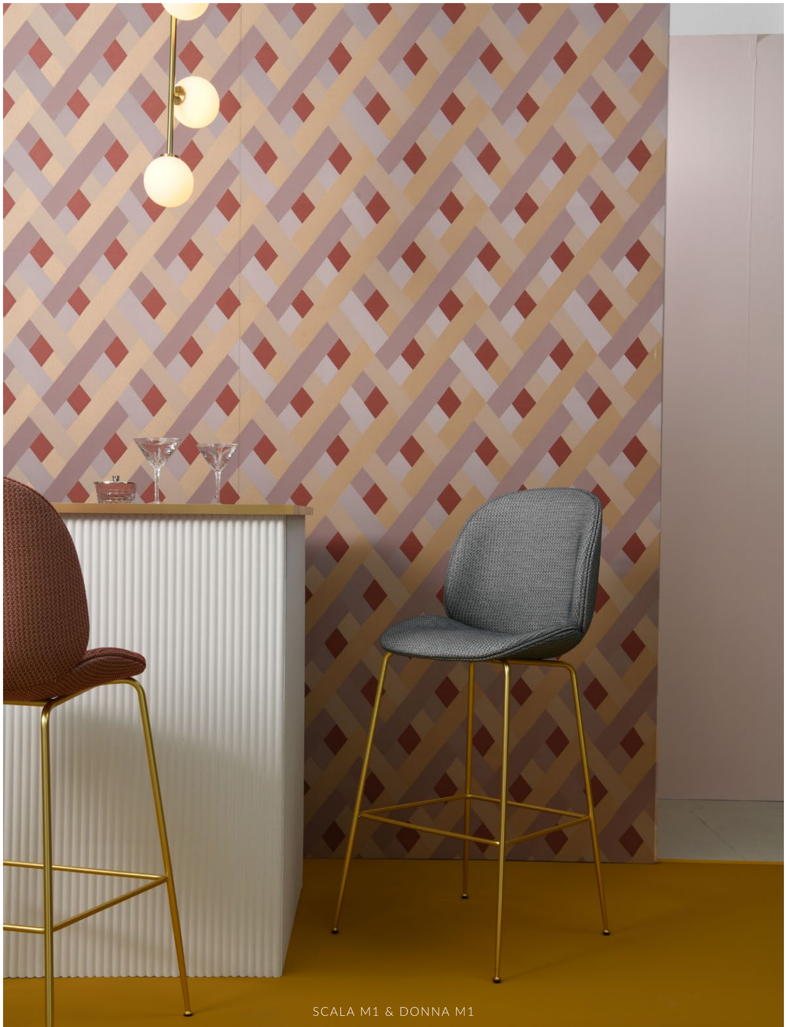
SCALA M1 & DONNA M1