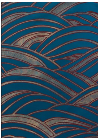
DUOMO M1 3 COLORWAYS (H0 4250)