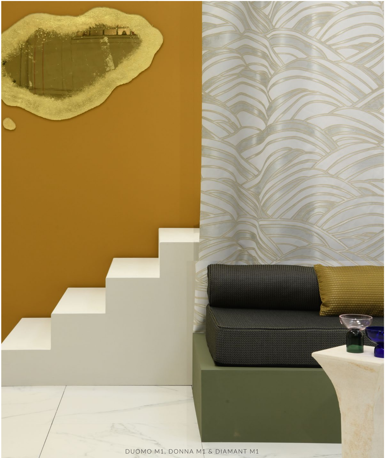
DUOMO M1, DONNA M1 & DIAMANT M1