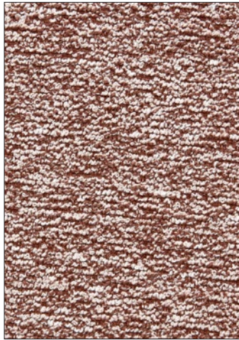
PIAZZA M1 8 COLORWAYS (H0 0803)