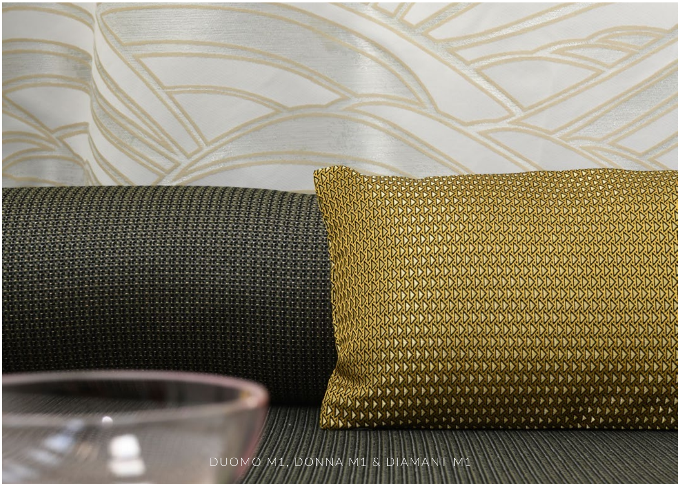
DUOMO M1, DONNA M1 & DIAMANT M1