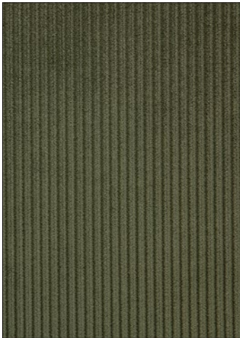
RIGA M1 24 COLORWAYS (H0 0806)