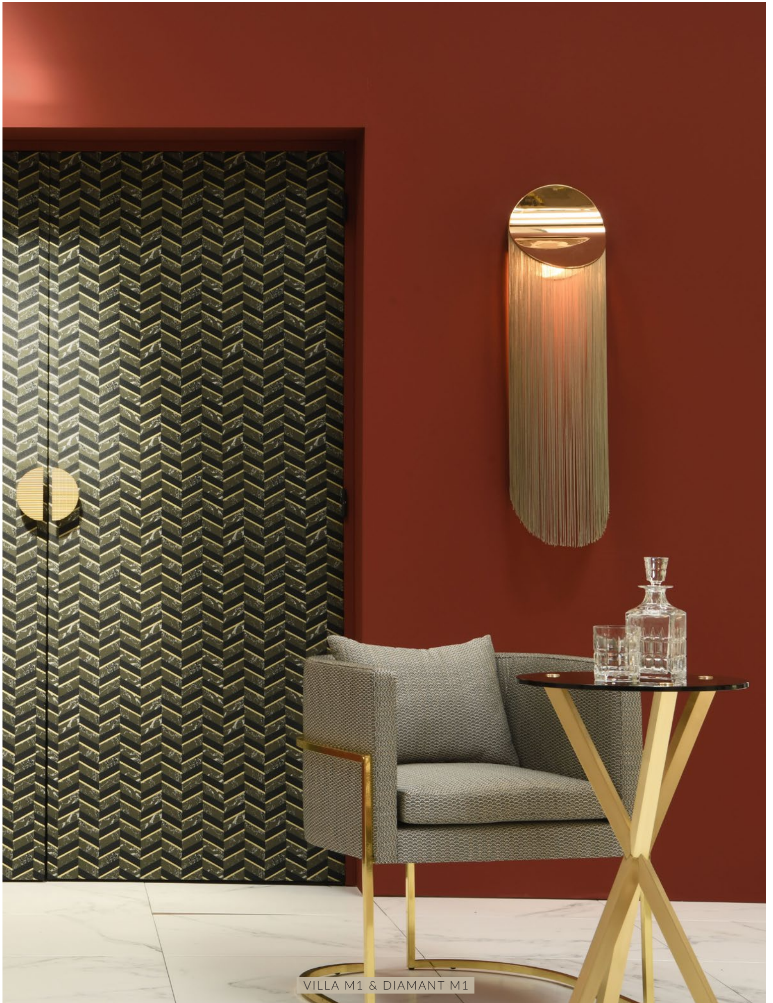
VILLA M1 & DIAMANT M1