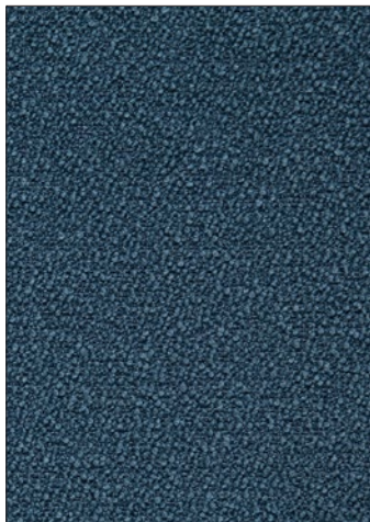
LAGO M1 16 COLORWAYS (H0 0802)