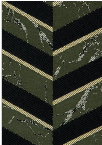
VILLA M1 7 COLORWAYS (H0 4249)