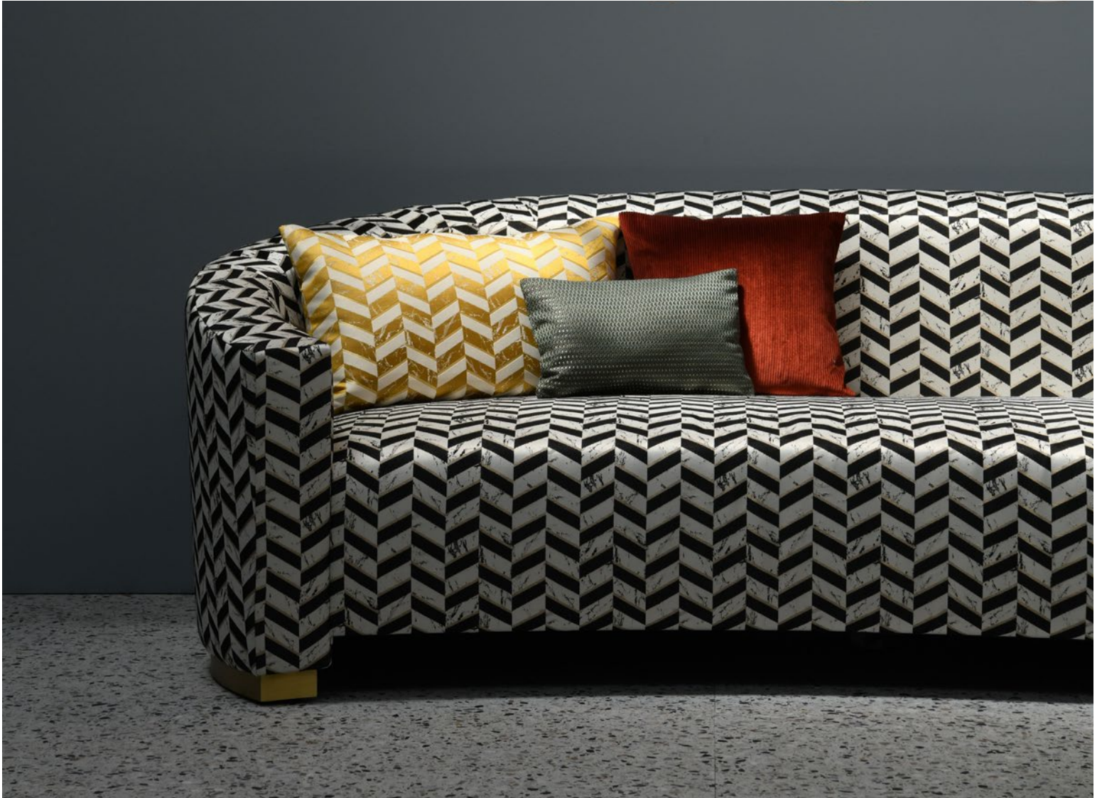
VILLA M1, DIAMANT M1 & RIGA M1