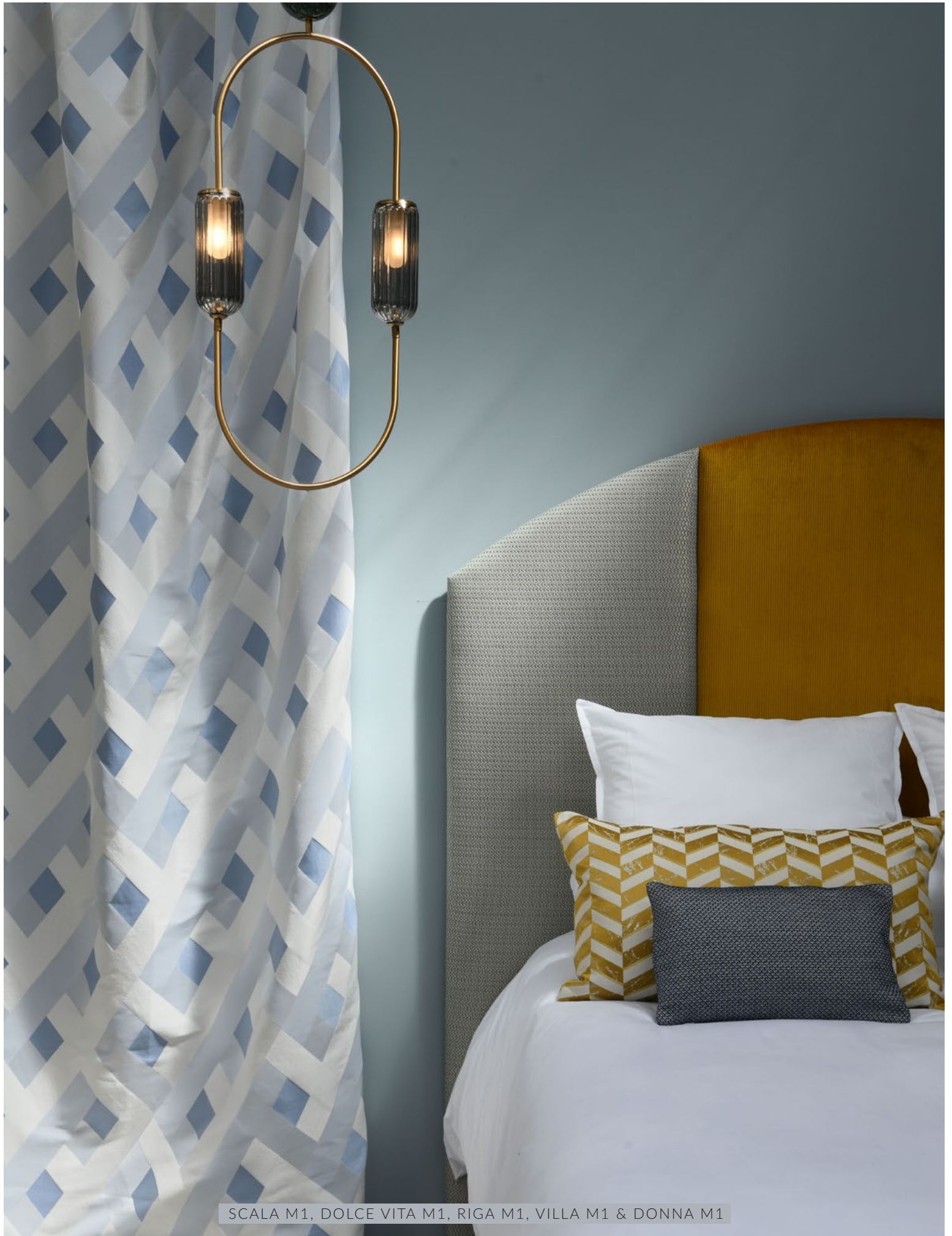
SCALA M1, DOLCE VITA M1, RIGA M1, VILLA M1 & DONNA M1