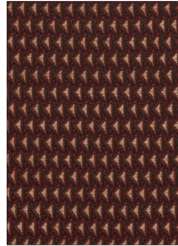
DIAMANT M1 10 COLORWAYS (H0 4248)