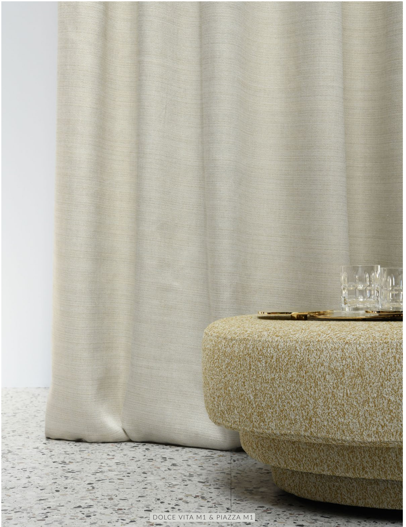
DOLCE VITA M1 & PIAZZA M1