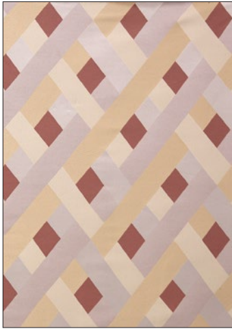
SCALA M1 5 COLORWAYS (H0 0805)