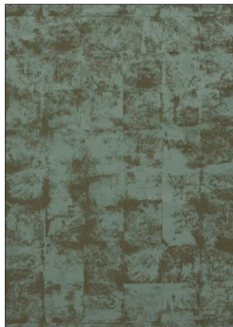
FRESQUE 4 COLORWAYS (H0 0801)