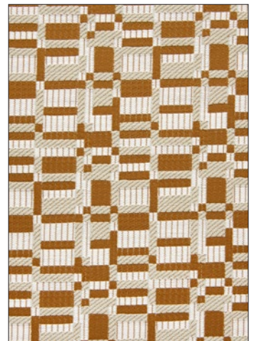
KIOSQUE 7 COLORWAYS (H0 0799)