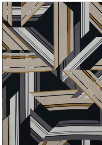
SKIF 3 COLORWAYS (H0 0800)