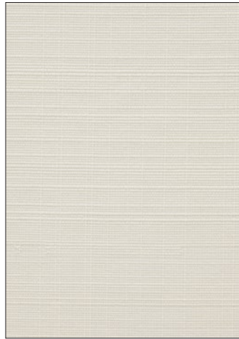
PANAMA 5 COLORWAYS (H0 0796)