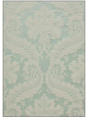
VICTORIA 9 COLORWAYS (H0 4240)