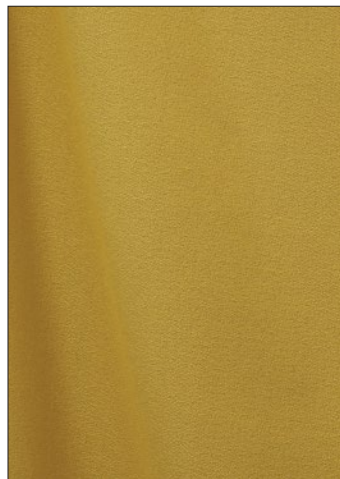
DANDY 26 COLORWAYS (H0 0795)