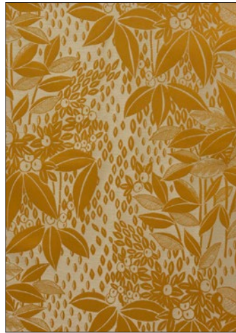
VETIVER 5 COLORWAYS (H0 4241)