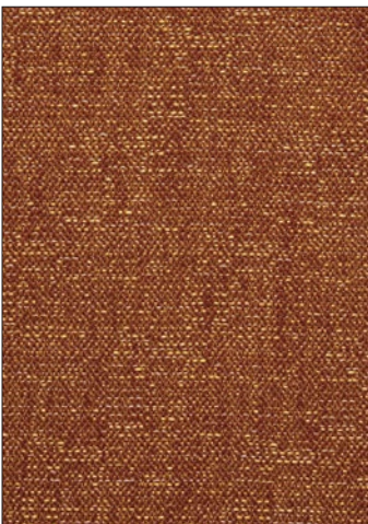
TWEED 6 COLORWAYS (H0 0798)