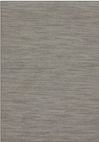
ALLIAGE 2 COLORWAYS (H0 1366)