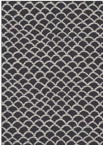
ARBOUR 4 COLORWAYS (31655)