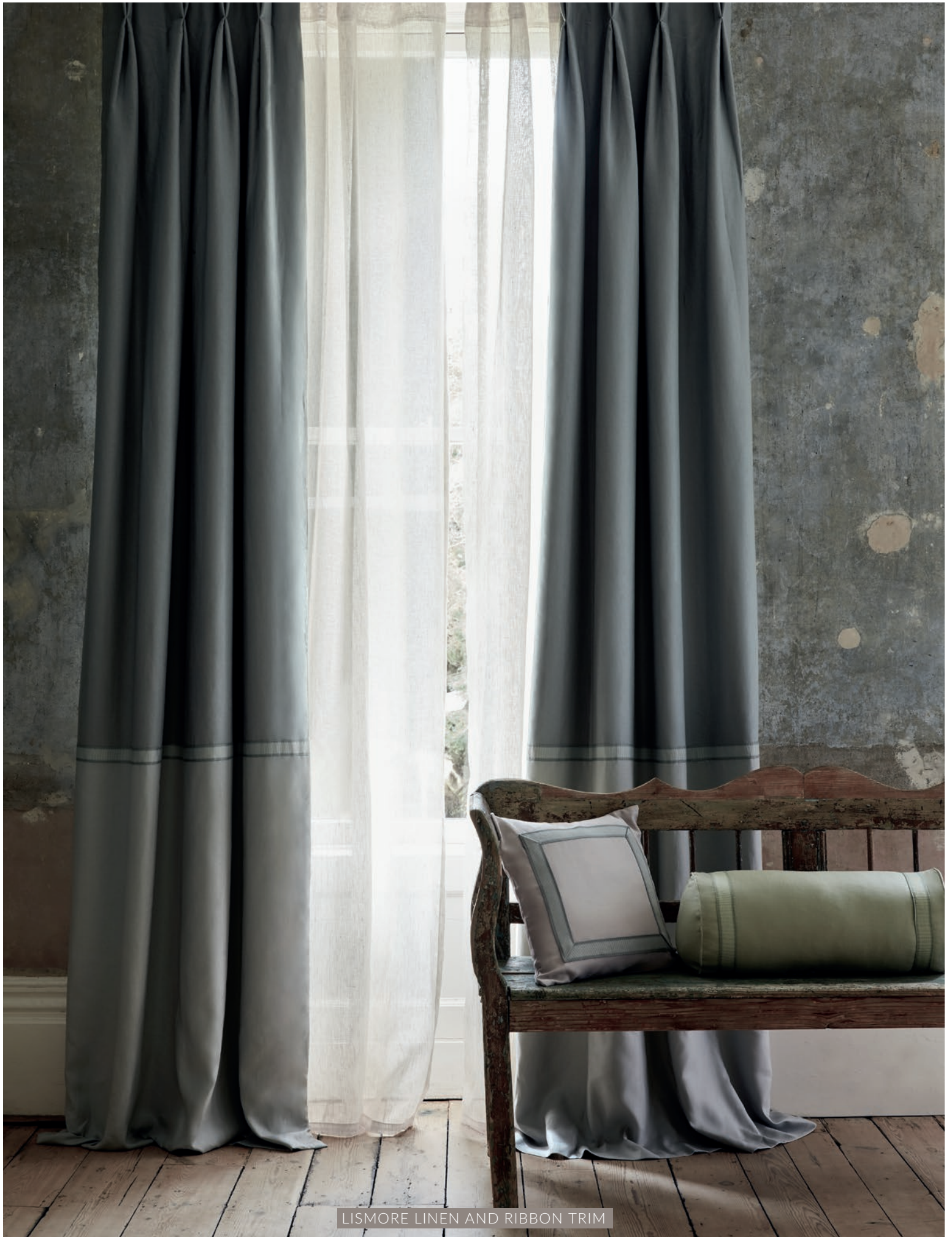
LISMORE LINEN AND RIBBON TRIM