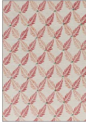
KNOT GARDEN 3 COLORWAYS (31659)