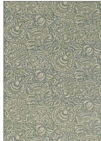
GARDYNE 5 COLORWAYS (31657)