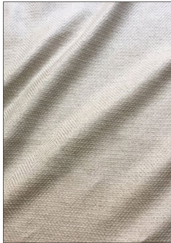
HAMPTON 1 COLORWAY (31660)