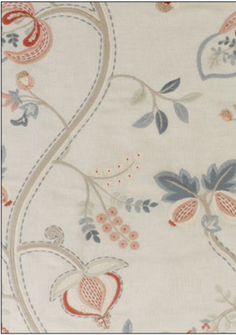
ELIZABETH 2 COLORWAYS (31654)