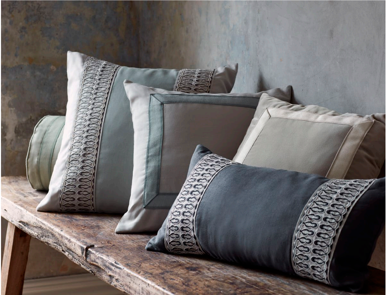
LISMORE LINEN WITH TUDOR BRAID & RIBBON TRIM