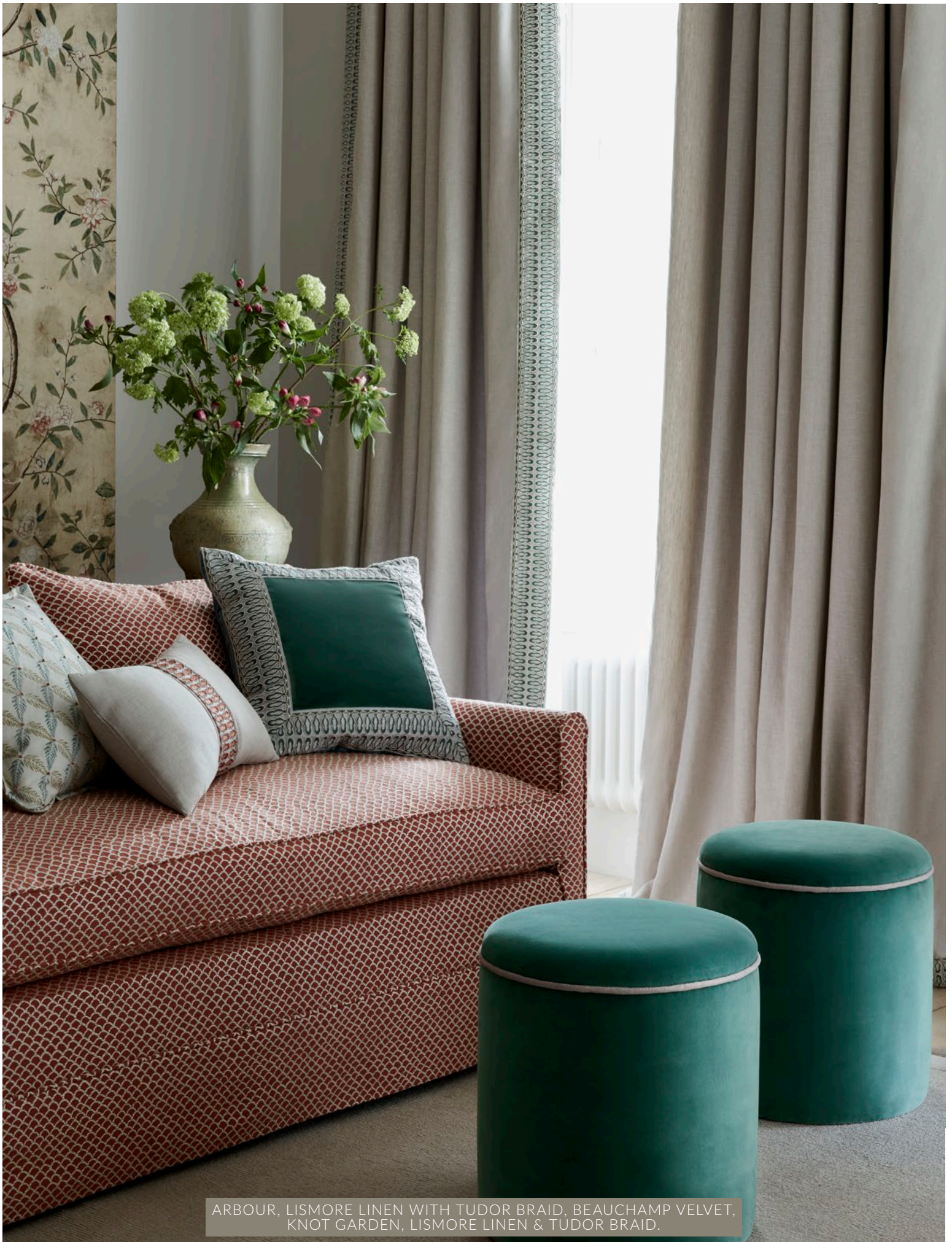
ARBOUR, LISMORE LINEN WITH TUDOR BRAID, BEAUCHAMP VELVET, KNOT GARDEN, LISMORE LINEN & TUDOR BRAID.