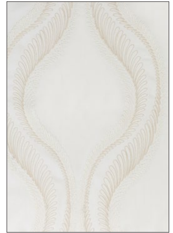
MEANDER 2 COLORWAYS (31656)