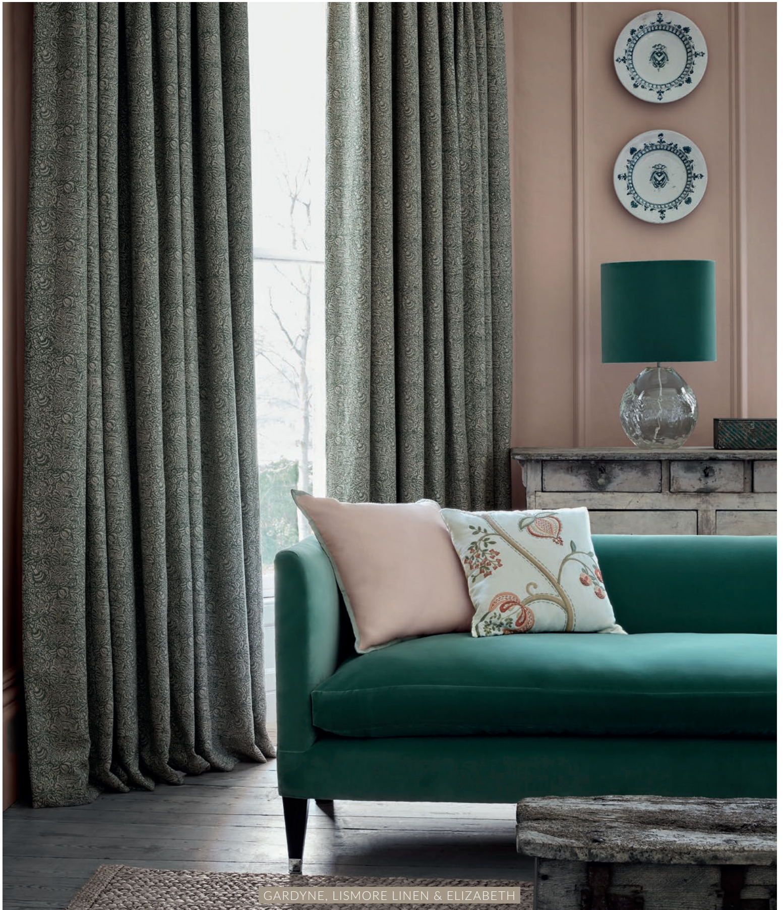
GARDYNE, LISMORE LINEN & ELIZABETH