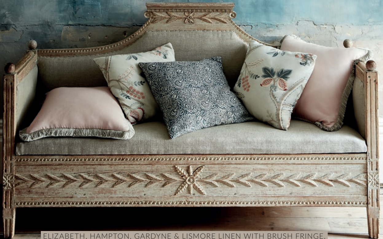
ELIZABETH, HAMPTON, GARDYNE & LISMORE LINEN WITH BRUSH FRINGE.