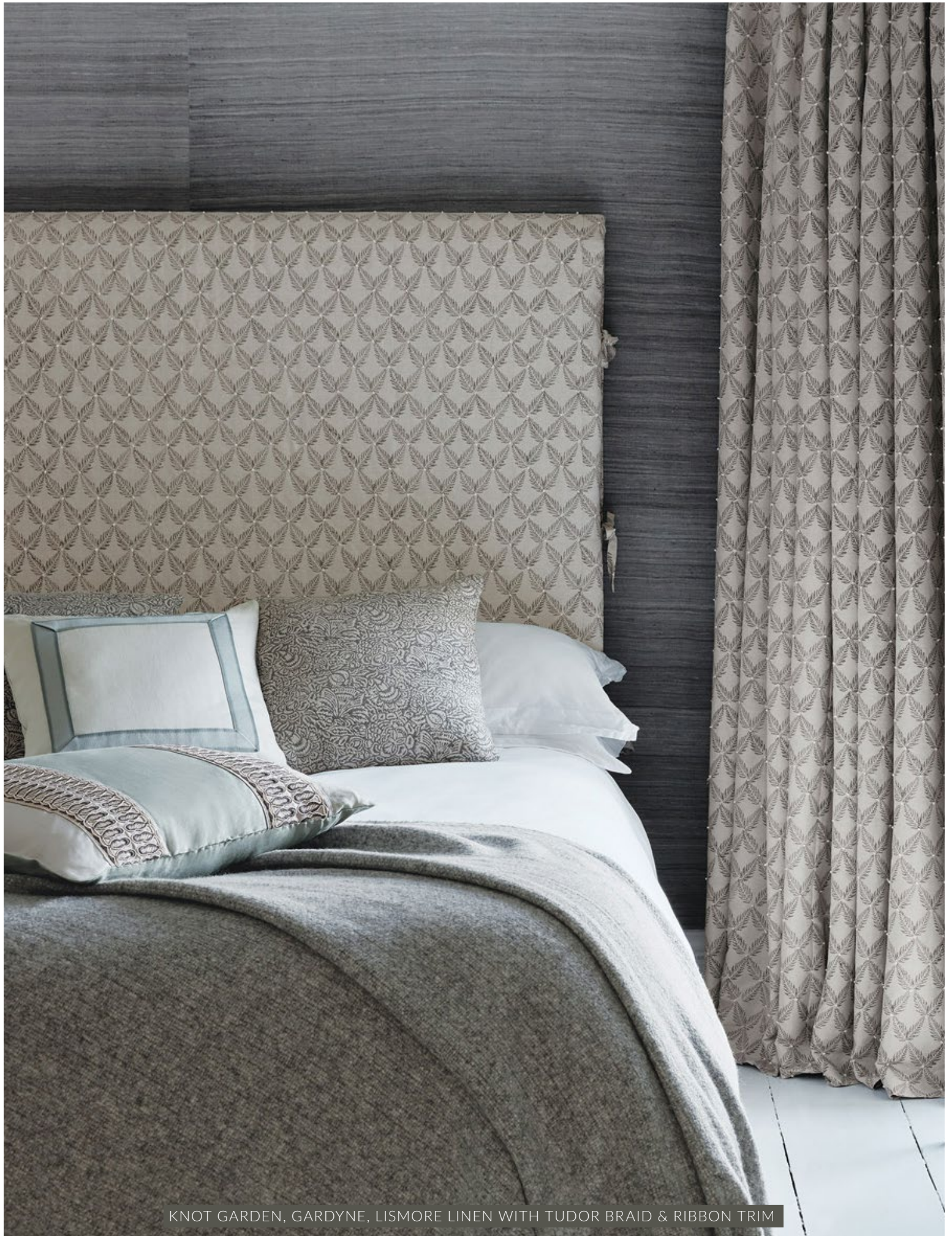
KNOT GARDEN, GARDYNE, LISMORE LINEN WITH TUDOR BRAID & RIBBON TRIM