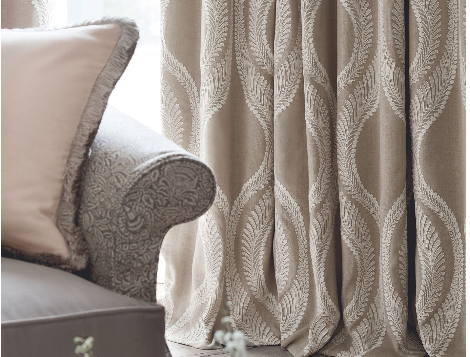
MEANDER, GARDYNE, LISMORE LINEN WITH BRUSH FRINGE.