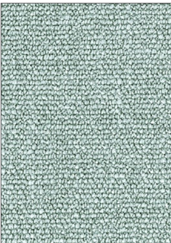
AREZZO 8 COLORWAYS (B8 AREZ)