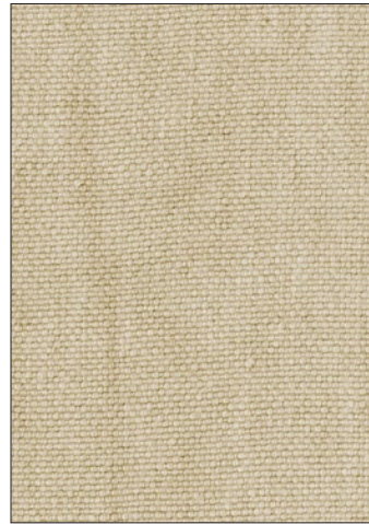
CANDELA 31 COLORWAYS (B8 CANL) CANDELA WIDE (B8 CANLW)