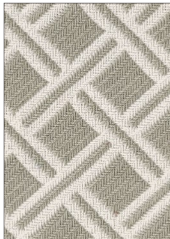
PETER 5 COLORWAYS (B8 PETE)