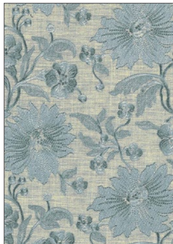
NINA 4 COLORWAYS (B8 NINA)