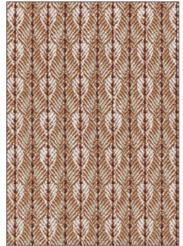
PARANOA 6 COLORWAYS (B8 PARO)