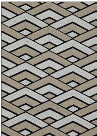
GRAZIA 5 COLORWAYS (B8 GRAZ)