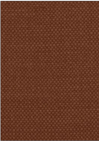
ASPEN BRUSHED 110 COLORWAYS (B8 7112) ASPEN BRUSHED WIDE (B8 1100)