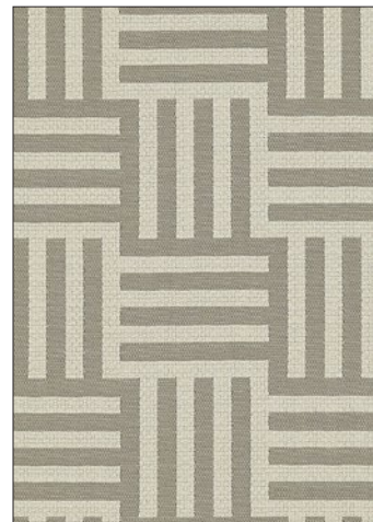
PIANO 5 COLORWAYS (B8 PIAN)

HORIZONS IS A SELECTION FROM THE ALHAMBRA COLLECTIONS: ASPEN III, BRAZILIA, TOSCANA AND MANHATTAN.