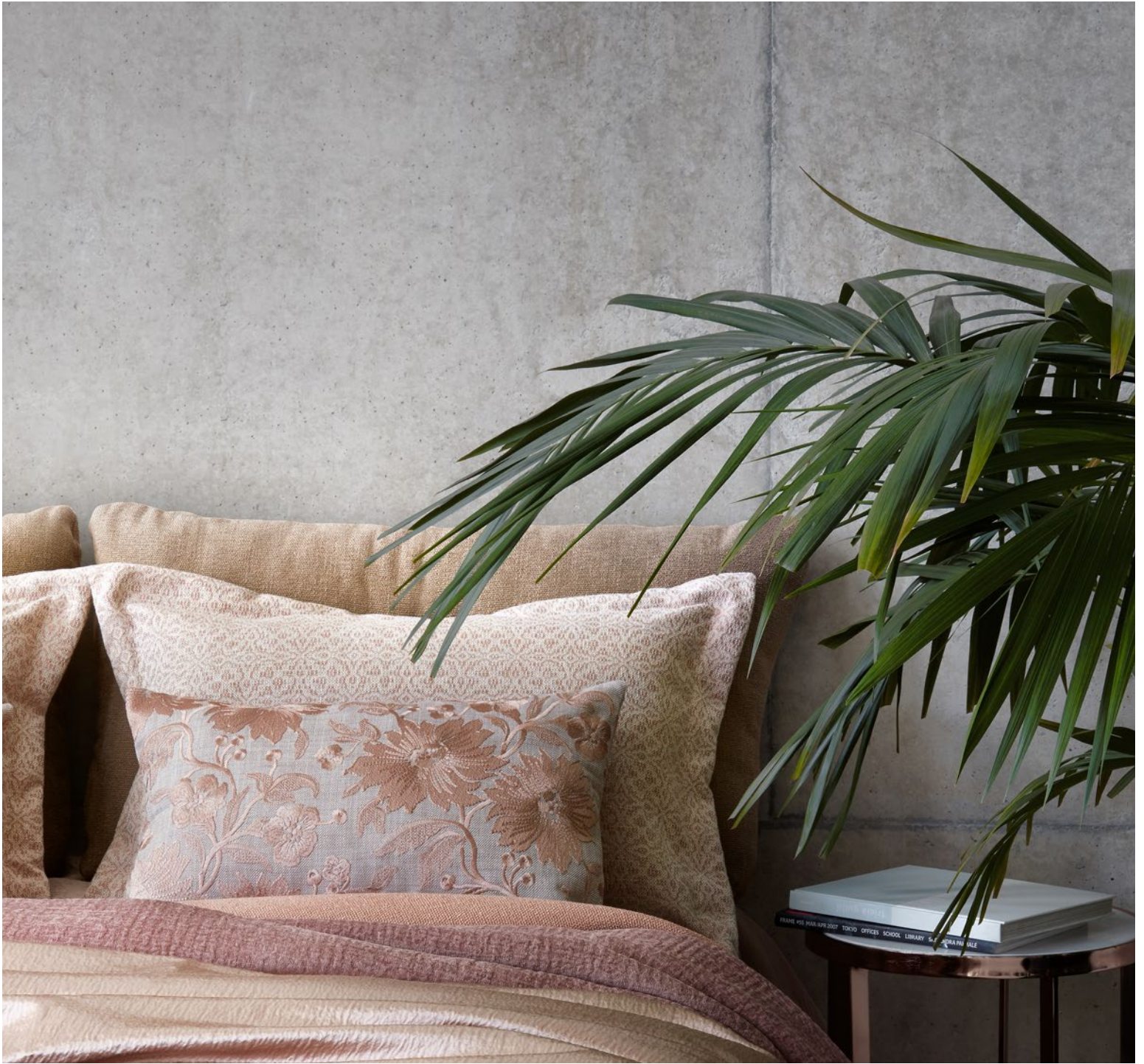
PIENZA, NINA & ZEN SATIN