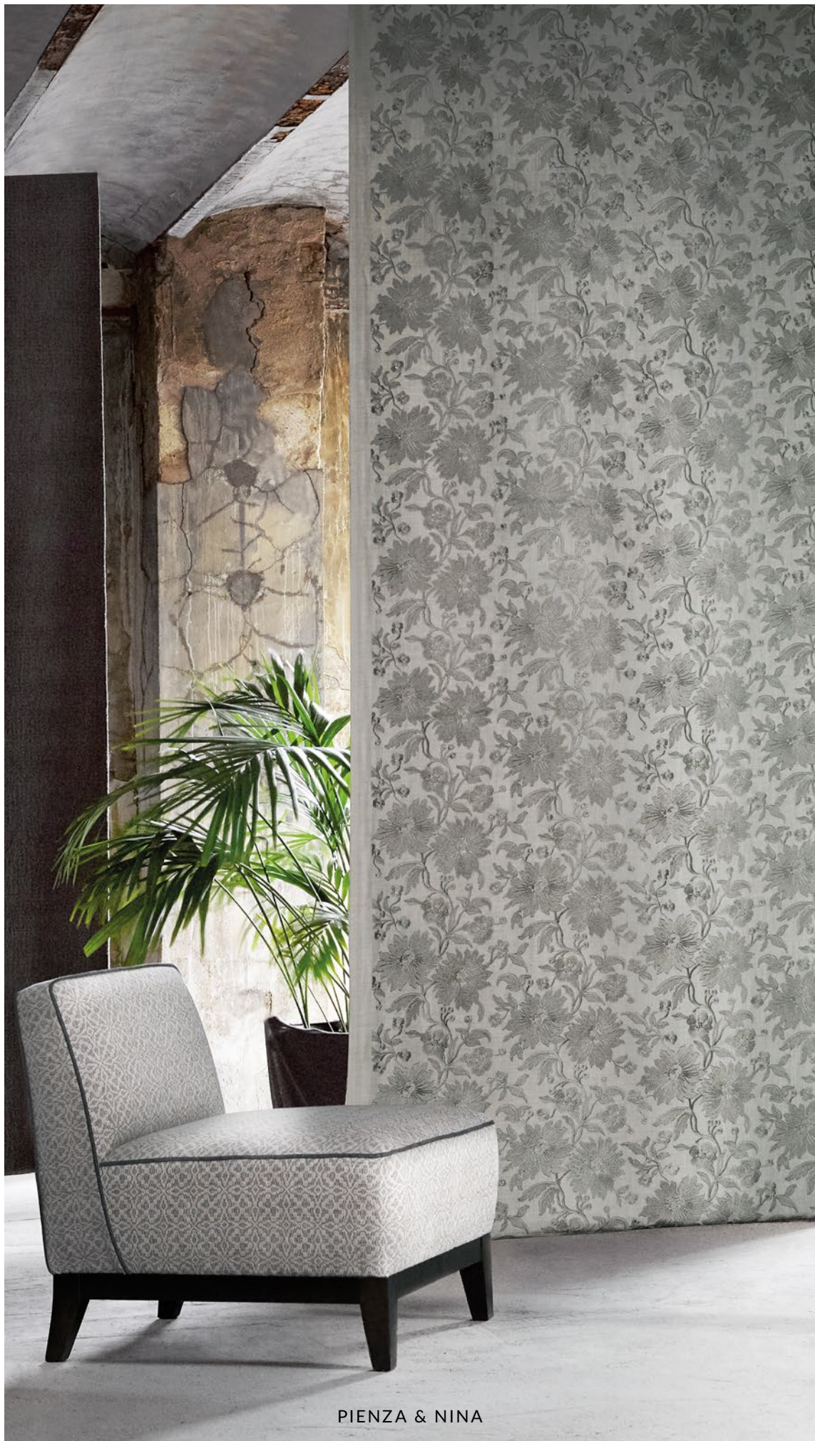
PIENZA & NINA