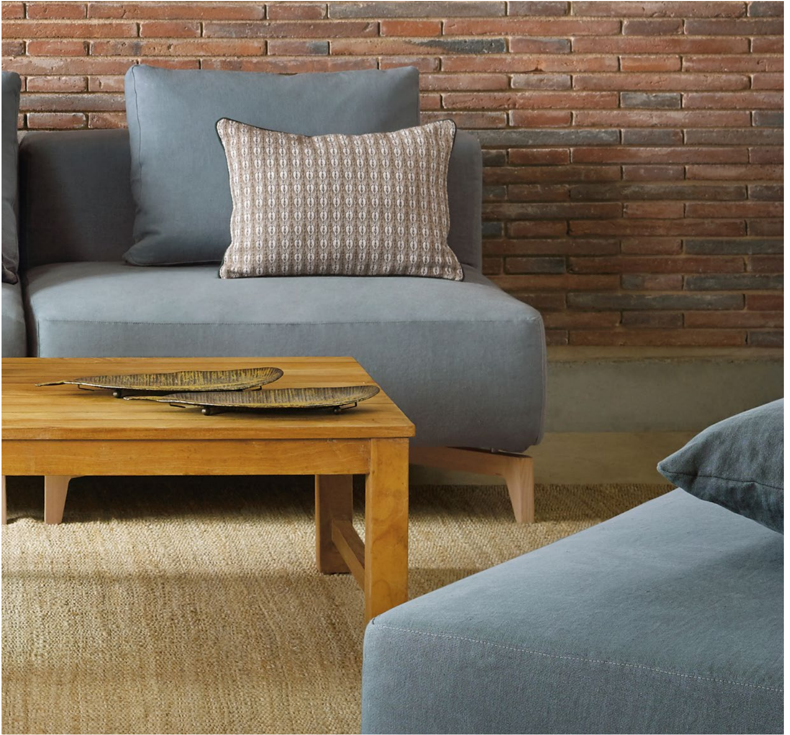
PARANOIA & CANDELA