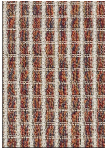
ALEXANIA 3 COLORWAYS (B8 ALEX)