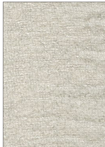
WIND 5 COLORWAYS (B8 WIND)