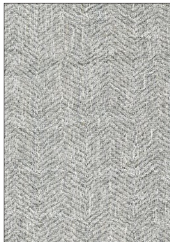
MAISHA 3 COLORWAYS (B8 MAIS)