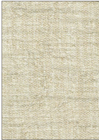
BRUMA 5 COLORWAYS (B8 BRUM)