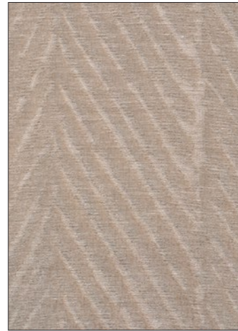
DASHA 3 COLORWAYS (B8 DASH)