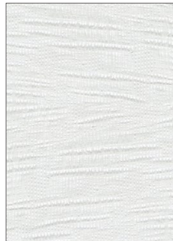
RAIN 2 COLORWAYS (B8 RAIN)