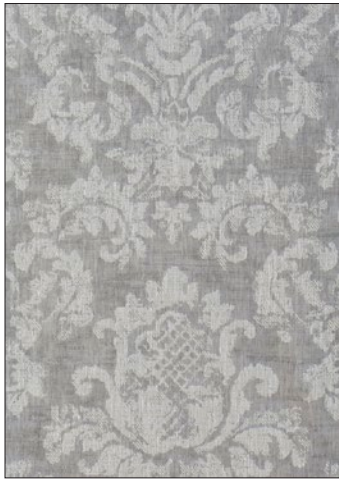
BELLA 2 COLORWAYS (B8 BELA)