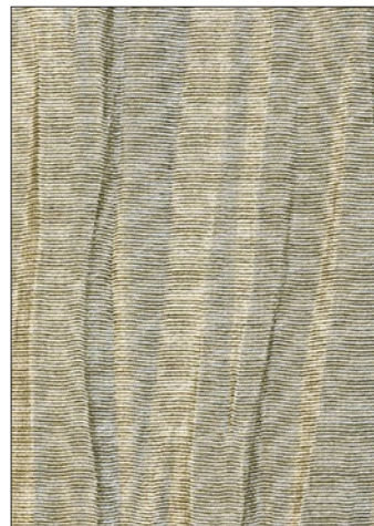
ZAMA 3 COLORWAYS (B8 ZAMA)