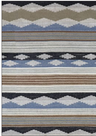
L'ESPRIT AFRICAIN FR 5 COLORWAYS (A9 ESPRIT)