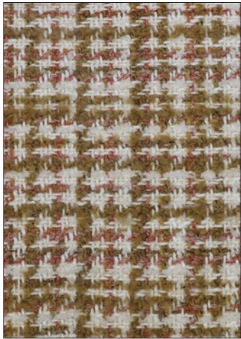
TAILLEUR FR 5 COLORWAYS (A9 TAIL)