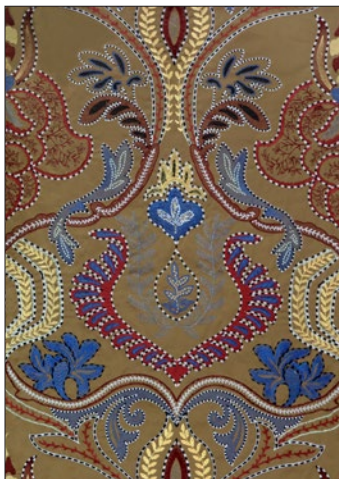
FANTASIE 2 COLORWAYS (A9 FANTA)