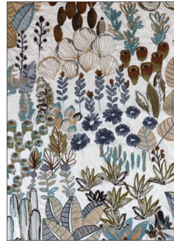
CHRONIQUES DE VOYAGE 3 COLORWAYS (A9 CHRO)