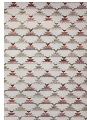
HAUT DÉSERT FR 6 COLORWAYS (A9 HAUT)