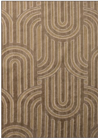
BELLE EPOQUE VELVET 7 COLORWAYS (A9 BELL)