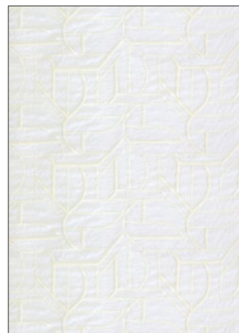
INFLUENCE 1 COLORWAY (A9 INFLU)