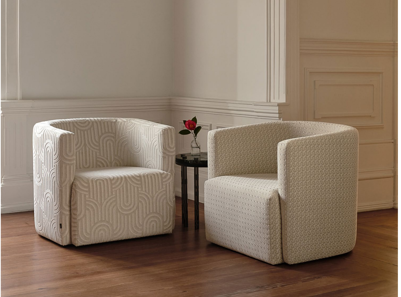
BELLE EPOQUE VELVET & FRISSON VELVET