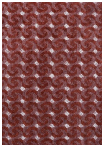
FRISSON VELVET 7 COLORWAYS (A9 FRISSON)