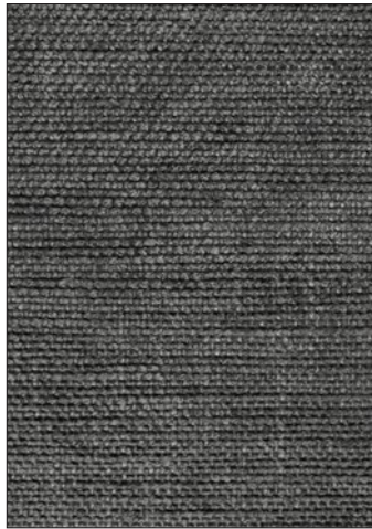
MÉRIDIENNE FR 12 COLORWAYS (A9 MERI)