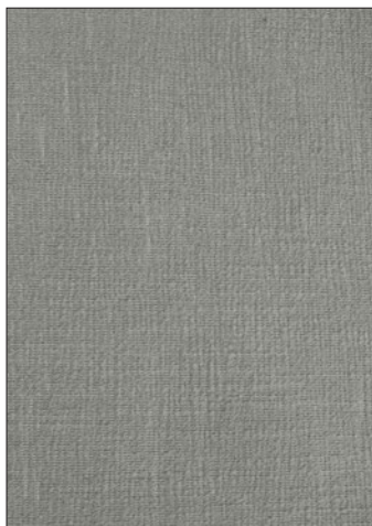
VOYAGEUR-REVERSIBLE 9 COLORWAYS (A9 VOYA)