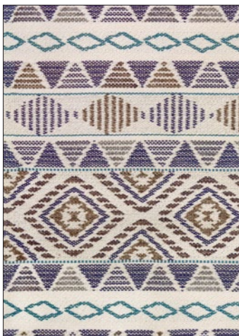
INDIGÈNE 3 COLORWAYS (A9 INDI)