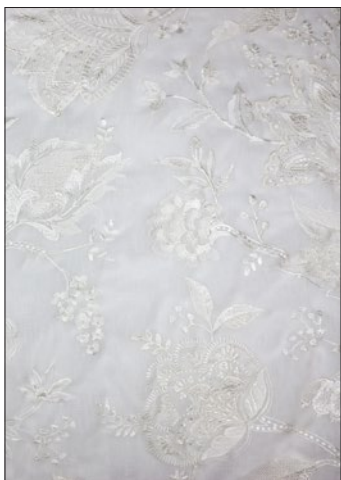
VOLUPTÉ DE LA VIE 1 COLORWAY (A9 VOLU)