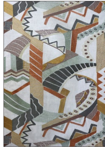
LA VIE 3 COLORWAYS (A9 LAVIE)