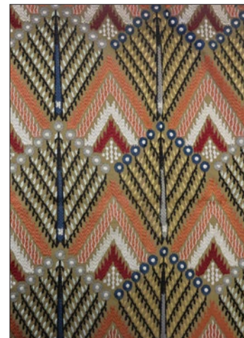
SAVOIR-FAIRE 3 COLORWAYS (A9 SAVOIR)