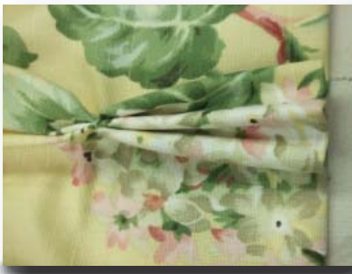
3 Finger Pleat