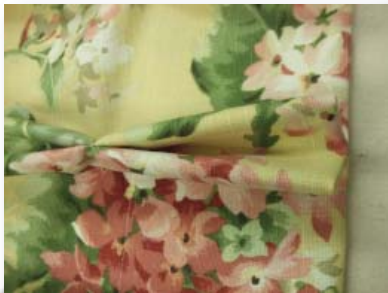
2 Finger Pleats