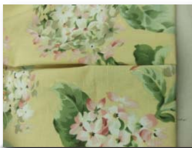
Inverted Box Pleat