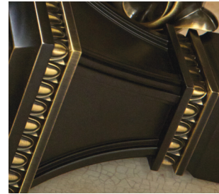
Classic, architectural design details, simple lines and ornamental repeats make a statement.