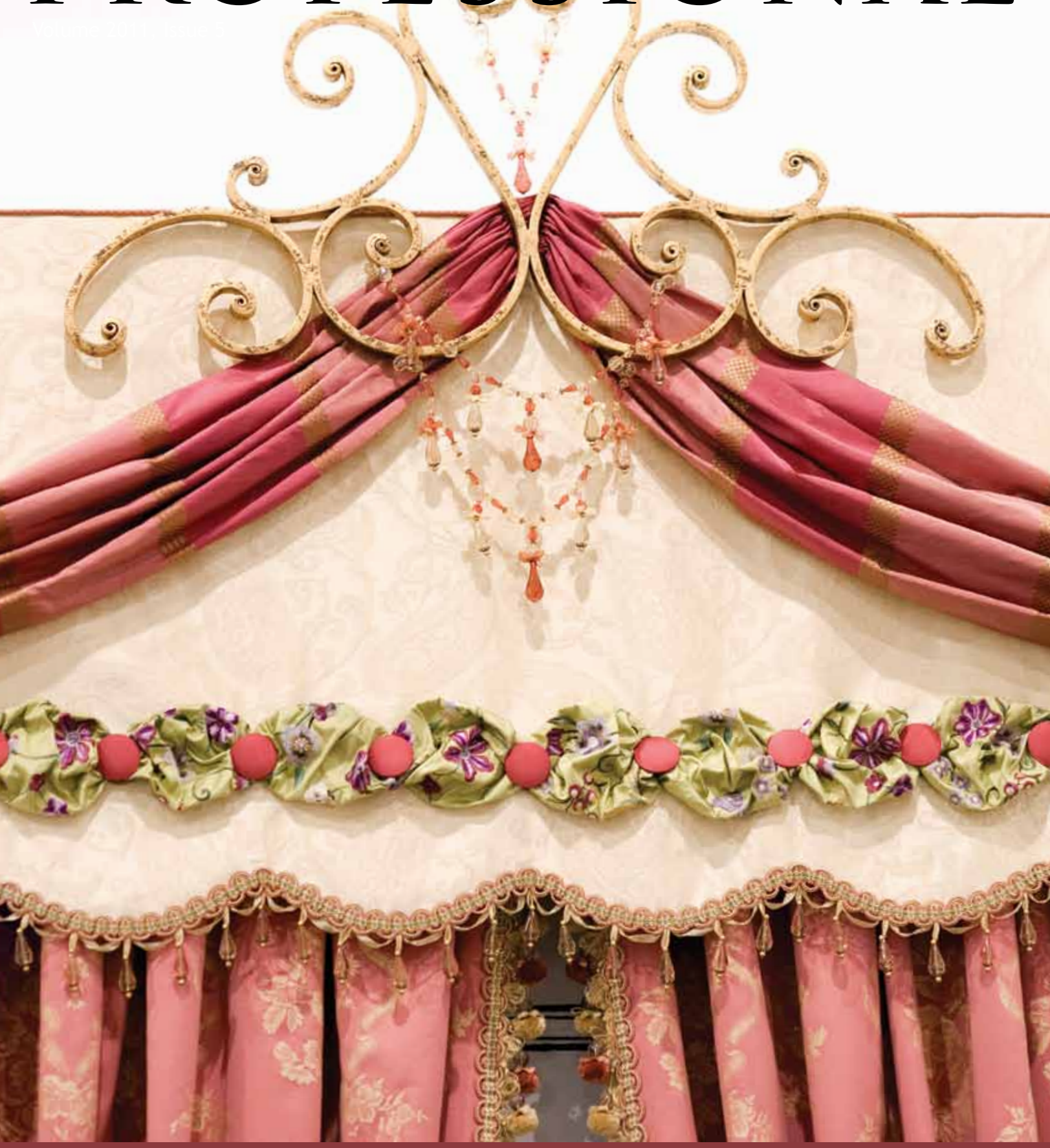
Serving the Custom Home Furnishings Industry since 1993