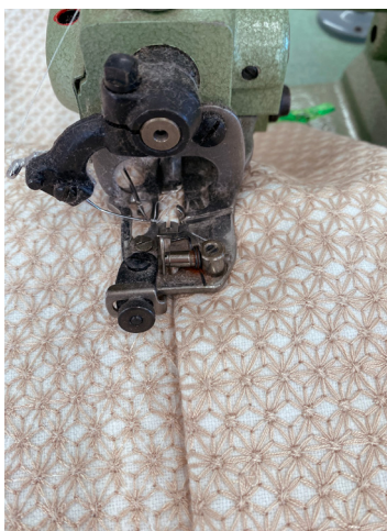
Table the Drapery Panels