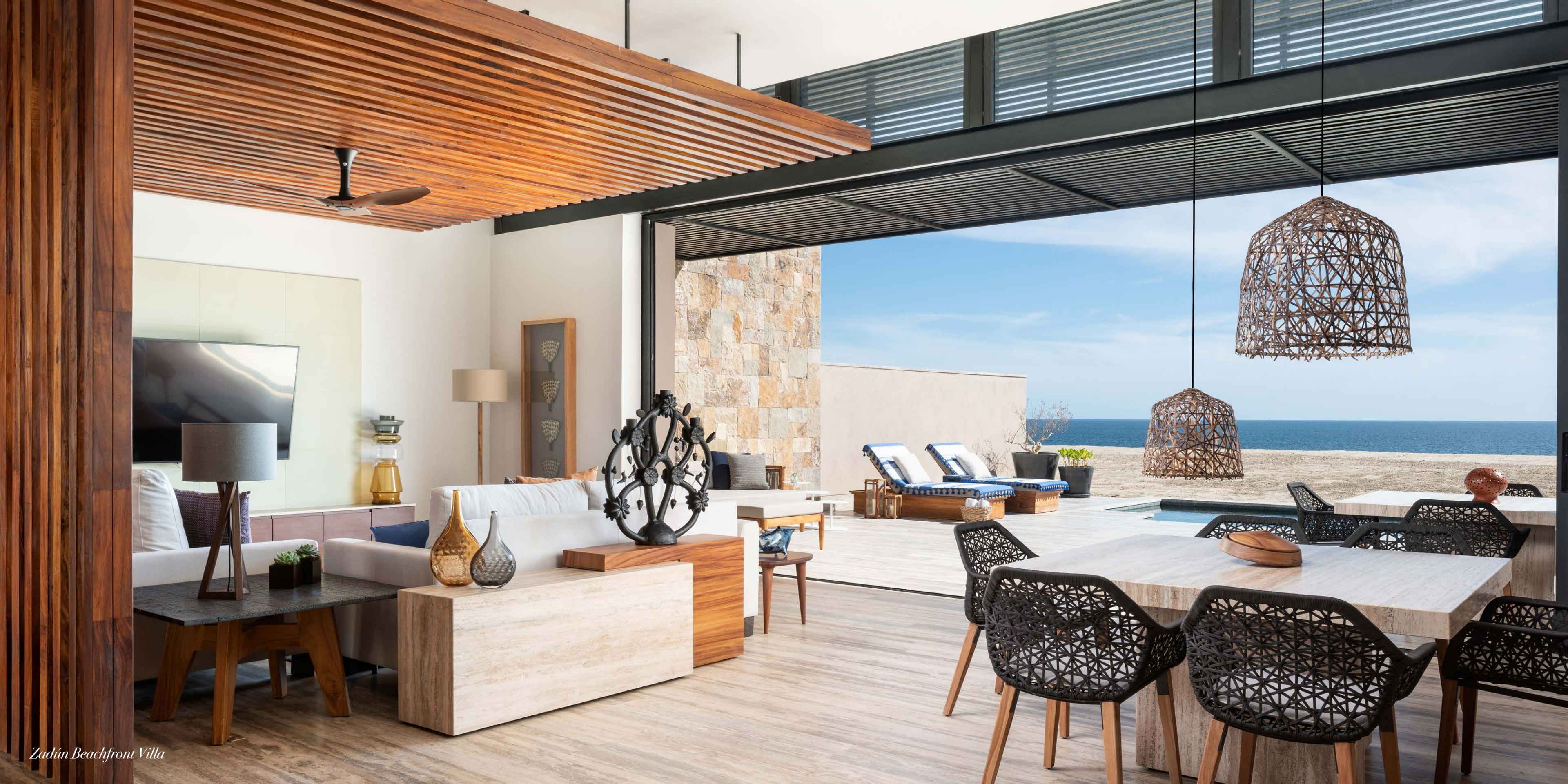
Zadún Beachfront Villa