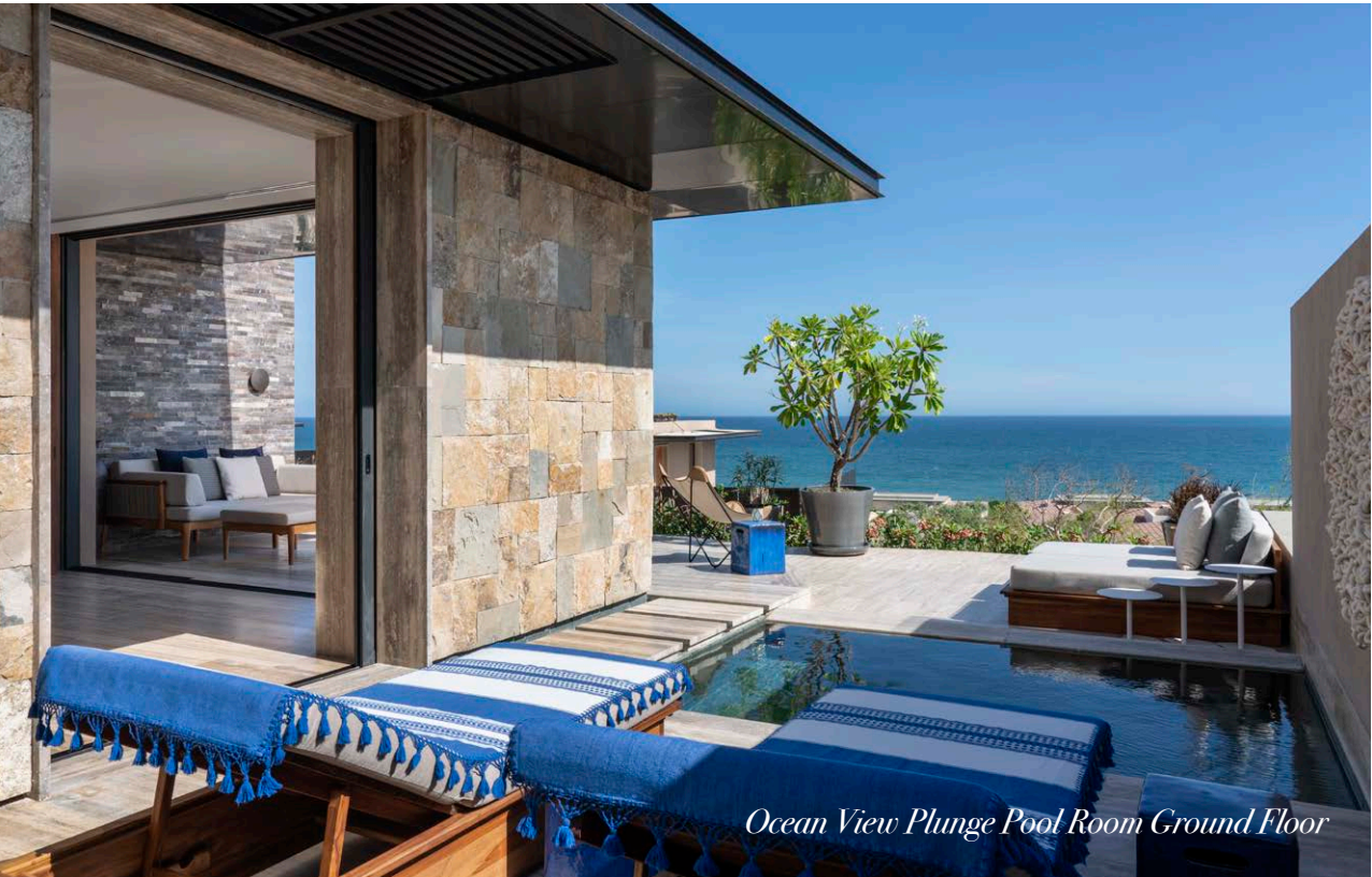
Ocean View Plunge Pool Room Ground Floor