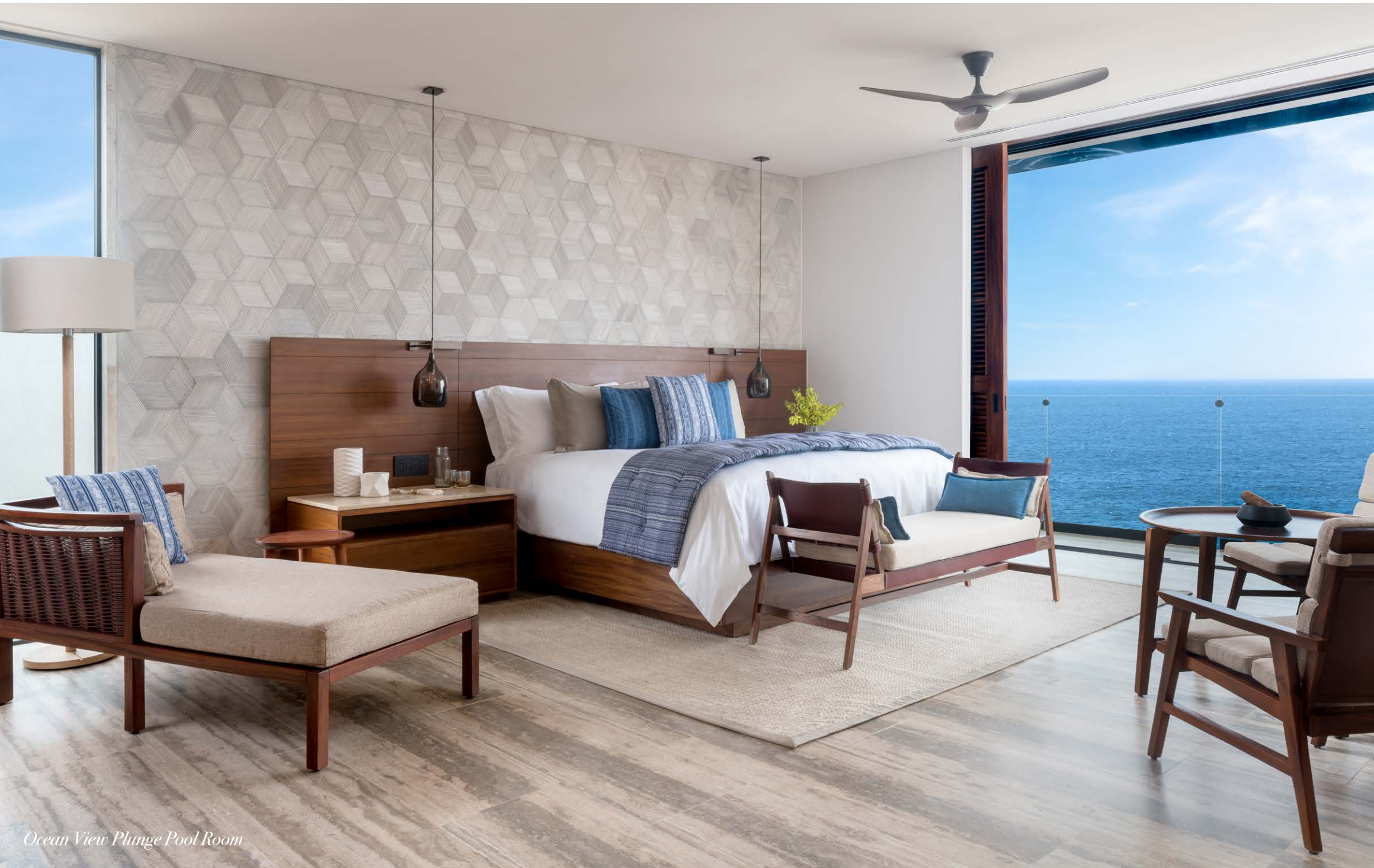
Ocean View Plunge Pool Room