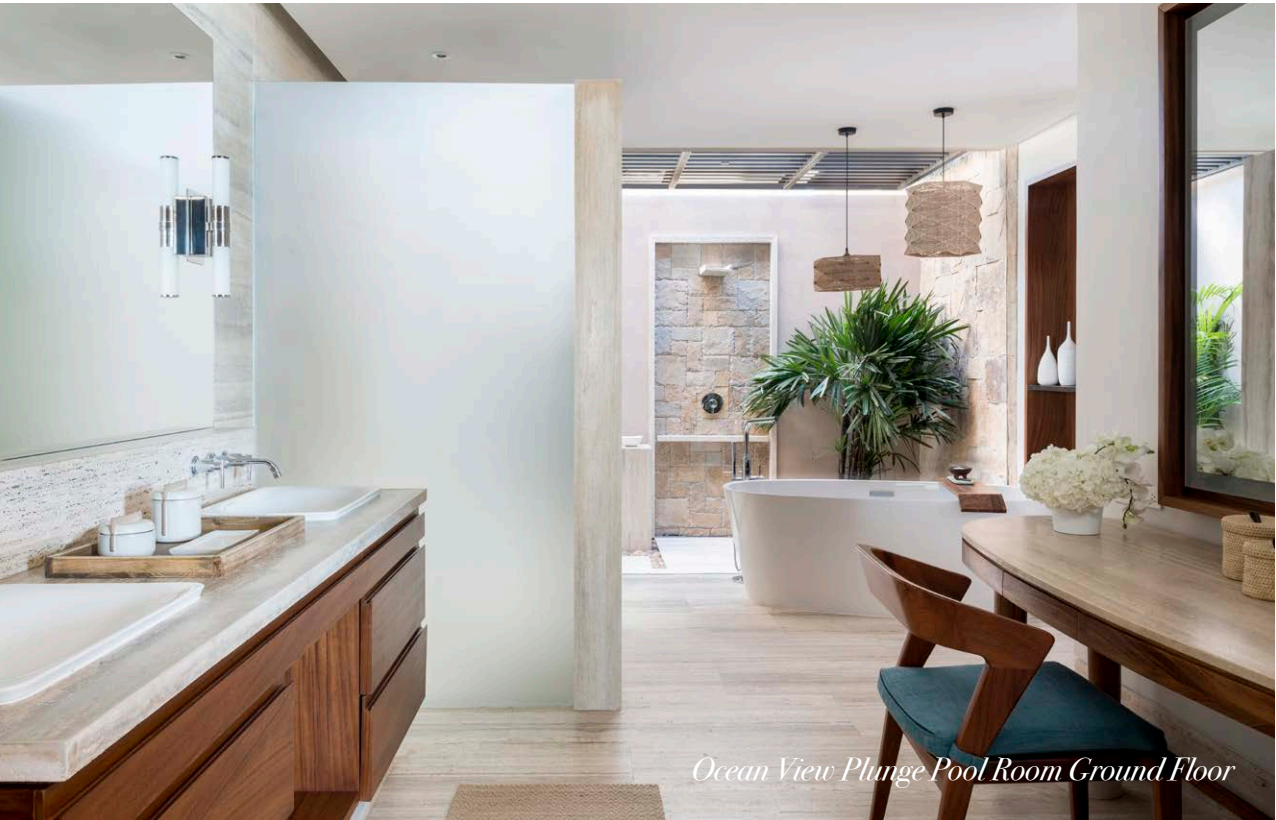
Ocean View Plunge Pool Room Ground Floor