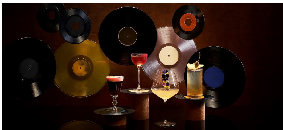
(From left to right: Kim Sisters, Velvet Underground, Pop Yeh Yeh, and Fab Four)