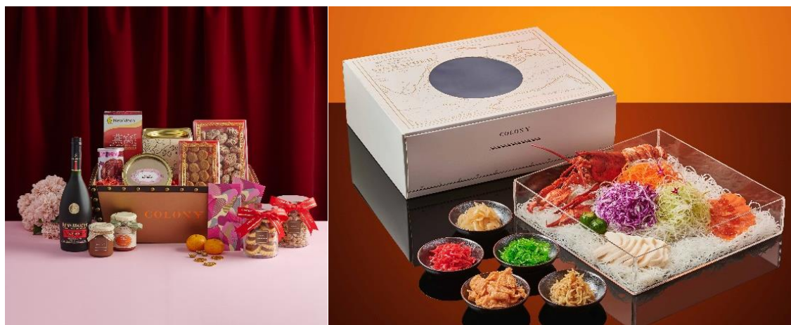
(From left to right: Auspicious Hamper, Boston Lobster, Sea Whelk and Smoked Salmon Yu Sheng)

Our selection of handcrafted prosperity goodies from Colony Bakery such as pineapple balls, nian gao and love letters, are perfect for bringing along to your reunion celebrations. Also available for takeaway is the Boston lobster, sea whelk and smoked salmon yu sheng that is priced from SGD 198 each, and serves six to eight persons.