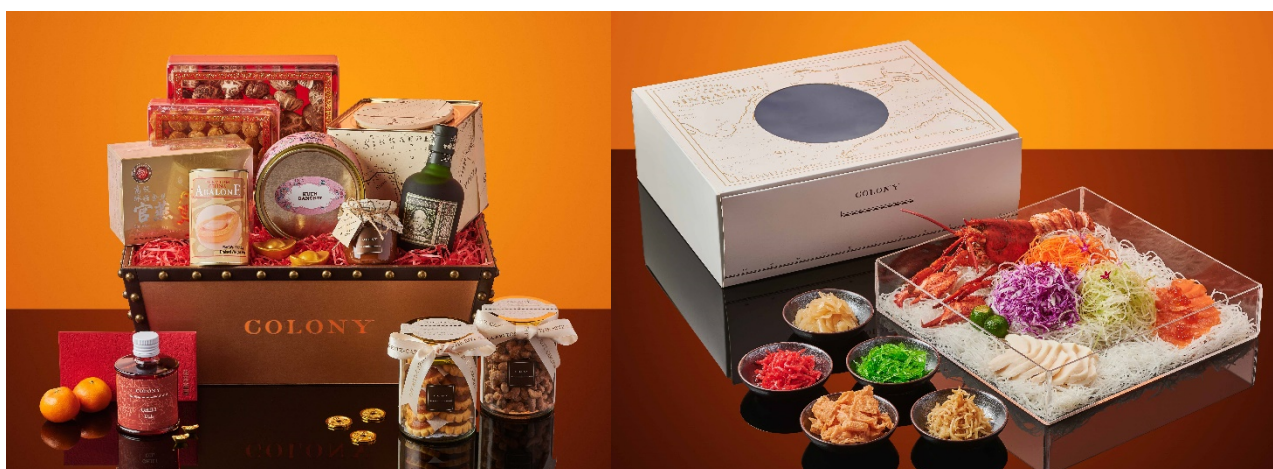
(From left to right: Auspicious Hamper; Boston Lobster, Sea Whelk & Salmon Yu Sheng)

Our selection of handcrafted prosperity goodies such as pineapple balls, nian gao and corn flake rice crispies, are perfect for bringing along to your reunion celebrations.