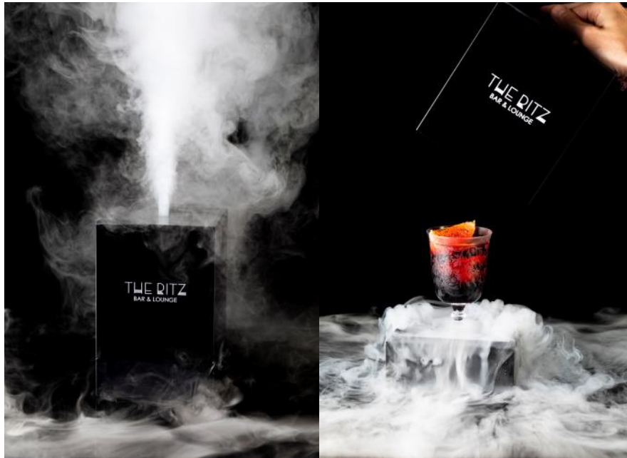
Mystery Box - Bitter

NEWLY-APPOINTED BEVERAGE AND BAR MANAGER TURAL HASANOV LAUNCHES INSPIRATIONAL COCKTAIL MENUS IN THE HIDDEN BAR OF THE RITZ BAR & LOUNGE/page 4