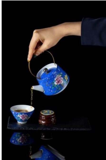
Ye Shanghai Cocktail

10% of the amount earned from this cocktail will be contributed to supporting restoration programs of cultural heritage sites and buildings of our home, Shanghai.