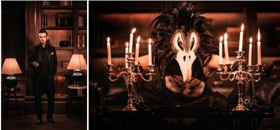
A mystery introduction to the anniversary party

The elegant yet sensational show combines different style acts such as dancing, acrobatics and physical theatre in a dynamic and engaging atmosphere and settings – let's get all of your senses tantalized by the dark aesthetic.