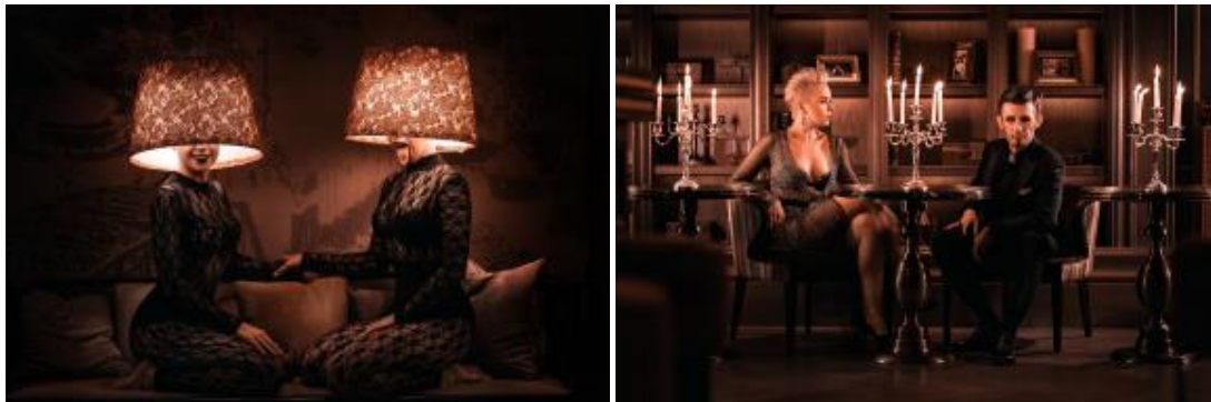
Dancing/ acrobatics in costumes