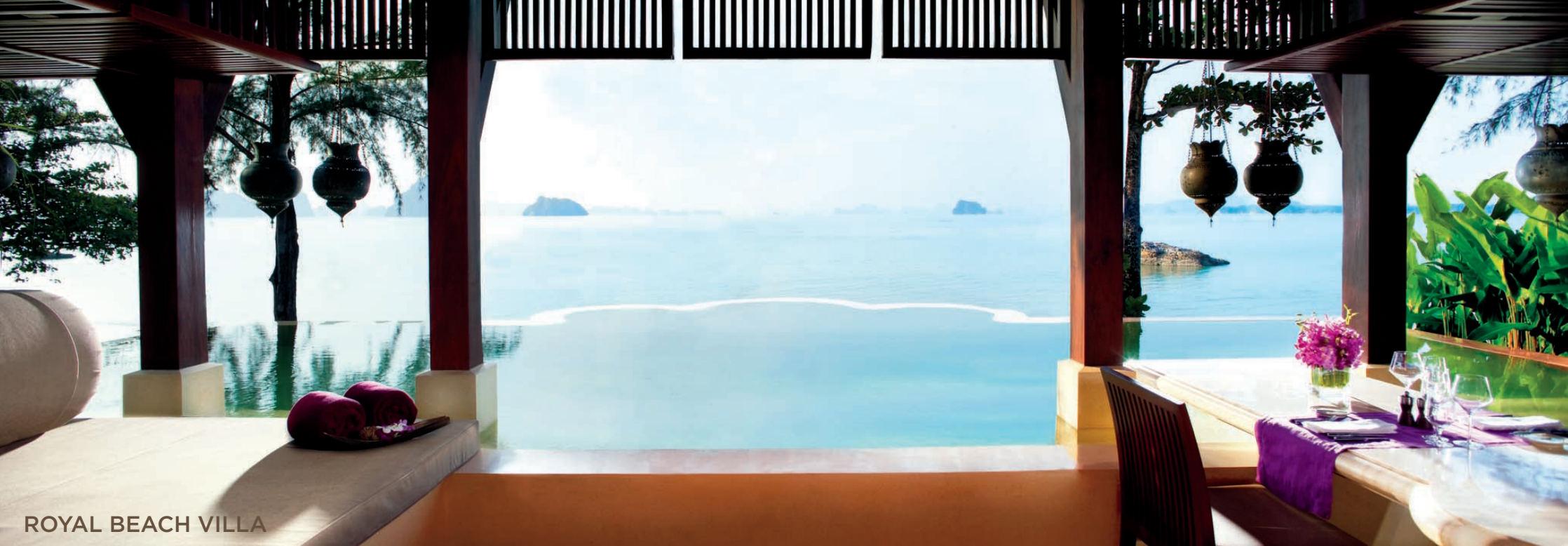
ROYAL BEACH VILLA