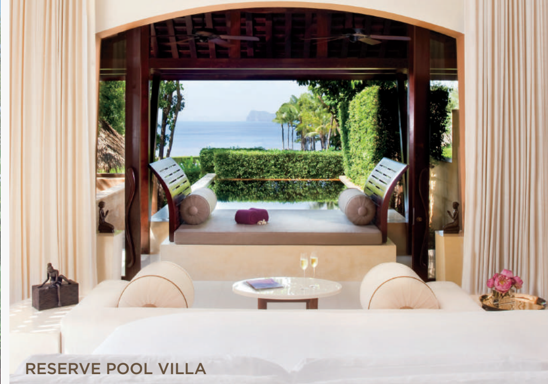
RESERVE POOL VILLA