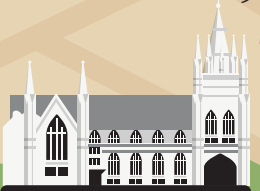
St. Andrew's Cathedral