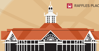
Lau Pa Sat