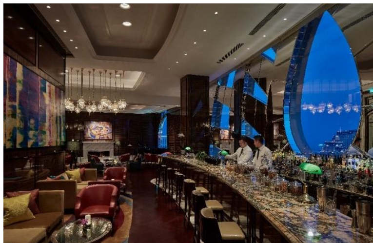
The Ritz Carlton Bar & Lounge