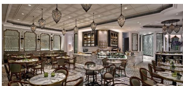
The Ritz-Carlton Café offers 6-course Prix Fixe Dinner on New Year's Eve and New Year's Day