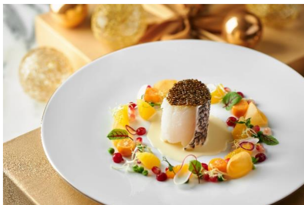
The Ritz-Carlton Café – New Year's Eve & New Year Prix Fixe - Patagonian Toothfish