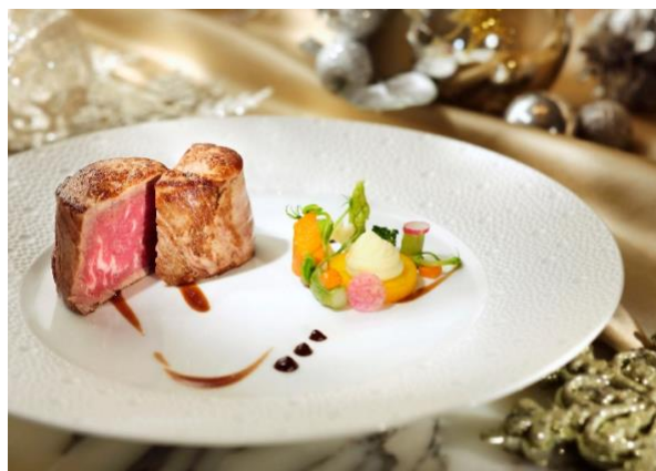
The Ritz-Carlton Café – New Year's Eve & New Year Prix Fixe – Australian Wagyu M7 Beef Tenderloin