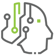
AI Math Model