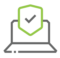
Update AI Math Model

Visit cylance.com/AI to learn more about applying AI to modern security challenges