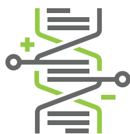
Extract DNA of Files