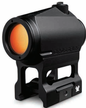
High Mount / Lower \frac{1}{3} Co-Witness