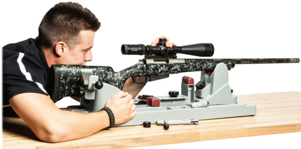
Visually bore-sighting a rifle.