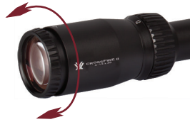
Adjust the reticle focus

Once this adjustment is complete, it will not be necessary to re-focus every time you use the rifle scope. However, because your eyesight may change over time, you should re-check this adjustment periodically.