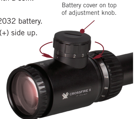
Battery cover on top of adjustment knob.