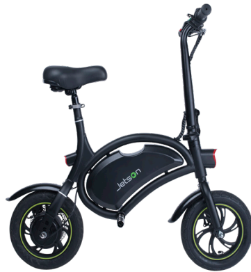
BOLT ELECTRIC FOLDING SCOOTER