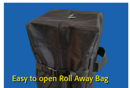
Easy to open Roll Away Bag