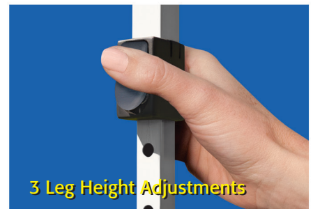
3 Leg Height Adjustments