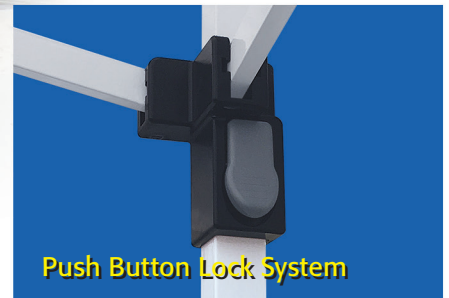
Push Button Lock System

• Sporting Events • Street Fairs • Swap Meets • Community Events