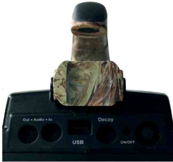
ALPHA DOGG SPEAKER - BACK