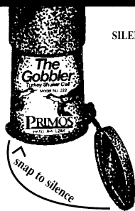
Diagram 1: SILENCER CAP

The patented silencer cap on the end of your call is designed to keep the call from making noise as you move through the woods. It snaps into place until you are in position and ready to call. When ready, slip the cap off and follow the instructions below (See Diagram 1).