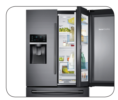
Food Showcase Fridge Door