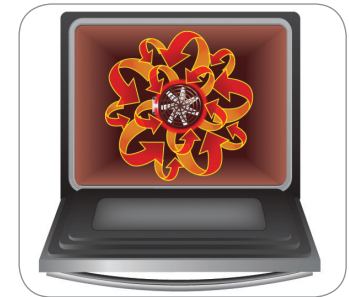
True Convection Oven