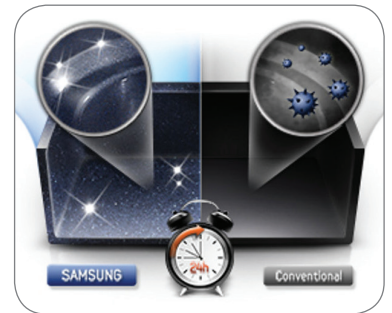
Ceramic Enamel Interior