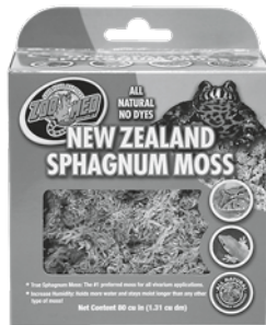
New Zealand Spaghnum Moss