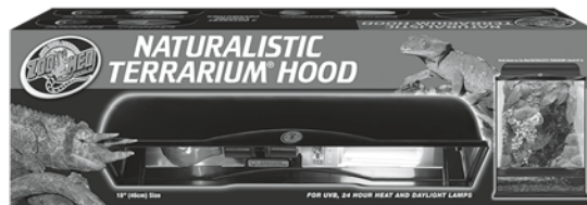
Naturalistic Terrarium Hood®