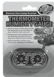
Dual Analog Thermometer & Humidity Gauge