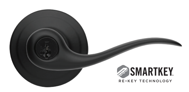
Tustin Lever in Iron Black