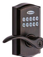
Venetian Bronze 11P