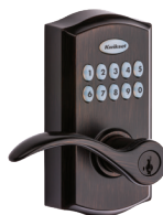
Venetian Bronze 11P