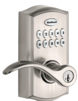
Satin Nickel 15