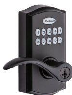
Matte Black 514