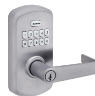
Satin Chrome 26D