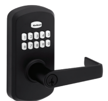
Matte Black 514