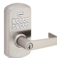
Satin Nickel 15