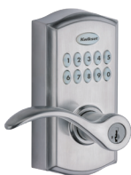
Satin Chrome 26D