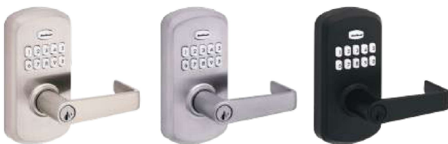
Satin Nickel 15