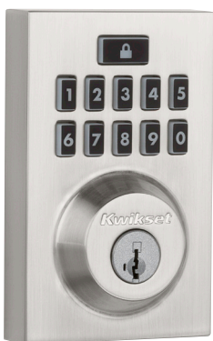
99130-008 Satin Nickel 15 913 CNT 15