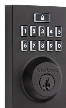
99130-011 Matte Black 514 913 CNT 514

FINISH AND LIFETIME WARRANTY MECHANICAL ONE YEAR ELECTRONIC WARRANTY UN AÑO DE GARANTÍA EN COMPONENTES ELECTRONICOS