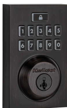
99130-009 Venetian Bronze 11P 913 CNT 11P