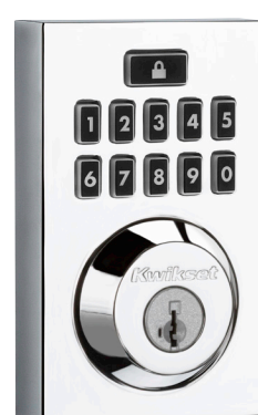
99130-010 Polished Chrome 26 913 CNT 26